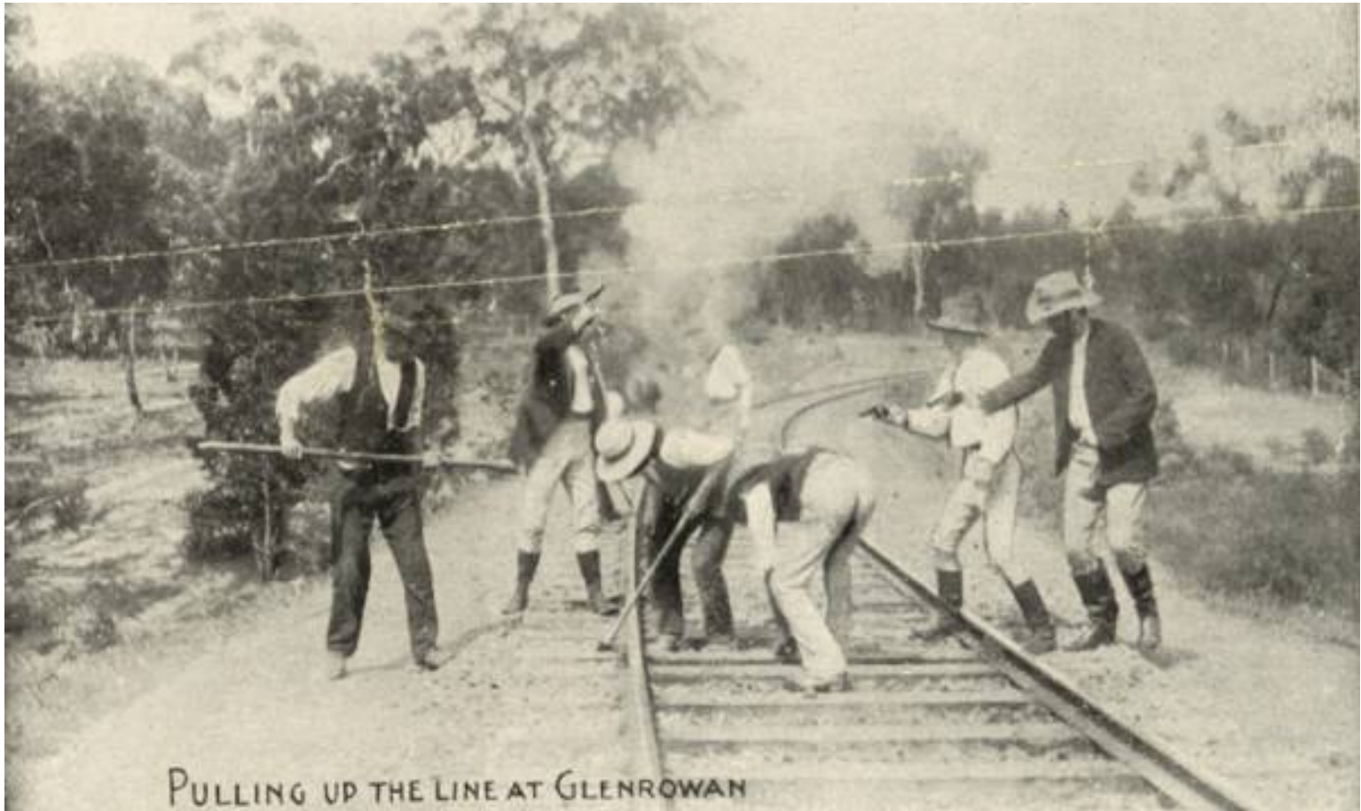
PULLING UP THE LINE AT GLENROWAN