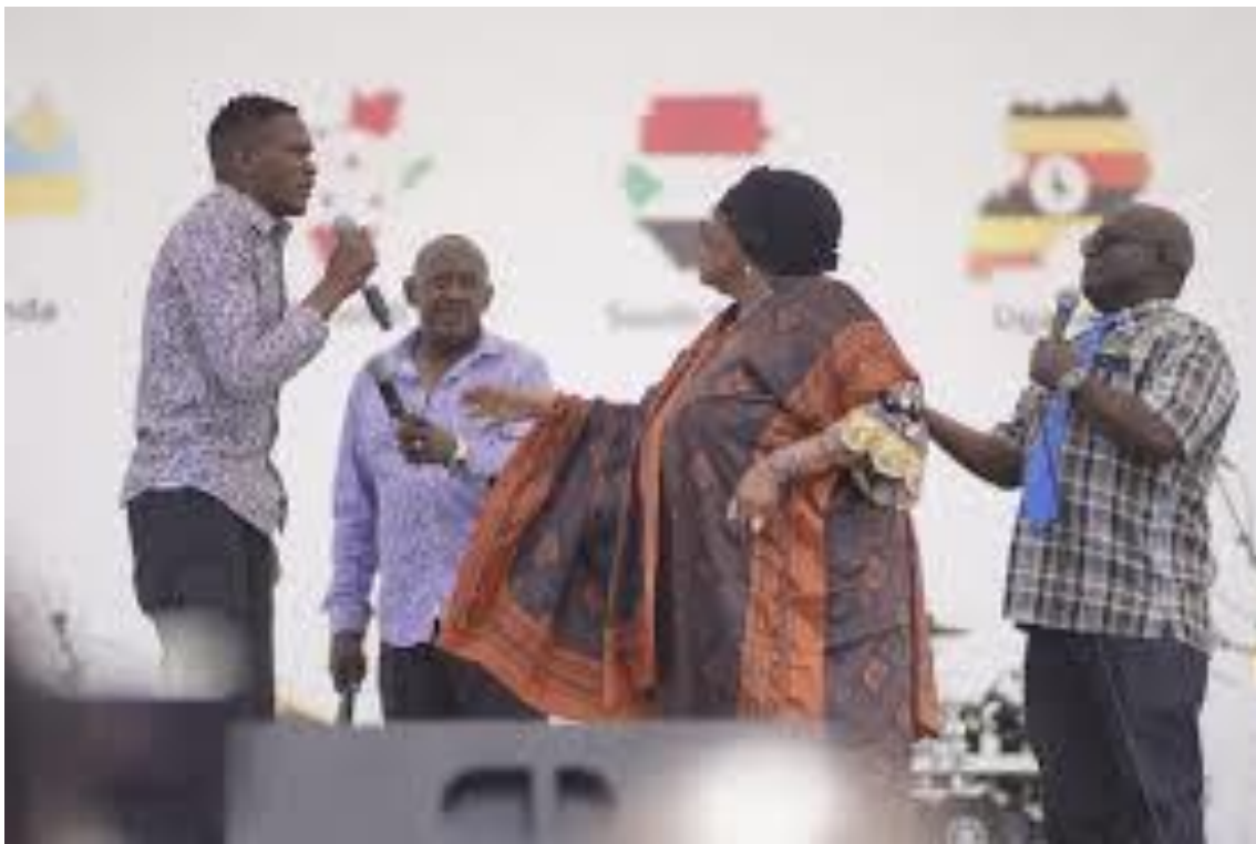
Fig 15: Vitimbi Group Performing during the festival

This is a collaborative type of performing art that utilizes live performers, typically actors or actresses, to present the experience of a real or imagined event before a live audience in a specific place, often a stage. During the festival, most of the theatre performances were held at Taasisi ya Sanaa na Utamaduni (TASUBA) an EAC centre of excellence in the promotion of culture based in Bagamoyo in the south of Tanzania. Kenyan teams, notably Vitimbi comedians and Short Stature comedians, represented the country in this category.