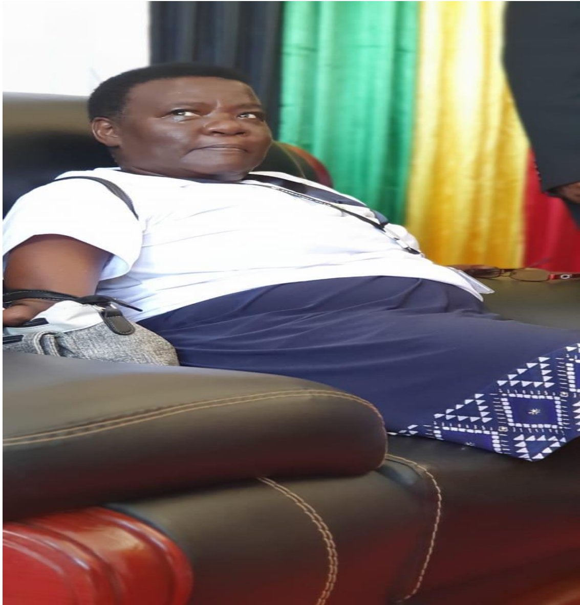
Fig 4: Madam Josephtha O. Mukobe - Principal Secretary, State Department of Culture and Heritage