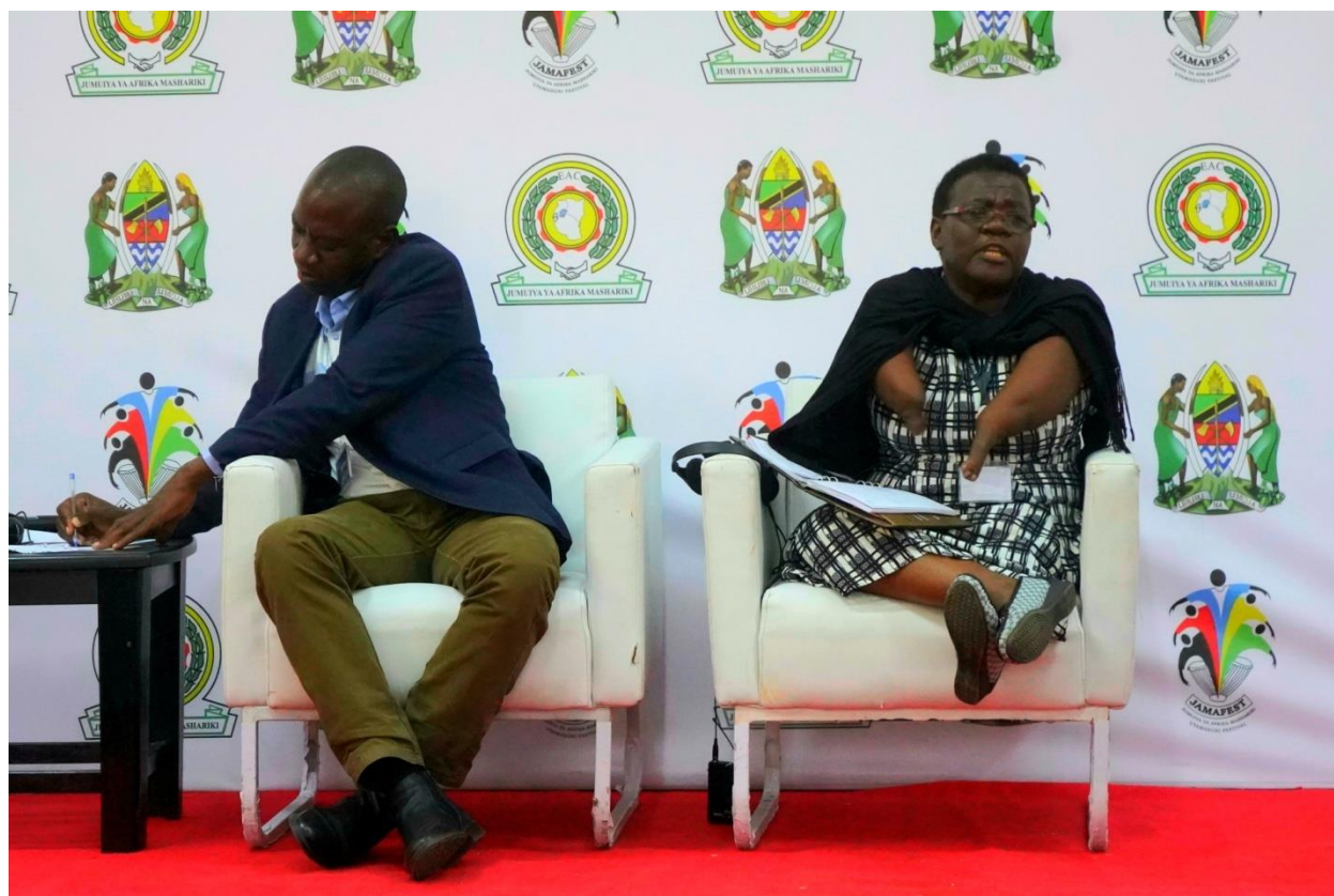
Fig 24: The Principal Secretary giving her views during the symposium

ceremony by the Deputy Secretary General, Productive and Social Sectors at the East African community.