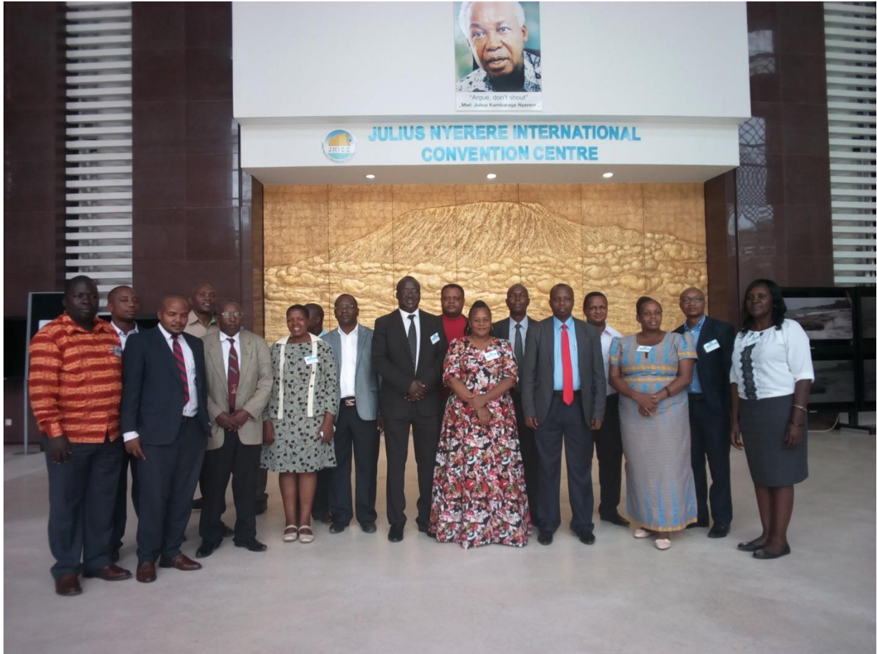
Fig 2: Members of RSC during a health break at the Julius Nyerere International Convention Center.