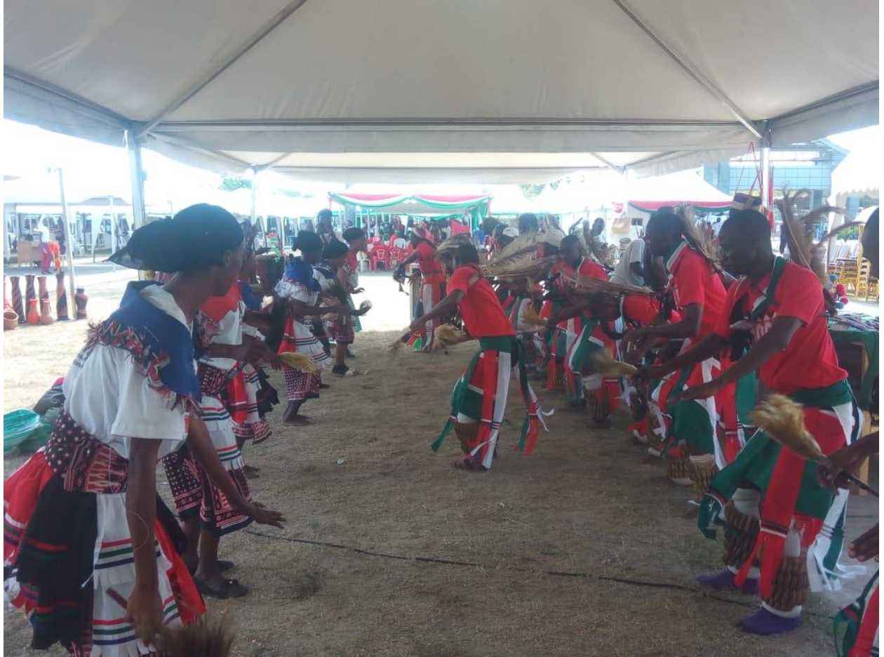
Fig. 28: Gonda Asili dancers from Likoni gala performance