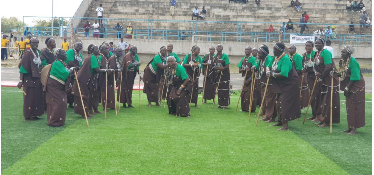
Fig 11: Elimu cultural promoters from Baringo County performing a traditional folk song