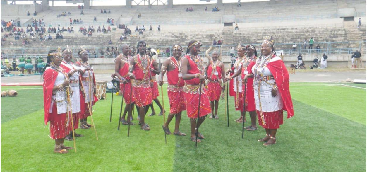
Fig 13: Narok University Maa Cultural Troupe