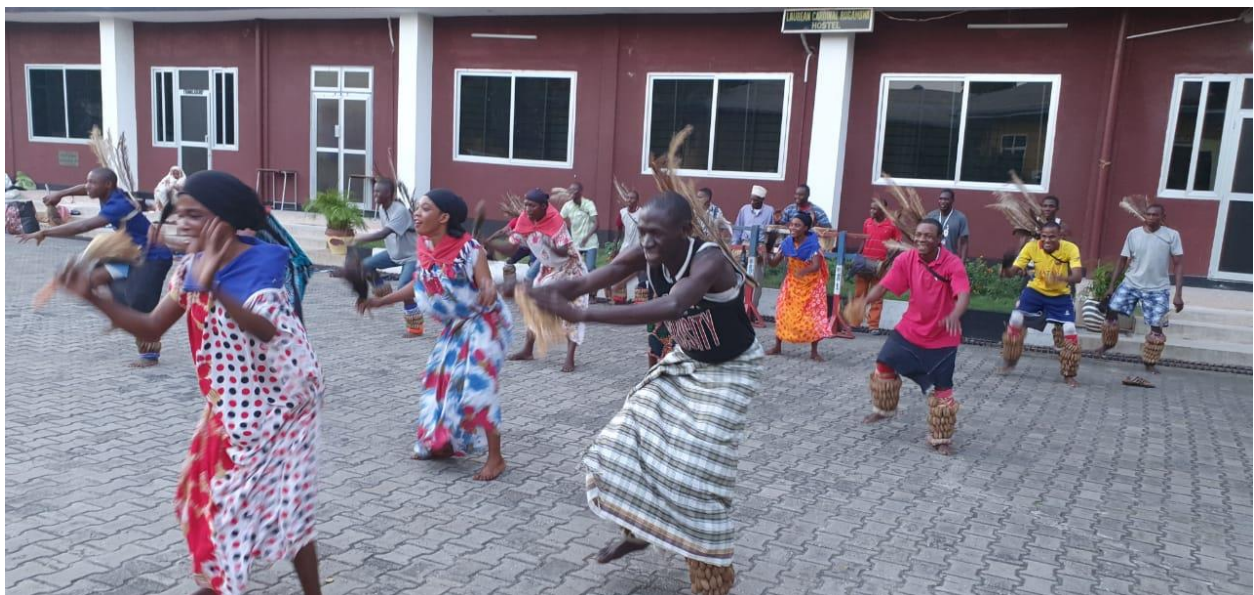
Fig 14: Gonda Asili dancers from Likoni Mombasa county

These are impromptu performances by a group, especially jazz musicians, that are often characterized by improvisation. The jam sessions were mostly held in the evenings before the close of business each day. These sessions also attracted Kenya's participation, especially the bands. The Tanzanians dominated this late night sessions since the other teams from other countries had to rush back to their hotels for supper and hence found it difficult to return back to the Stadium owing to transport logistics in the evening.