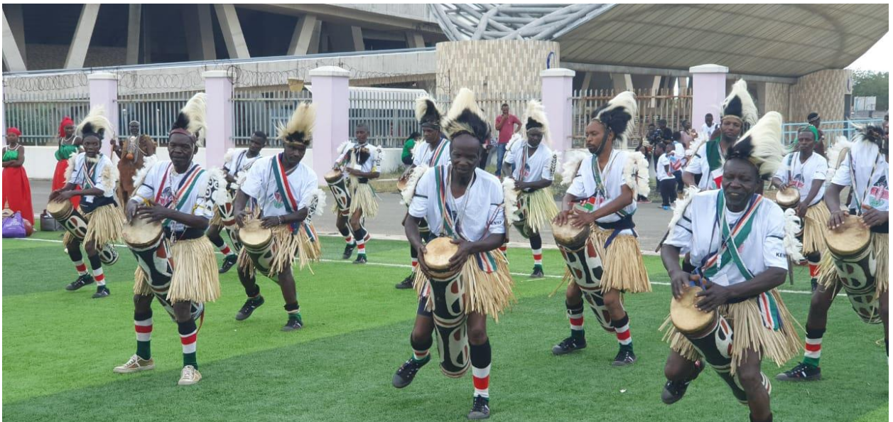
Fig 12: Chuka drummers from Tharaka Nithi performing a traditional dance