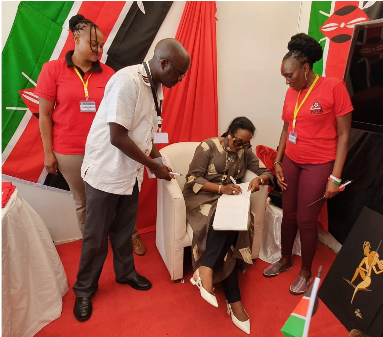
Fig. 9: The Cabinet Secretary signing the visitor's book at the Kenya pavilion