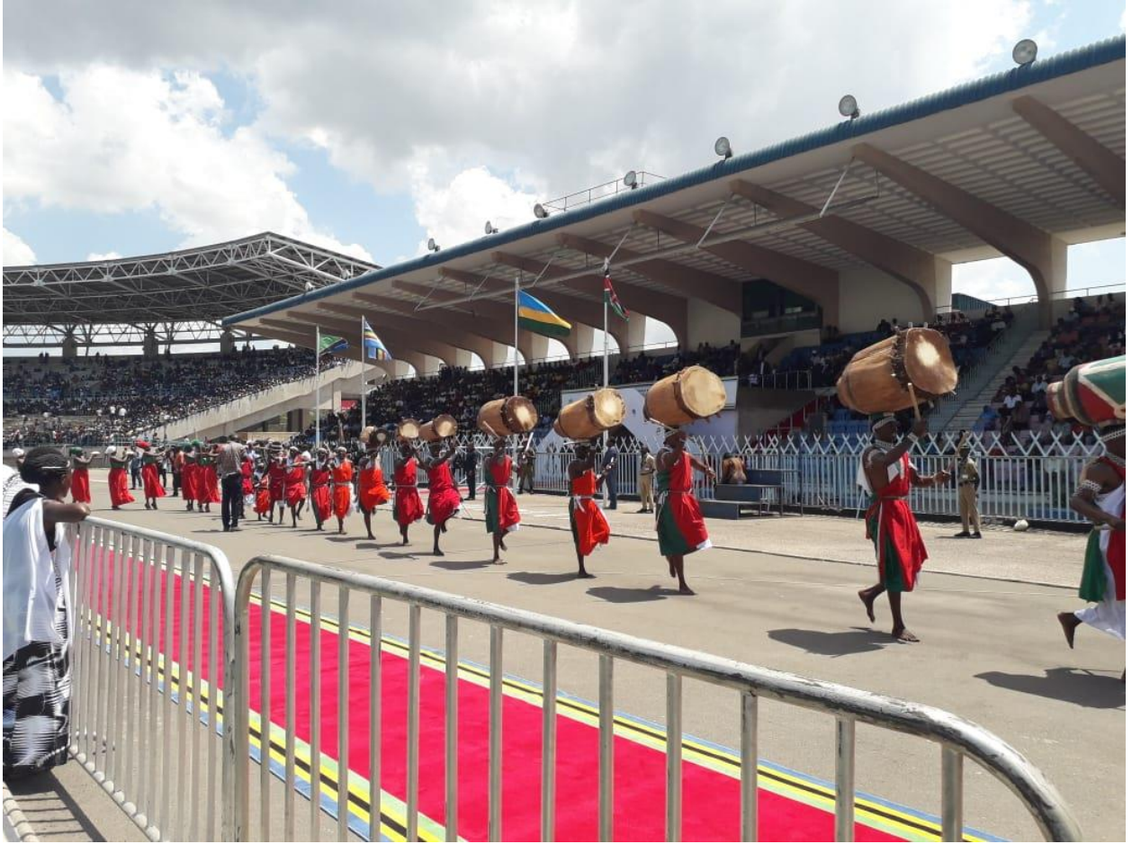
Fig. 29: Dancers from the Republic of Burundi