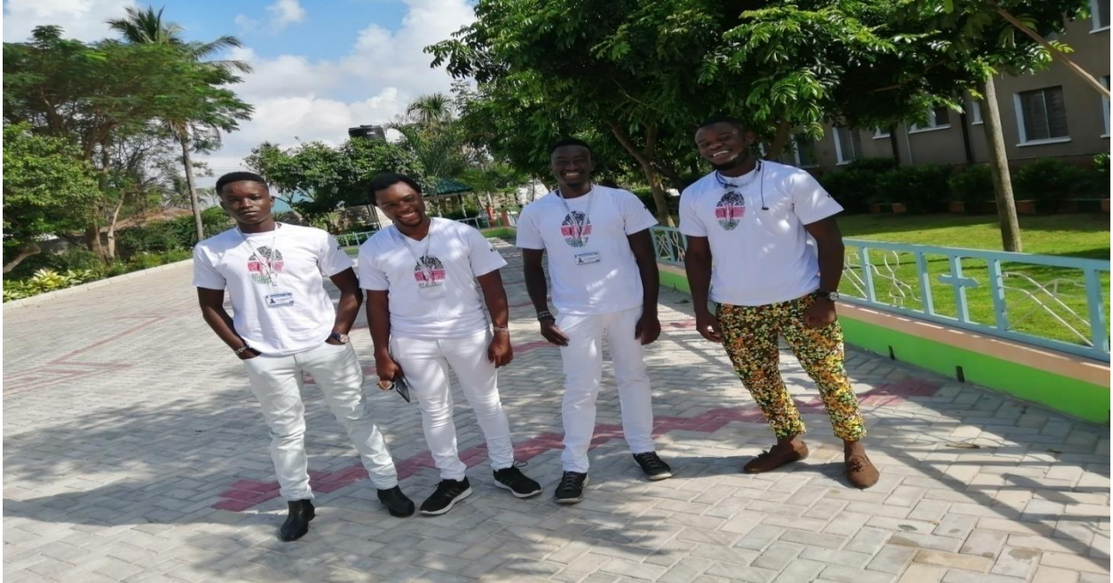
Fig 18: Kenyan male models pose for a photograph

It is imperative to note that Kenyan artists had a chance to get the necessary exposure and form networks across the East African Community. This was an avenue to exchange and share ideas for development.