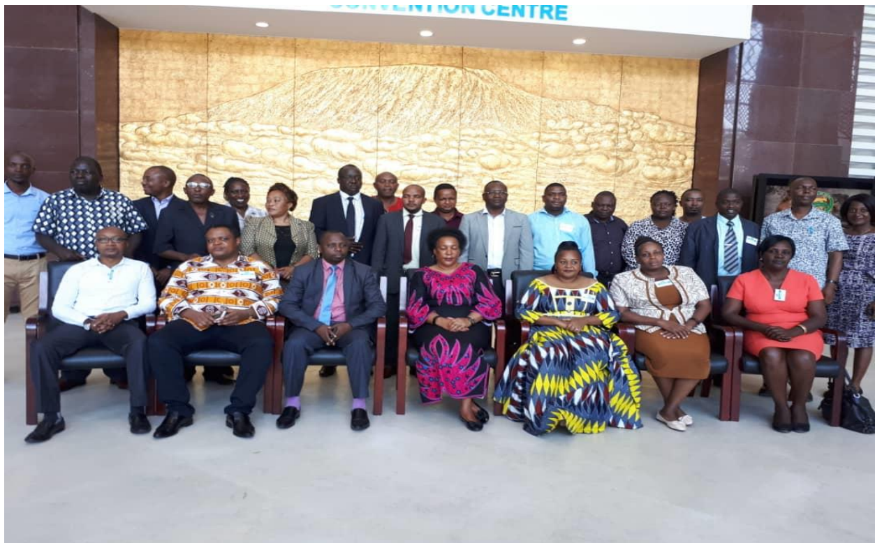
Fig 1: The Regional Steering Committee with The Permanent Secretary for Culture in Tanzania during the Official Opening of the RSC Meeting in Dar es Salaam

The general participation of artists and cultural practitioners from partner states were approximately 3117 while the festival visitors and audiences were 102,019.