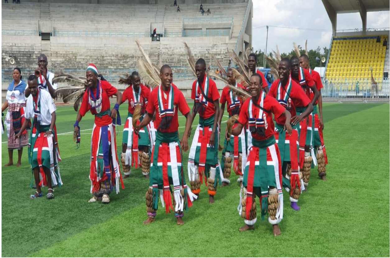
Fig. 3: Likoni Gonda dancers from Mombasa County at the Uwanja wa TAIFA in Dar es Salaam