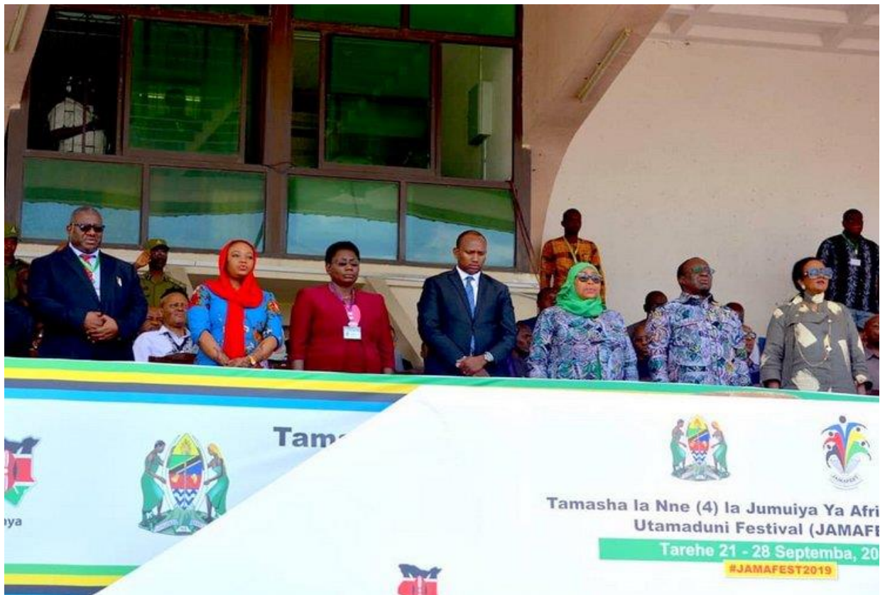
Fig 6: Dr. Amb. Amina Mohamed (right), Cabinet Secretary, Ministry of Sports, Culture and Heritage, Republic of Kenya, Madam Samia Suluhu the Vice President of Tanzania (3 rd right) during the opening ceremony.