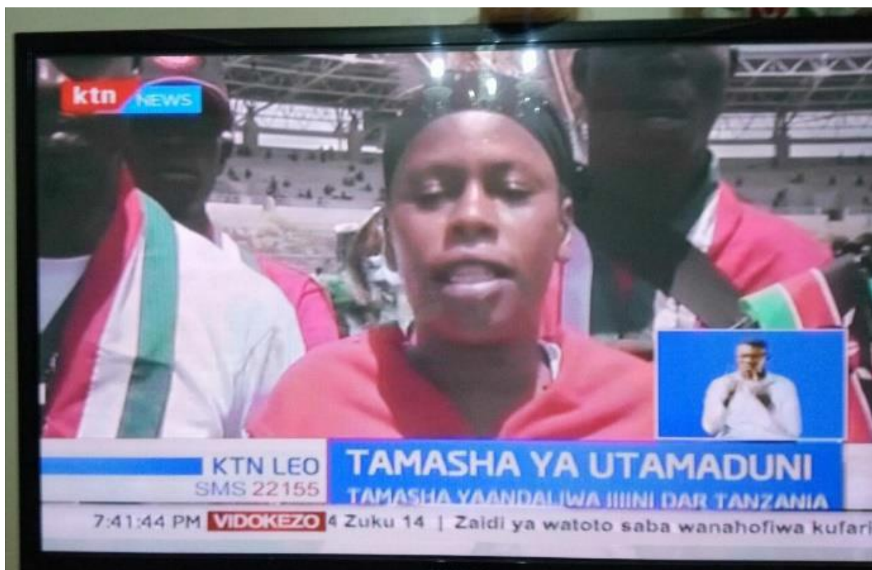
Fig. 27: JAMAFEST coverage on KTN Leo news

The JAMAFEST 2019 edition was given reasonable and constant media publicity that an event of such magnitude deserves, though, with a bias towards the Kenyan delegation. On the 18th September, 2019 at 5.30pm, Real Image Communication EA Ltd began by facilitating media coverage during the Gala Dinner that was held at Milele Hotel, in South C, Nairobi that was also addressed by the Cabinet Secretary Amb. Dr. Amina Mohamed.