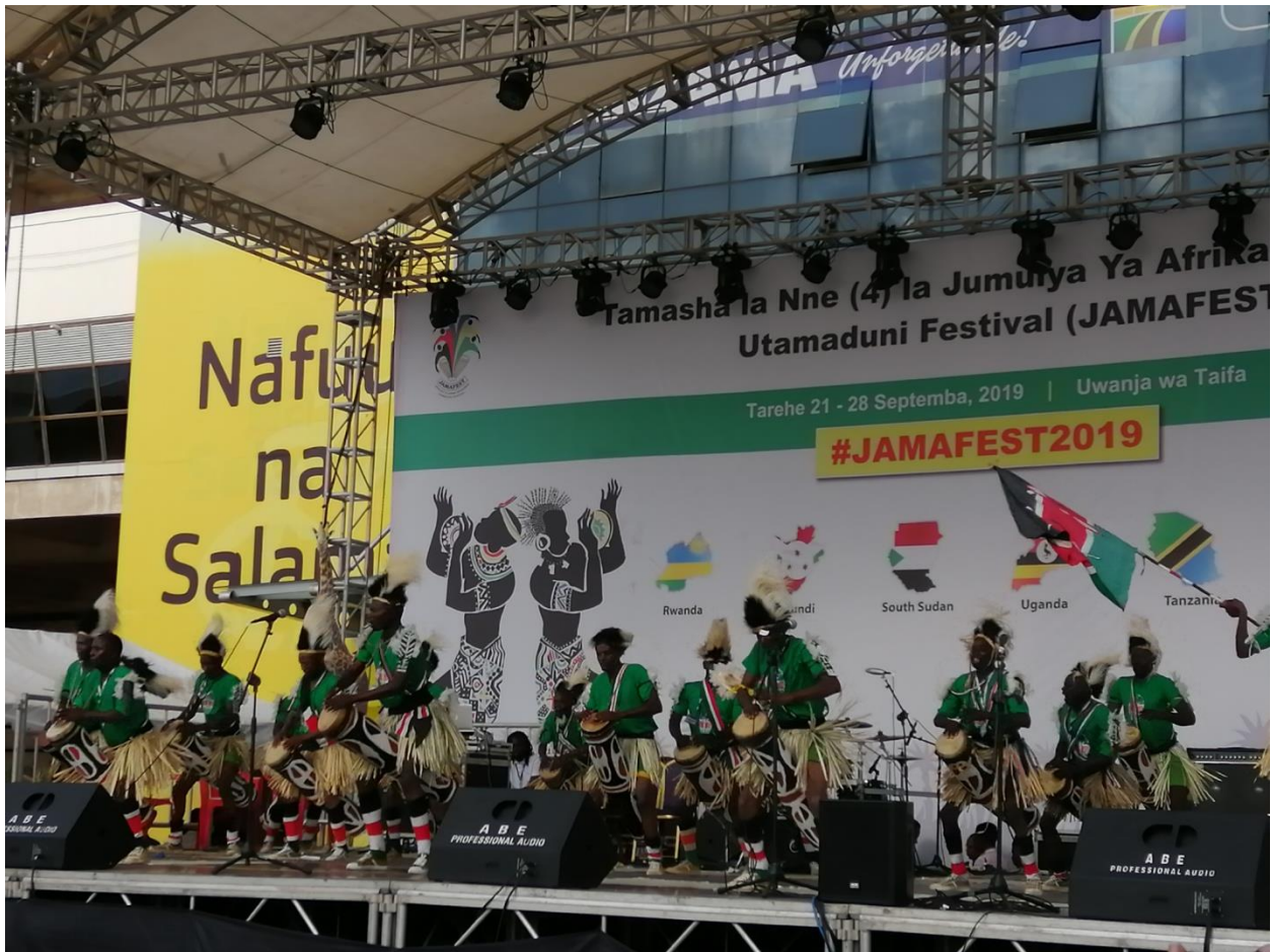
Fig 10: The Tazama drummers in action