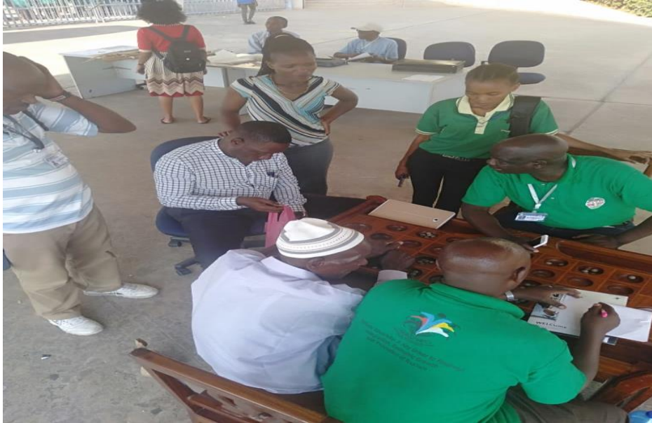
Fig 21: Kenya vs Tanzania ajua teams where Kenya emerged the winners.