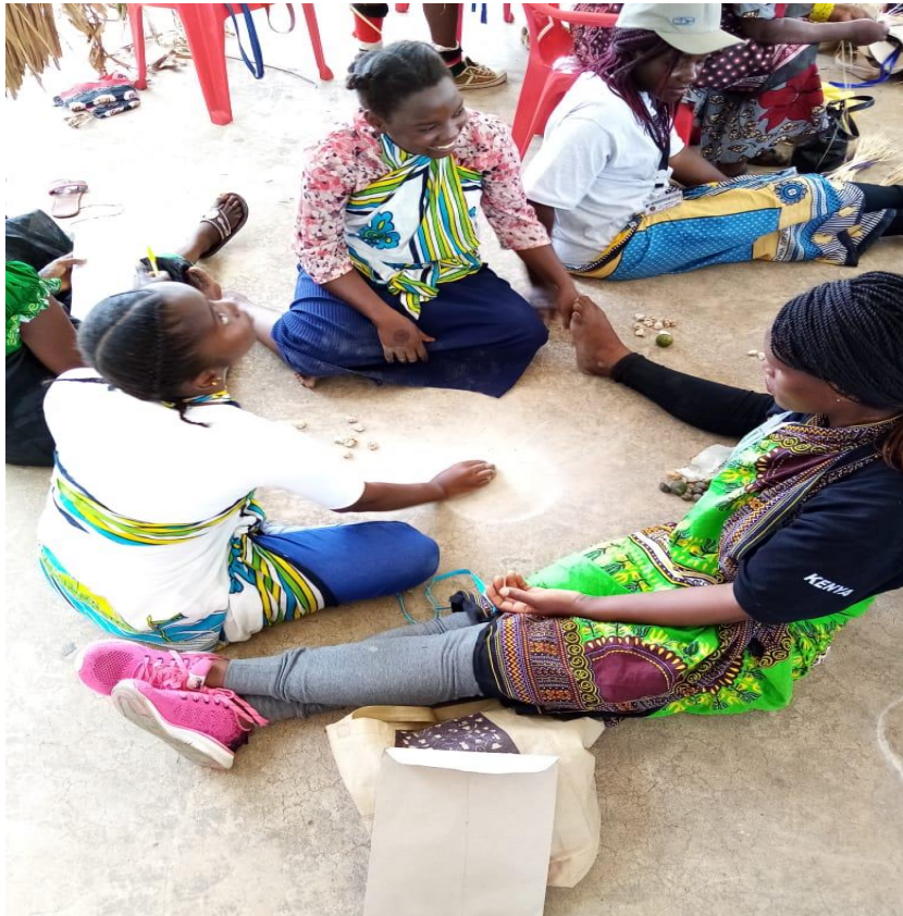
Fig 19: Kenya and Tanzania girls playing mudako

The game may have other names in other communities, but the Tanzanians referred to it as Mudako .