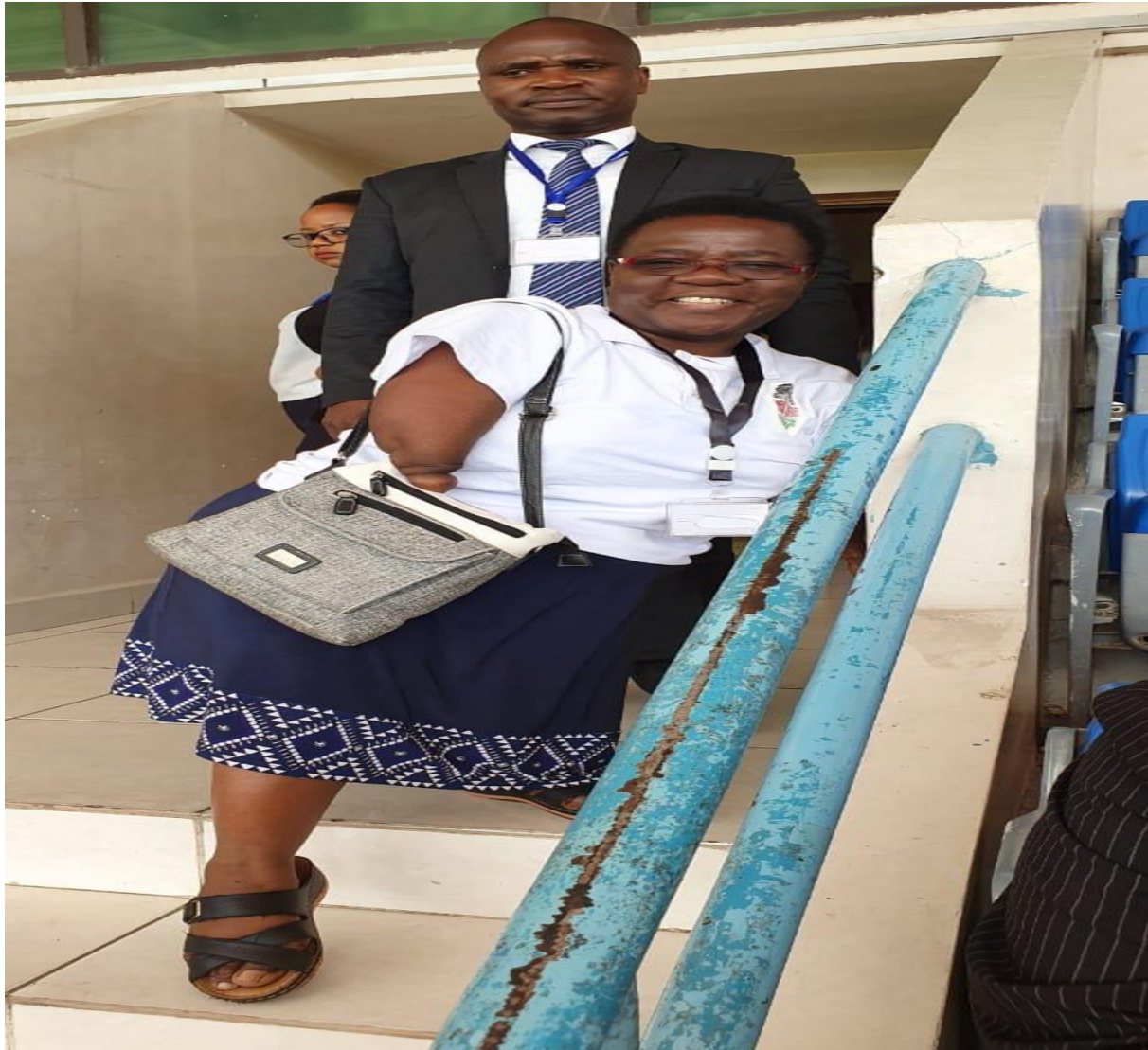
Fig 8: The Principal Secretary, State Department for Culture and Heritage arriving at the Stadium for the Opening Ceremony