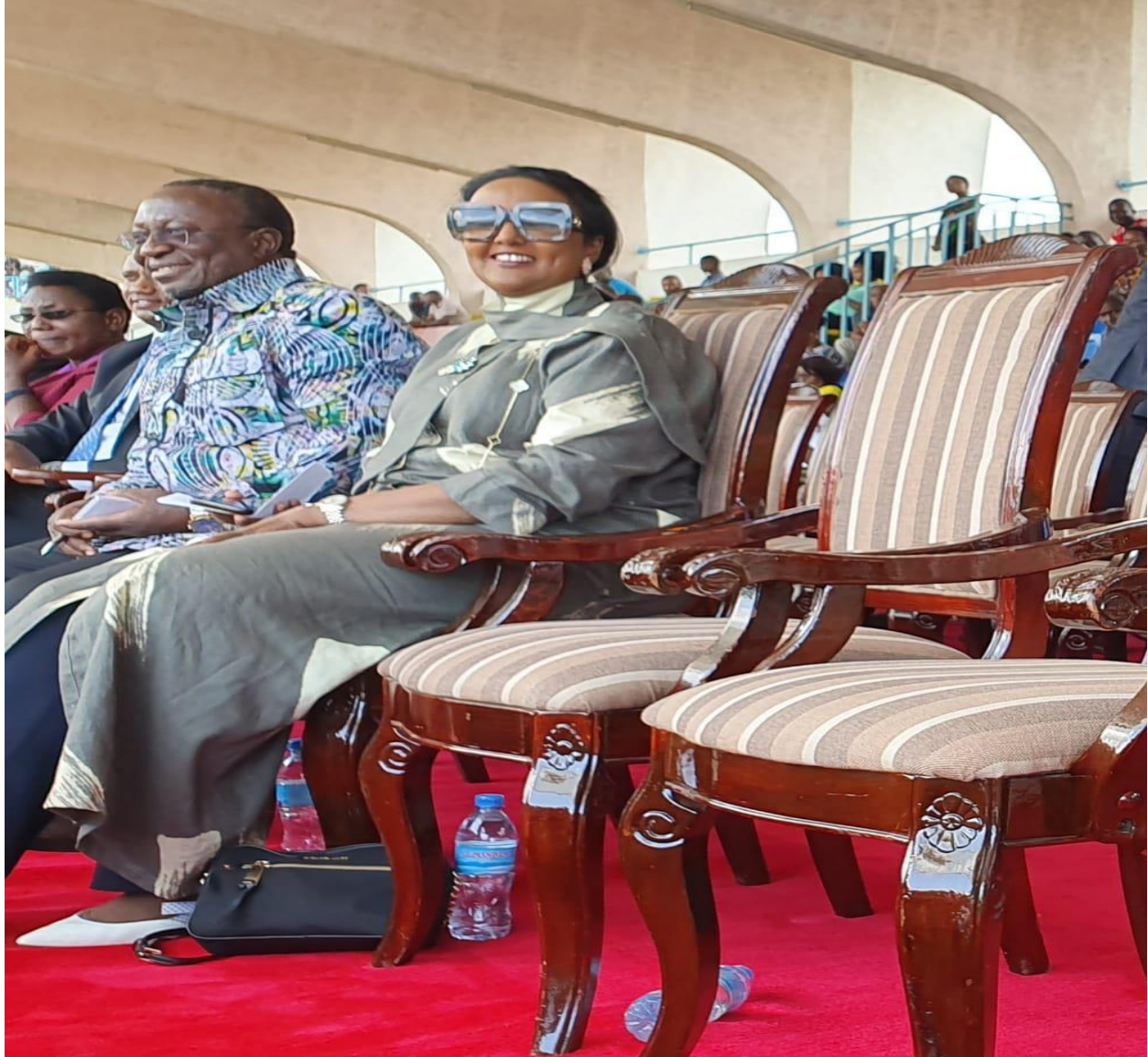
Fig 7: The Cabinet Secretary during the opening ceremony