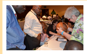
Training in Gaborone, Botswana (2012)

Looting and illicit trafficking of cultural objects deprive people of their cultural heritage and finance terrorism and criminal networks. UNESCO works to curb illicit trafficking by training law enforcement and customs officers, tracking down illegal trade patterns, and seizing looted objects for restitution.