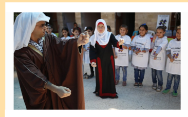
Storytelling workshop, Ramallah, Palestine (2015)

UNESCO engages with young people to promote understanding and respect for all of the world's cultures. Join us and contribute to the #Unite4Heritage campaign in celebration of the world's cultural diversity.