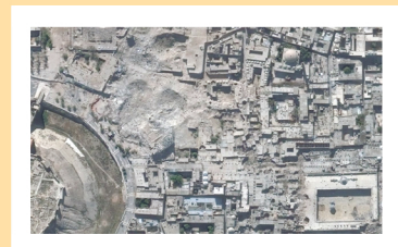
Old City of Aleppo, Syria (22 October 2014)

Due to the difficult security situation in most conflict and disaster-affected countries, UNESCO monitors damage to cultural heritage via satellite imagery, in cooperation with UNITAR/UNOSAT and other partners. This helps direct first-aid interventions where they are most needed and build strategies to fight illicit trafficking and plan for future recovery.