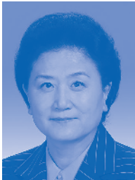
Madame LIU Yandong

Vice Premier of the People's Republic of China