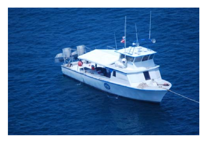
Figure 2.5.a. Top: The Blue Water Rose boat used by IMDI. The propeller deflectors used in the excavation of the site attributed to the San José wreck can be seen on the stern.

2.36 Added to this failure by IMDI, to comply with the obligations of considering as first option the protection in situ of the archaeological site and its objects, of not commercially exploiting them and of having personnel qualified to perform their respective roles – and perhaps as a consequence of such non-compliance - the methodologies used by IMDI at said site did not comply with the requirements of the Convention and the Rules set out in its Annex either.