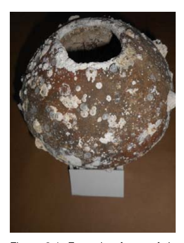
Figure 2.4. Example of one of the ceramic objects recovered by IMDI from the site attributed to the galleon San José , which has not received adequate conservation treatment. Note the abundant presence of buildups of biotic origin, known as biofouling, which are still on the surface of the materials © Photos UNESCO-STAB.

qualifications of the personnel (Section VII of the Rules of the Annex to the 2001 Convention). Rule 22 states that "[a]ctivities directed at underwater cultural heritage shall only be undertaken under the direction and control of, and in the regular presence of, a qualified underwater archaeologist with scientific competence appropriate to the project".