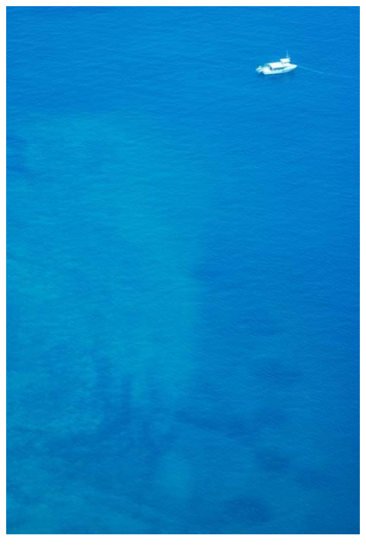
Figure 2.5.b. Right: Aerial view showing the circular depressions left in the seabed after the use by IMDI of the propeller deflectors, which produce powerful jets of water.