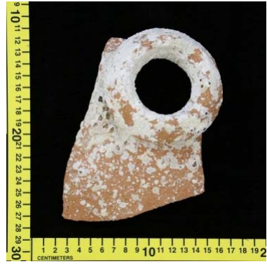
Figure 2.2. Top left: Contadora 1 site - Piece No. 001. Neck of a ceramic container made from reddish paste. Rest of images: Similar pieces removed by IMDI from the site attributed to the galleon San José. Clockwise: 00101, 00501 and 00328 (IMDI reports).