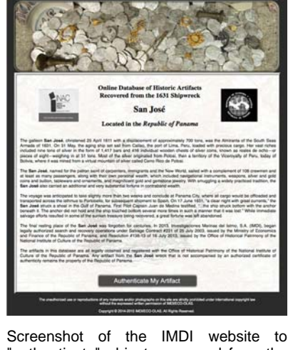
Screenshot of the IMDI website to "authenticate" objects removed from the archaeological site.

2.33 Another important aspect that was not complied with in the work carried out by IMDI concerns the competence and