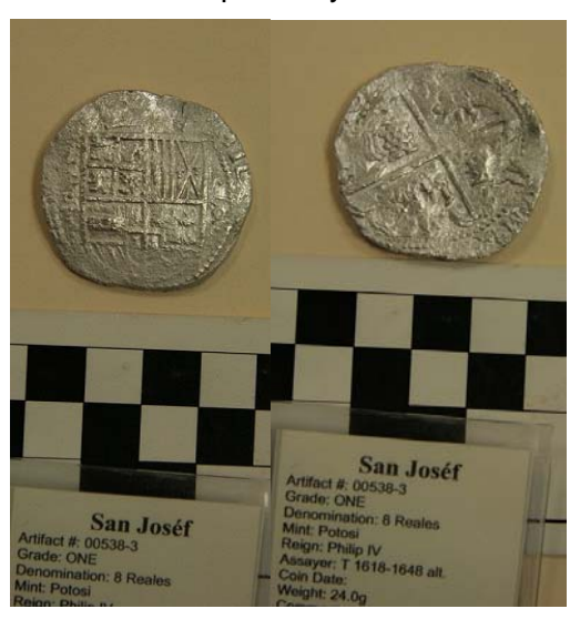
Figure 2.6. Front and back of a hammered silver Spanish coin (piece No. 538-3). To the naked eye, details such as the year of issue and the mintmark cannot be seen, however the general design corresponds to the period in which the galleon San José floundered.

2.41 Until well into the 18th century, threaded iron fittings were made by hand. These bolts might be occasionally found joining pieces of carpentry in the cabins or in lightweight bulkheads of ships, however, threaded bolts only began to be used in shipbuilding after the advent of the mechanical lathe towards the end of the 18th century, which made it possible to perform combined rotation and feed movements to work metals in this way<sup>43</sup>. In other words, this type of threaded bolt came after the European industrial revolution, and its use became more widespread from the nineteenth century.