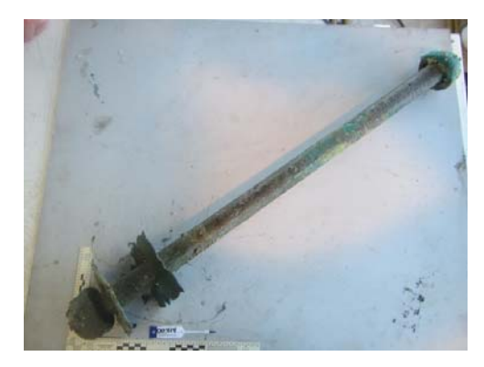
Figure 2.7.b. Piece 00414. IMDI, report of November 2014.

A direct inspection of these pieces would need to be undertaken, but if the threads are of the industrial type, they could not have come from the galleon San José (or any other vessel from that period).