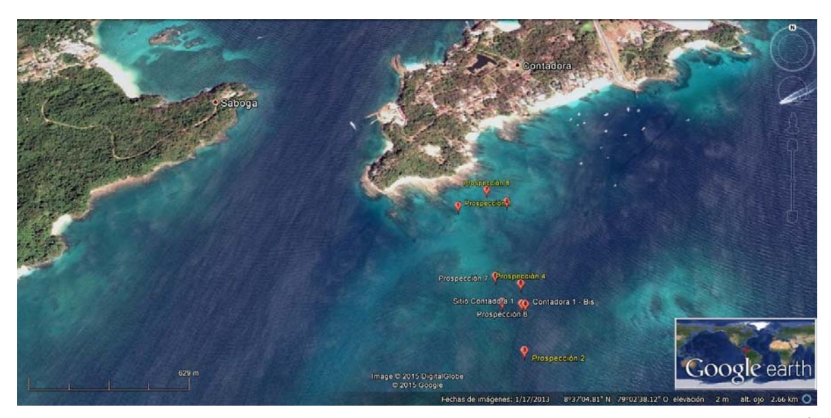
Figure 2.1. Areas surveyed around Isla Contadora during the Mission. The total area covered was approximately 35,700 m<sup>2</sup>. See the spatial distribution of the inspection in Appendix 10.