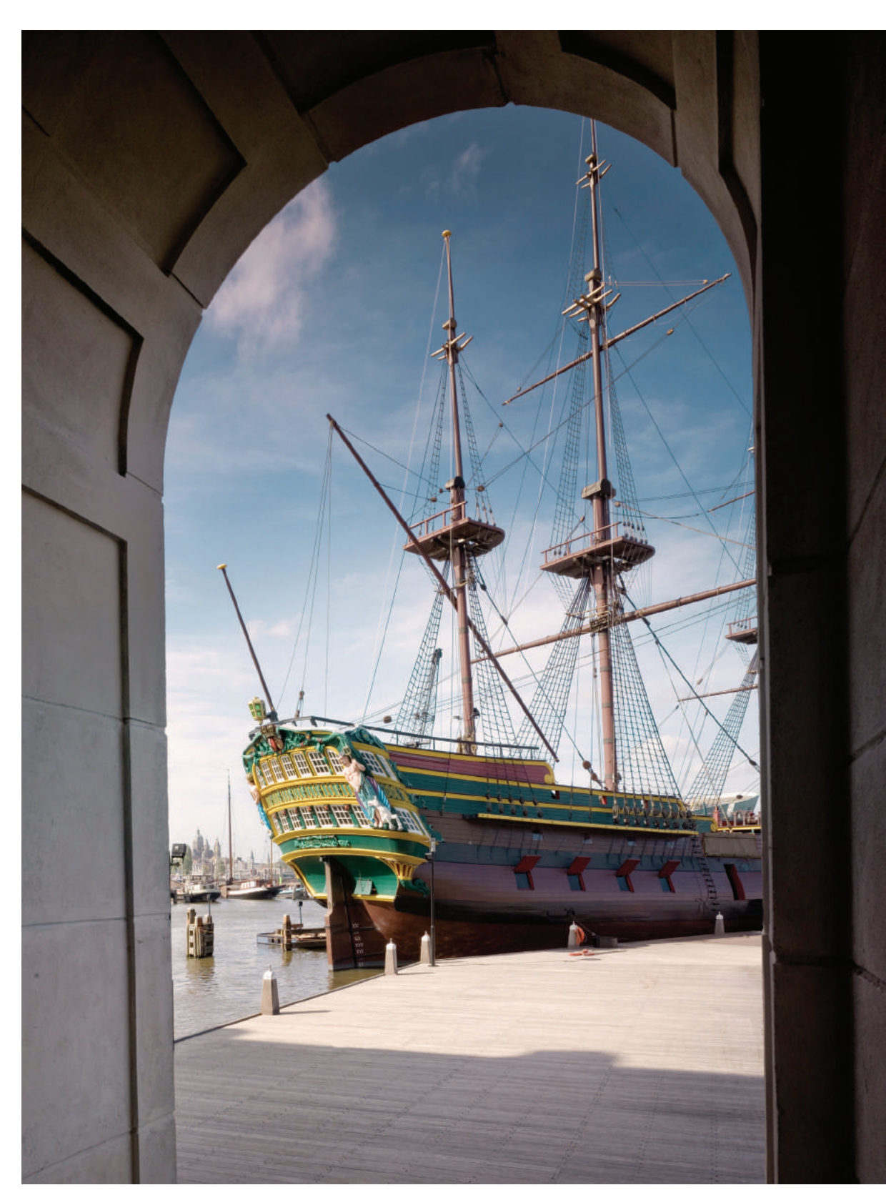
The replica of the VOC ship Amsterdam, September 2011.