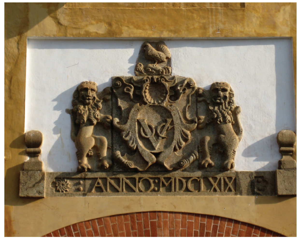
Dutch East India Company emblem on the wall of Galle Fort, Sri Lanka.