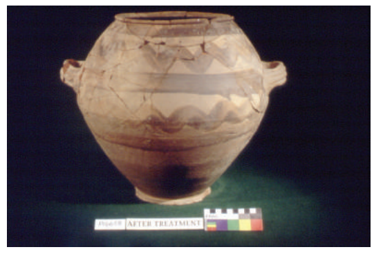
This Ovoid earthenware jar was broken and repaired in antiquity. It was later re-used as a burial urn and found containing the bones of a dog.

Context is the place where an object is found and the relationship or association of the object to everything around it (usually other artefacts). Its chronological position is inferred by its location within the stratigraphy. The careful documentation of context enables an artefact to be interpreted through various archaeological theories. Without context, an object loses much of its interpretive value and can be considered a loose find. A loose find is any artefact that cannot be accurately placed in context.