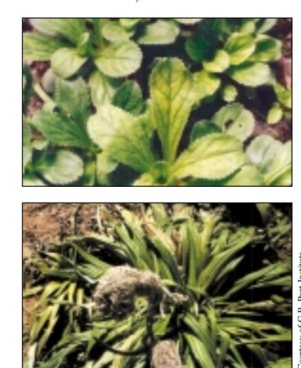
Picrorhiza kurooa and Arnebia banthemii under cultivation in the Suraithota and Tolma buffer zone villages respectively of Nanda Devi Biosphere Reserve

For further information, contact: s.mehn@memo.unesco.org or go to http://www.ukhap.nic.in/