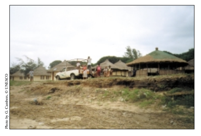
A series of beachfront bungalows in a tourist complex in Maputo (Mozambique) in 2001

The Seychelles is an archipelago of 72 low-lying coral islands and 43 mountainous granite islands. But 90% of its 80,410 population live on just one of these islands, Mahe. With that island's rocky interior being unsuitable for development, the limited coastal zone attracts most of the construction, whether for homes, hotels or new roads. And this often has negative effects on coastal ecology. 'Tourism,' says the Seychelles report, 'is a primary cause of coastal erosion, mainly arising from attempts to improve the beach and swimming areas cosmetically, as well as the provision of marine facilities such as marinas and piers.' And, while the government has passed a wide range of laws to protect the environment, says the report, 'enforcement is often a major problem.'