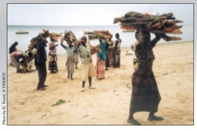
Women carry logs on a beach in Maputo (Mozambique) in 2001

Yet property development, landfill and pollution are not the only causes of coastal degradation. In many places, coral reefs and mangrove forest, which provide coasts with a natural protection, are being damaged or cleared. This exposes beaches to waves and wind. In the relatively wellpreserved Seychelles, the main threat to coral is bleaching as a result of increased sea temperature through global warming. Even a 1°C increase in temperature can kill the tiny, pigmented organisms that live in symbiosis with the coral-building polyps. And their death ultimately kills the coral host that depends on them for nutrients synthesized by sunlight. In the granite islands of the Seychelles, according to that country's report, a 1997–1998 survey showed that only 10% of live coral remained in some areas.