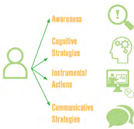
Figure 6: Skills and Characteristics for Digital Resilience

At the centre of the study is the concept of digital resilience, which encompasses a set of skills and attitudes that allow a young person to avoid and/or adapt to risky situations faced online. These range from being able to avoid risk through online awareness and prevention, the abilities to be unfazed by risk, and the competence in using strategies to respond to risk.