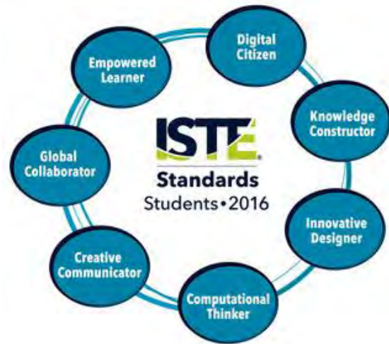
Figure 5: ISTE Stages of Learners

The ISTE Standards for Students defines stages of learner attributes that enable them to thrive in the future world of work. These include: Empowered Learner, Digital Citizen, Knowledge Constructor, Innovative Designer, Computational Thinker, Creative Communicator, and Global Collaborator. Each stage consists of a set of indicators, measures, and description. These Standards are encouraged to be used by educators for every age group in order to promote the development of these skills throughout the students' academic lifespan.