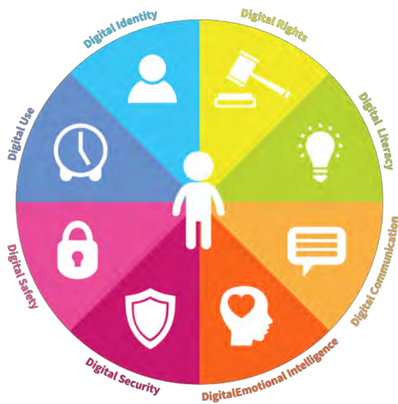
Figure 2: Topics in DQ Institute Curriculum

The curriculum from the DQ Institute cover eight aspects of digital citizenship education, that include: digital citizen identity, screen time management, digital footprint management, cyber bullying management, digital empathy, critical thinking, privacy management, and cyber security management.