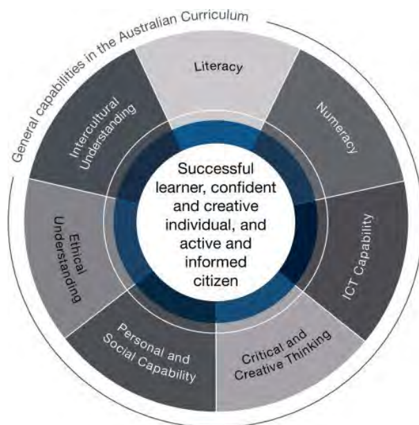
Figure 1: General Capabilities in the Australian Curriculum

General capabilities are defined as an interconnected set of knowledge, skills, behaviours and dispositions that enable students to become “successful learners, confident and creative individuals, and active and informed citizens.” “Information and Communication Technology Capability” is also listed among the seven general capabilities.