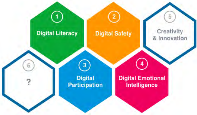
Figure 9: Refined Framework

Feedback from the experts, country representatives, and other participants were consolidated and guided the organizing team in refining the framework. The revised framework is composed of four succinct domains, with a couple of open domains for further consideration. Drawn on the earlier discussion, the four domains represented competencies that are required to achieve digital wellbeing – which was clarified as the target output instead of being one of the competency domains.