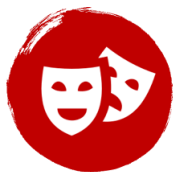
Cultural creativity transformation scheme