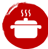
Program with Slow Food Association