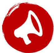
International Marketing action