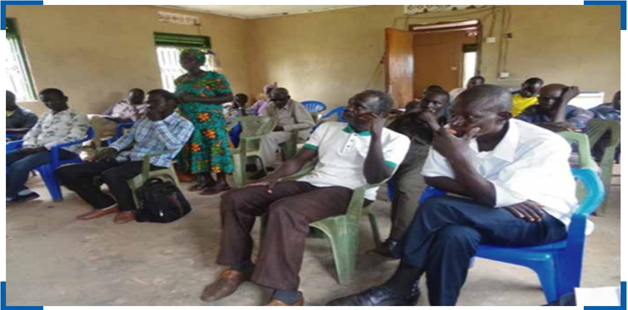
Orientation on CSE for PTAs in Mundri.

The Early and Unintended Pregnancy (EUP) campaign launched in October 2020 gained momentum with the leadership of the Ministry of General Education and Instruction (MOGEI), which continued to convene weekly meetings and awareness about the campaign. UNESCO handed over visibility materials to support state level launches. The campaign raised awareness about the causes, consequences and mitigating actions about early and unintended pregnancies.