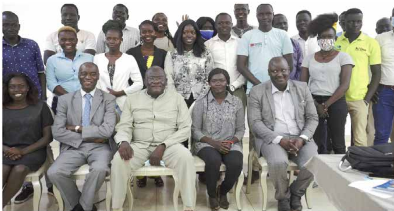
UNESCO representative, DG Media Authority and Journalists pose for a group photo during the Journalists training in Juba