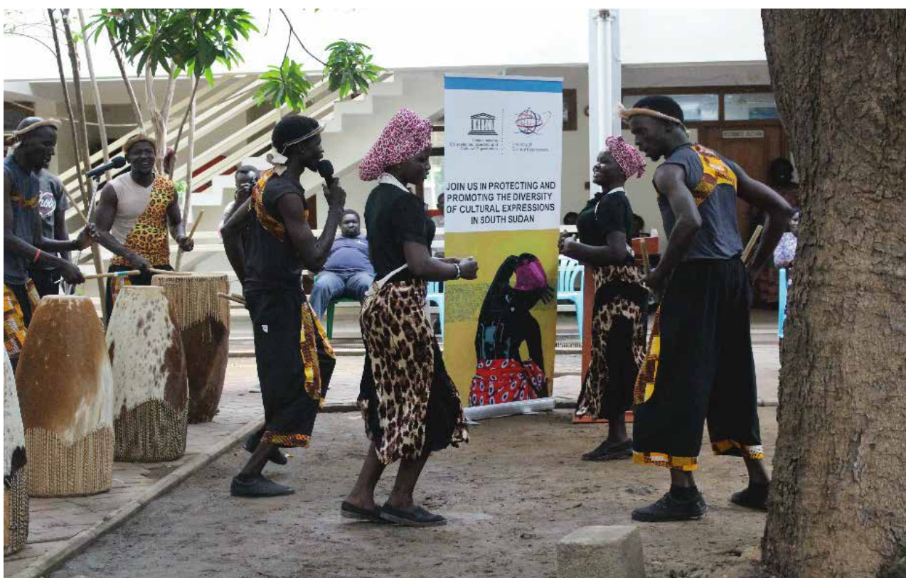
Cultural performance at the project launch in Juba

project is to identify feasible measures to be included in the draft copyright bill; facilitate the drafting and consolidation process; present the outputs from the working sessions to the government and receive final directives; organize capacity-development activities for cultural policymakers and other key stakeholders, and to provide coaching and mentoring through peer-to-peer learning with countries with expertise.