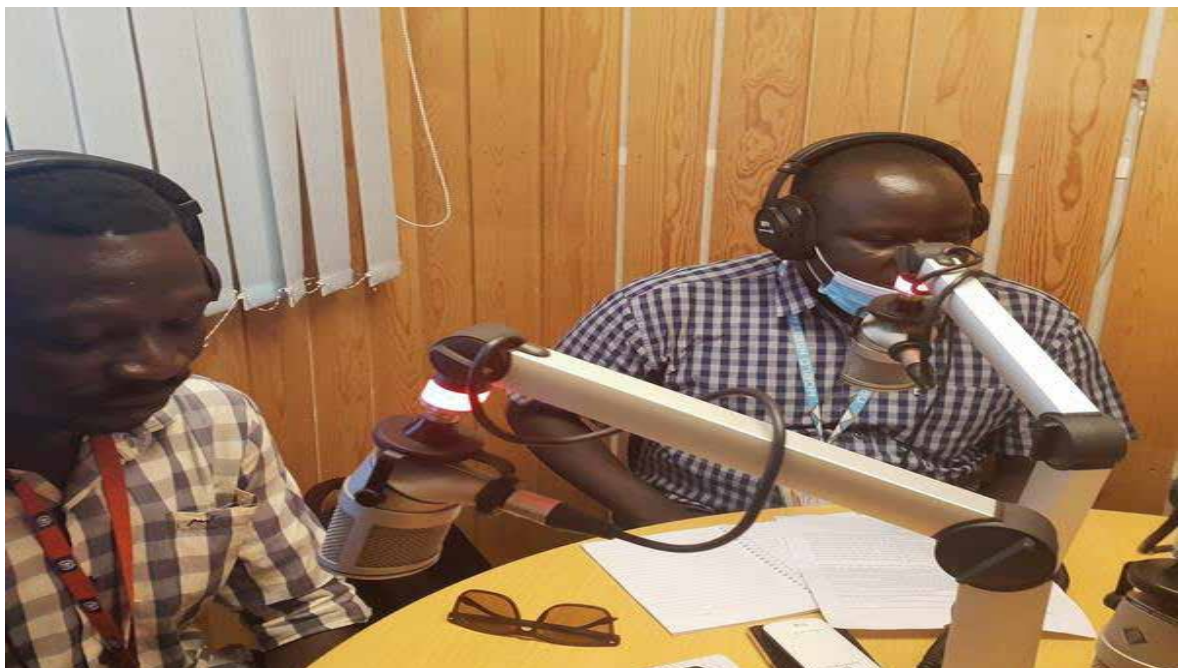
UNESCO Culture Officer and representative from the Ministry of Culture at Radio Miraya Studio during the World Day for Culture and Diversity

South Sudan marked the World Day for Cultural diversity for Dialogue and Development. The initiative on Radio Miraya was designed to raise awareness on the importance of cultural diversity and its benefits. Listeners were encouraged to celebrate the country's cultural diversity by undertaking different activities such as art exhibits, listening to a musical tradition from a different culture, inviting a friend over to cook traditional food, learn about traditional celebrations among other activities as one way of increasing awareness and respect for other cultures in the country.