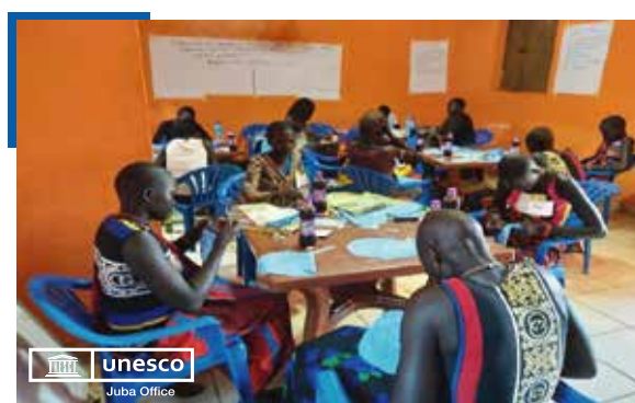
Adolescent girls from cattle camps in Yirol West County learn how to design and prepare sanitary materials from locally available materials @ UNESCO Juba

In addition, under this initiative, sixteen (16) adolescent girls from 9 cattle camps completed a three-day skills-based health education training that enabled them design, prepare and utilize sanitary materials from locally available materials thus addressing challenges of menstrual hygiene management for adolescent girls and women in the community.