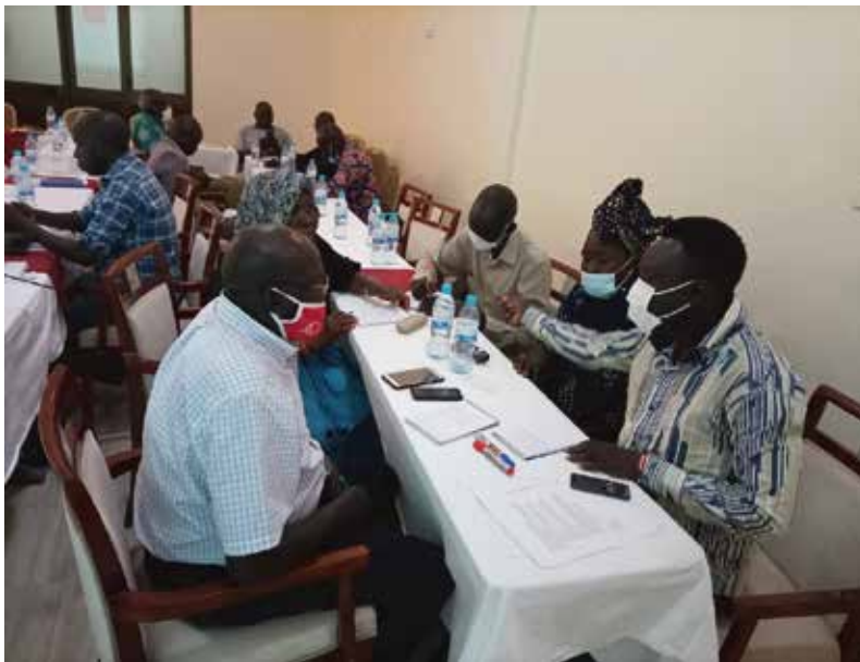
Participants actively involved in the plenary discussions on Basic school safety standards and protocols during the training

UNESCO supported the Ministry of General Education and Instruction officials and partners to build their capacity in establishing sustainable mechanisms and structures for reporting on attacks on education facilities/institutions across South Sudan. The initiative has contributed to increased knowledge and skills of education managers and other partners on data collection, analysis and reporting on school occupancy and attacks on education facilities, students, and personnel. It also raised awareness on the need to set up, maintain and sustain basic school safety standards and protocols, and develop and use reporting protocols and a standard framework on attacks on education facilities, learners, and personnel.