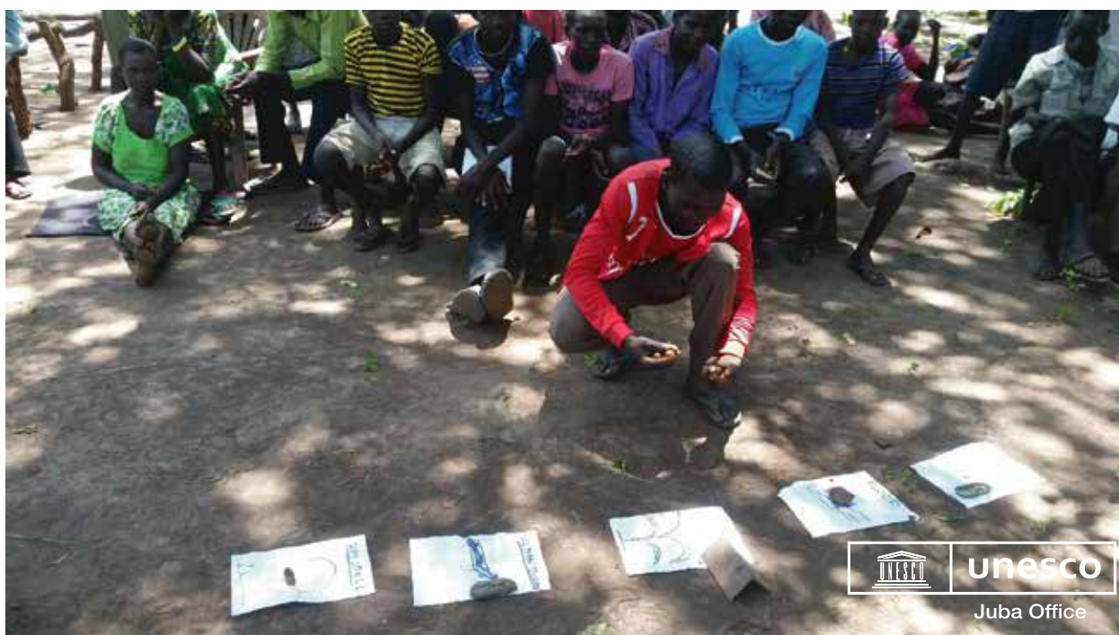
A Youth from Wulu cattle camp participating in Community action planning process in Wulu

UNESCO in collaboration with FAO and in partnership with three-line ministries (General Education and Instructions, Agriculture and Food Security and Livestock and Fisheries) with funding from the European Union, continued implementation of the joint project on livelihoods and education.