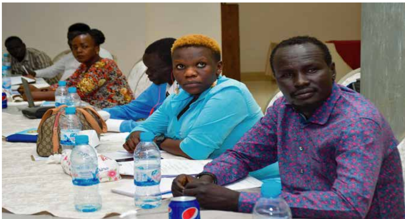
Journalists attending a 2-day workshop on Media laws in Juba

journalists. The workshop drew participants from radio stations, newspapers, online web-based media, and freelance reporters from both local and international media from private, community and public owned entities.