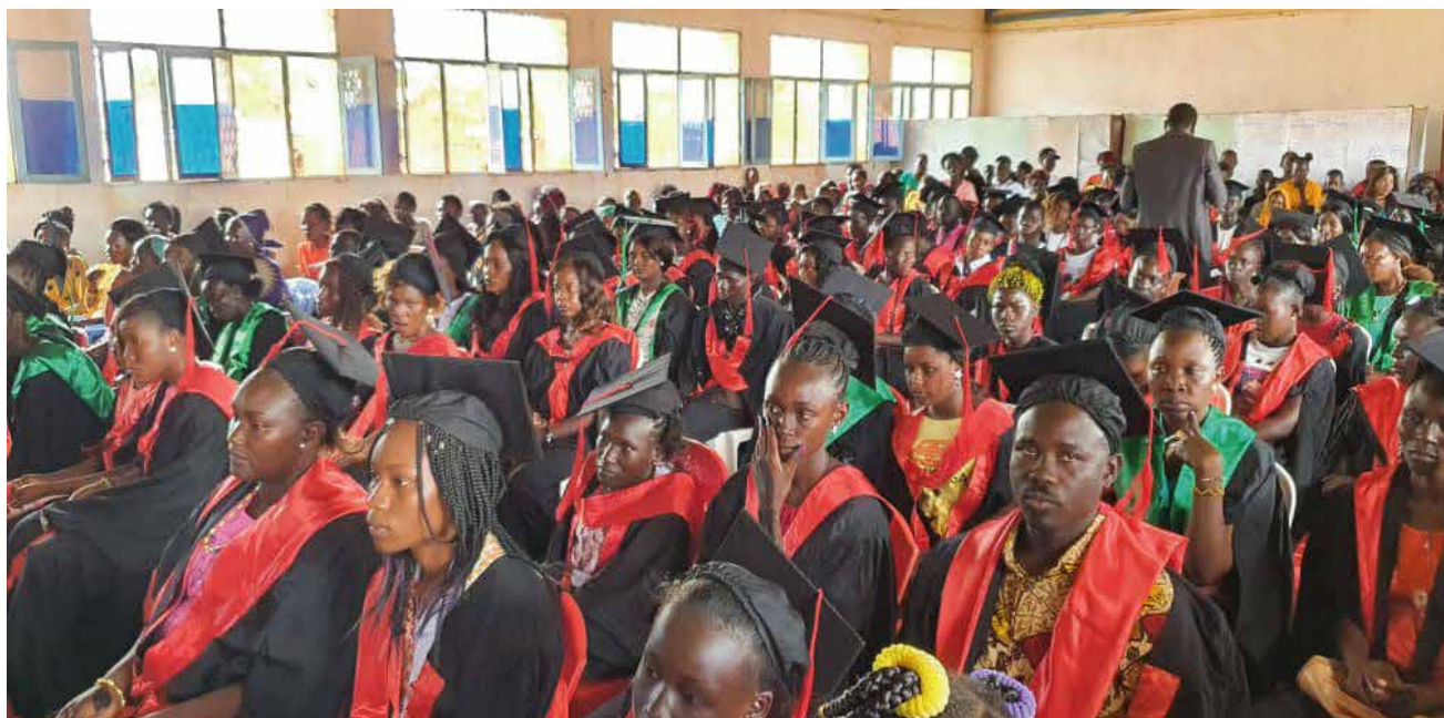
Youth graduate in vocational, entrepreneurial, and other soft skills training