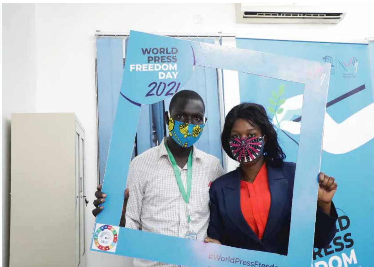
Journalists at the 2021 World Press Freedom Day celebration in Juba© UNESCO.

UNESCO and partners in recent years have embarked on approaches aimed at boosting understanding and educating duty bearers, rights holders, and the public on issues of freedom of expression, access to information, press freedom and safety of journalists. Several formats have been used to ensure that messages reach the right people. These have included use of media platforms like the radio and newspapers, bringing together stakeholders through workshops and conducting roundtable discussions.