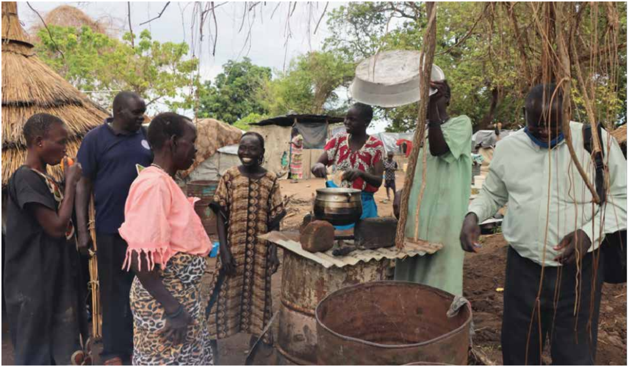
Women showing how they cook using metallic barrel and washing basin during the flood