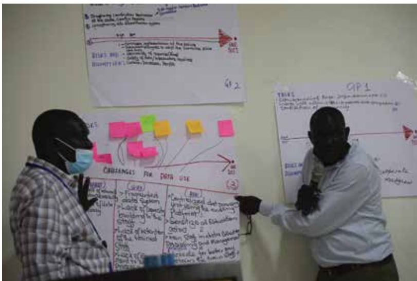
Facilitators during the technical workshop on information systems for increased resilience to crises at Palm Africa Hotel, Juba.

The project completed an eco-system data mapping, education risks analysis and updating of a case study on EMIS in the context of education in emergencies, this was followed up by joint identification of specific areas of intervention and the development of an implementation road map with participation of MoGEI, Education Cluster, Education partners (NNGOs, NGOs and UN-agencies).