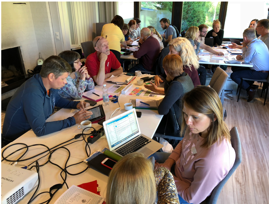
NordMAB in Finland 2018.