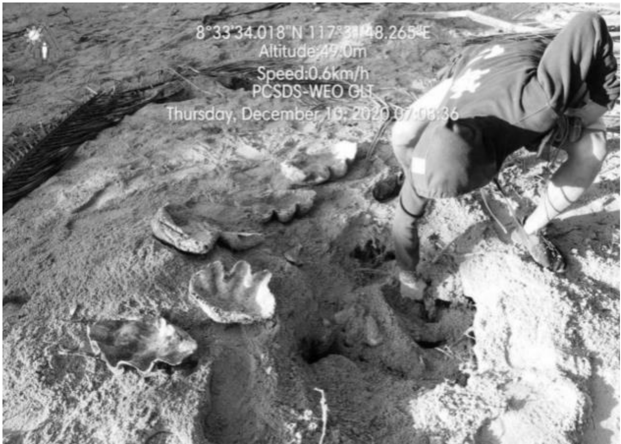
Figure 2. Buried Giant Clams, locally known as “Taklobo,” were confiscated during one of the apprehension procedures of the PCSD Enforcement Team on 10 December 2020 in Sitio Marangbuwaya, Igang-Igang, Bataraza, Palawan.

turned-over wildlife: 61 of which are mammals, 38 are reptiles, and 26 birds. These wildlife species are worth Php 65,870,090.