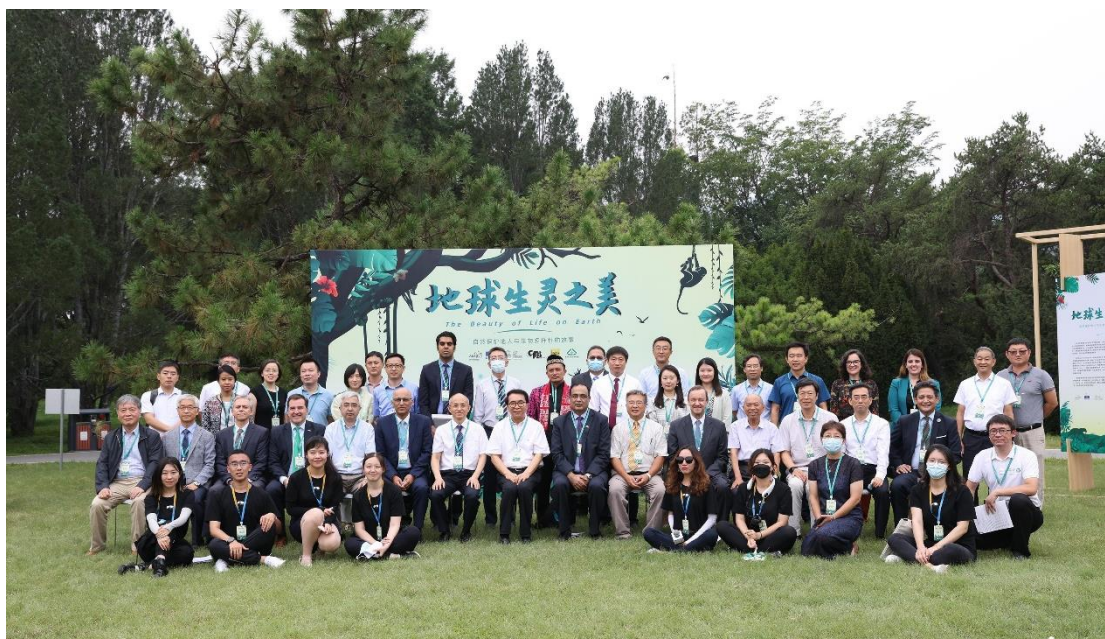
Opening Ceremony of The Beauty of Life on Earth Exhibition in Beijing, China, 2021