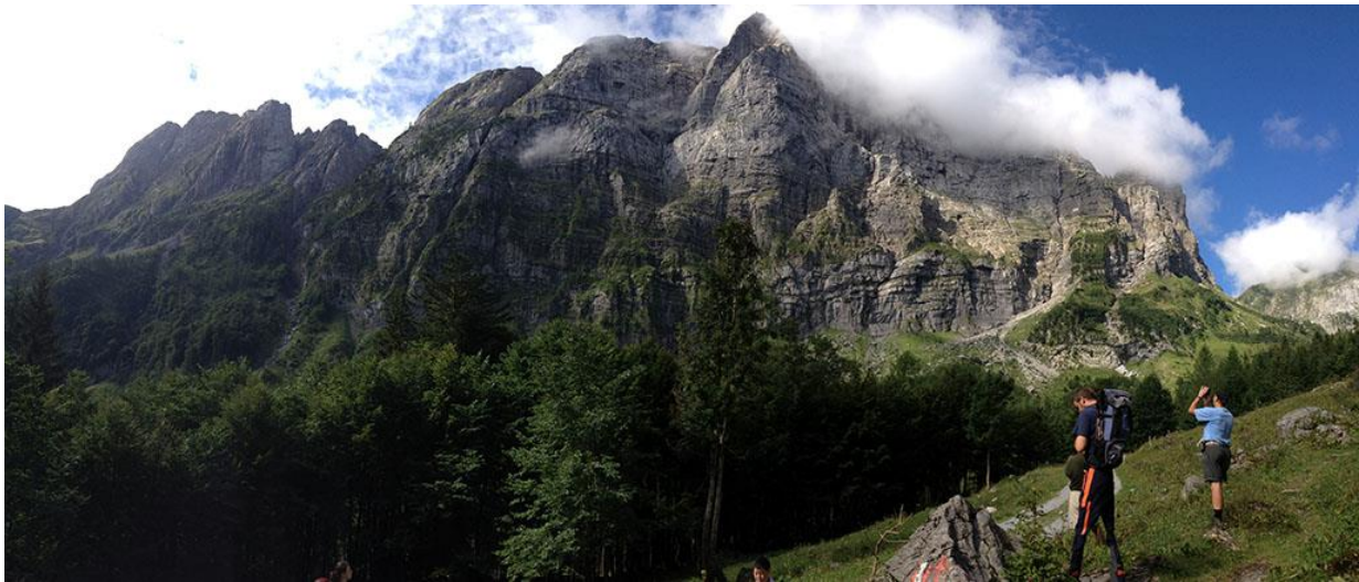
Panorama of the Kellerwand along a hiking trail in the Carnic Alps Geopark (Austria).