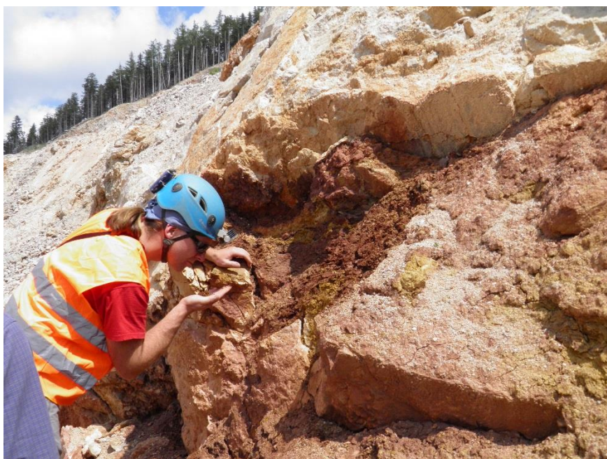
Cretaceous lateritic paleosols and cave sediments at a quarry in Eastern Austria denoting large paleokarst systems during the Late Cretaceous.

IGCP-609, a 5 year UNESCO-IUGS project, investigates sea-level changes during extreme greenhouse climates. The recent rise in sea-level in response to increasing levels of atmospheric greenhouse gases and the associated global warming is a primary concern for society. Evidence from Earth's history indicate that ancient sea-level changes occurred at rates an order of magnitude higher than that observed at present. To predict future sea-levels we need a better understanding of the record of past sea-level change. In contrast to glacial eustasy controlled mainly by waxing and waning of continental ice sheets, shorttime sea-level changes during major greenhouse episodes of the earth history are known but still poorly understood. The global versus regional correlation and extend, their causes, and consequences of these sea-level changes are strongly debated.