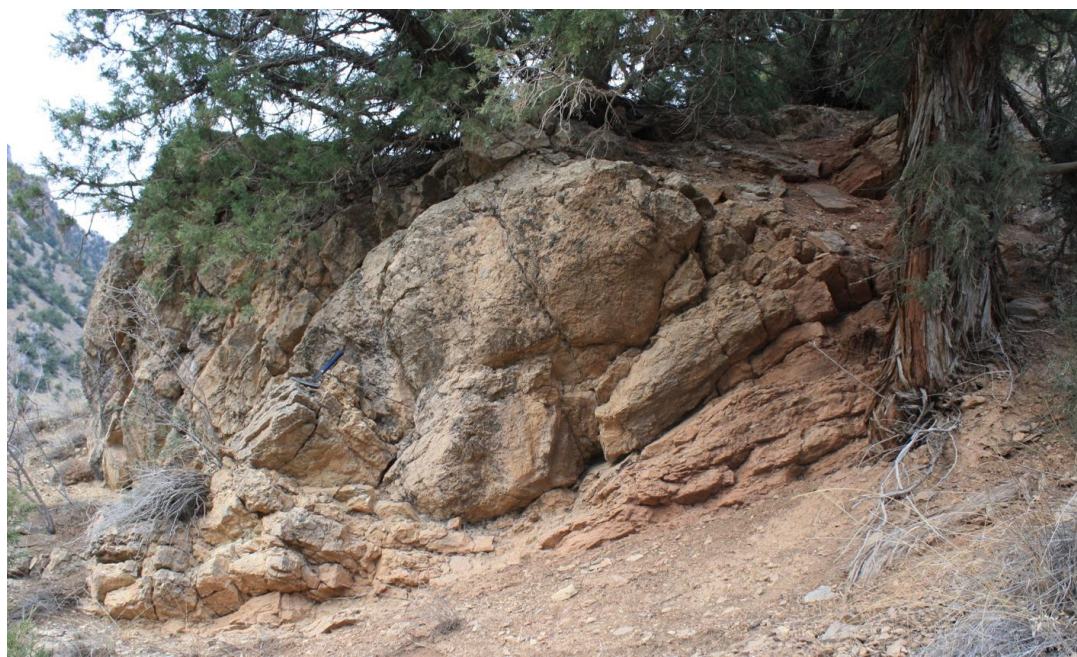
Giant Microbialite (see hammer for scale) at Vedi section, Armenia.

by important variations in carbon, calcium and boron isotopes records. These microbial deposits consequently developed under complex and changing environmental conditions.