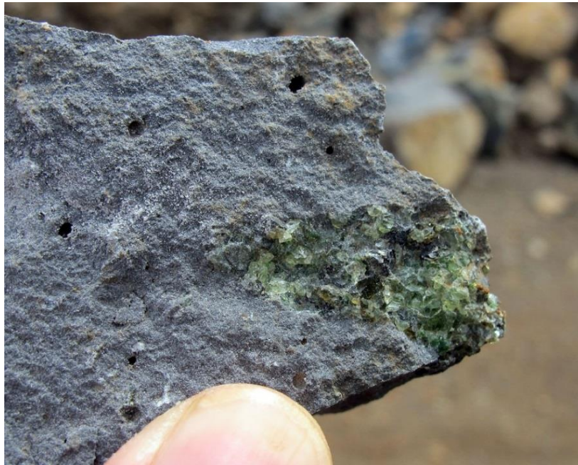
Small primitive lherzolitic mantle xenolith consisting of spinel, clinopyroxene, orthopyroxene and olivine enclosed in Pliocene alkalibasalt from Pleiku, central Vietnam.

A combination of petrological, geochemical, spectroscopic and microstructural methods will be used to obtain new information on the subcontinental lithospheric mantle. Our approach is to combine the information from “hydrous” nominally water free minerals with their trace element content, their PT evolution as well as deformation of natural samples in order to evaluate the significance of these processes in element mobility and transport in the upper mantle. Mantle xenoliths from different depths from the earth's mantle will be sampled and investigated: 1) xenoliths from kimberlites (South Africa: Kimberley area; Botswana: Letlhakane, Damtshaa, Jwaneng; Tanzania: Mwadui,) and 2) from alkaline basalts (Styrian Volcanic Arc, Austria, Slovenia). The different mantle xenolith origins were chosen because the first group represents mantle material beneath Archean cratons while the latter group includes samples from the mantle below the young Alpine orogen.