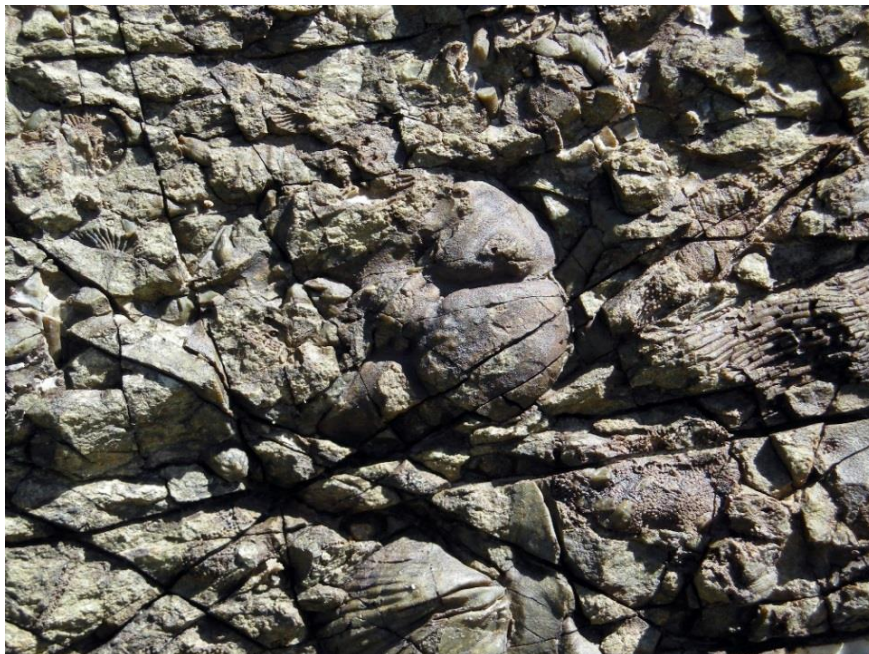
Late Devonian phacopid trilobites from the Samnuuruul Formation (Western Mongolia).

One of the most important climate sensitive fossil groups are corals. Datasets obtained from the Paleobiology Database show that rugose corals for example, experienced a drop in diversity since the late Middle Devonian, from previously more than 760 species during the Eifelian and Givetian climax, which resulted in about 380 species during the Frasnian, and less than 90 species during the Famennian. The initial recovery fauna after the Kellwasser crisis at the Frasnian/Famennian boundary was a cosmopolitan, low diversity rugose coral fauna, which is called the Cyathaxonia fauna. It is represented by small, simple-structured solitary corals that are interpreted as ahermatypic of the cold and aphotic zone. Rebound of colonial rugose corals took even until the late Famennian.