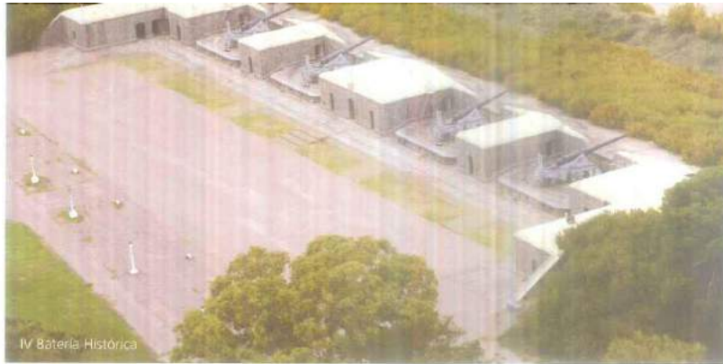
IV Bateria Histórica