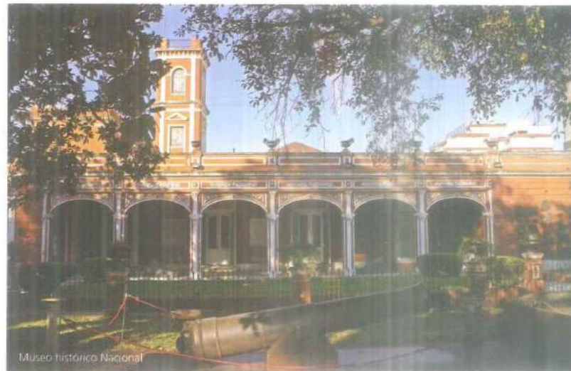
Museo histórico Nacional