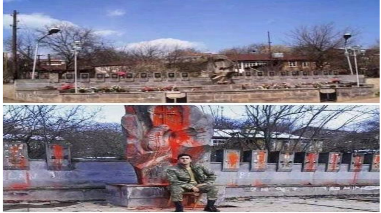
The memorial dedicated to the victims of the First Artsakh war was vandalized