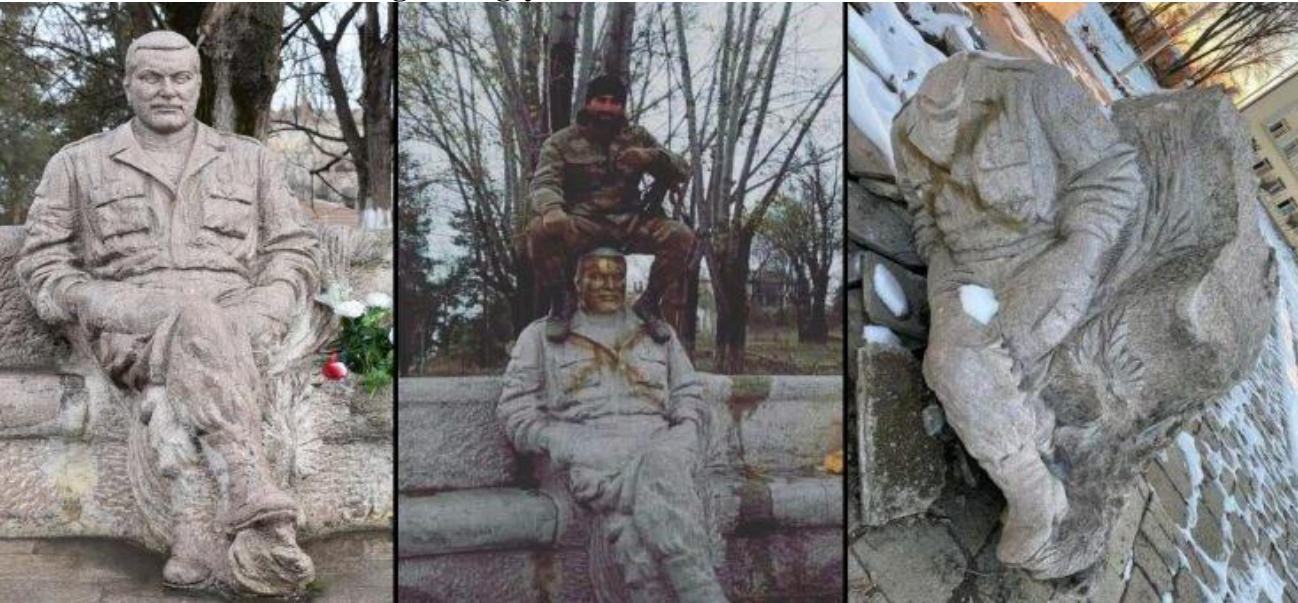
The Statue of the former Prime Minister of Armenia and national hero was destroyed in Shushi