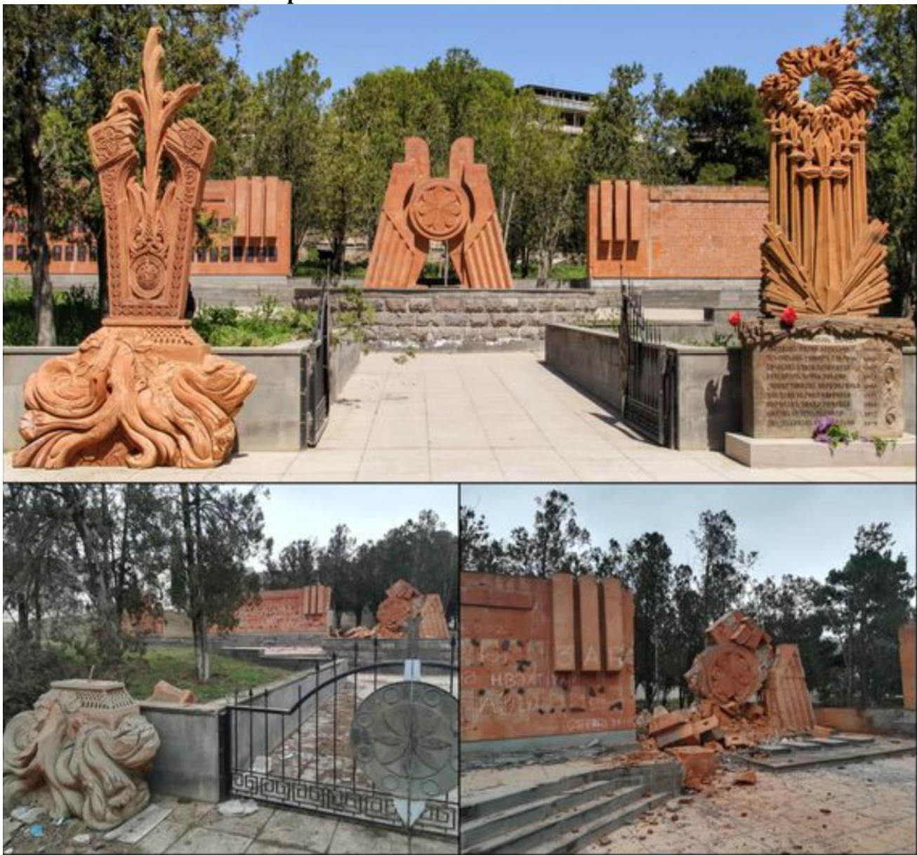
The memorial in 2017 before being demolished and vandalized by Azerbaijanis in 2020