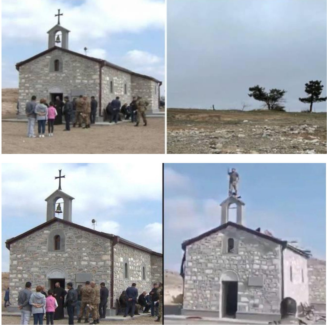
Annex 9: Holy Mother of God Church / Zoravor Surb Astvatsatsin Church

Zoravor Surb Astvatsatsin Church in 2017. After the 44-day war, the Church was vandalized and insulted by Azerbaijani soldier before being demolished