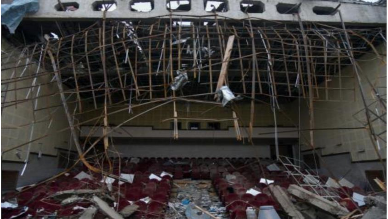
The cultural center after the shellings in October 2020