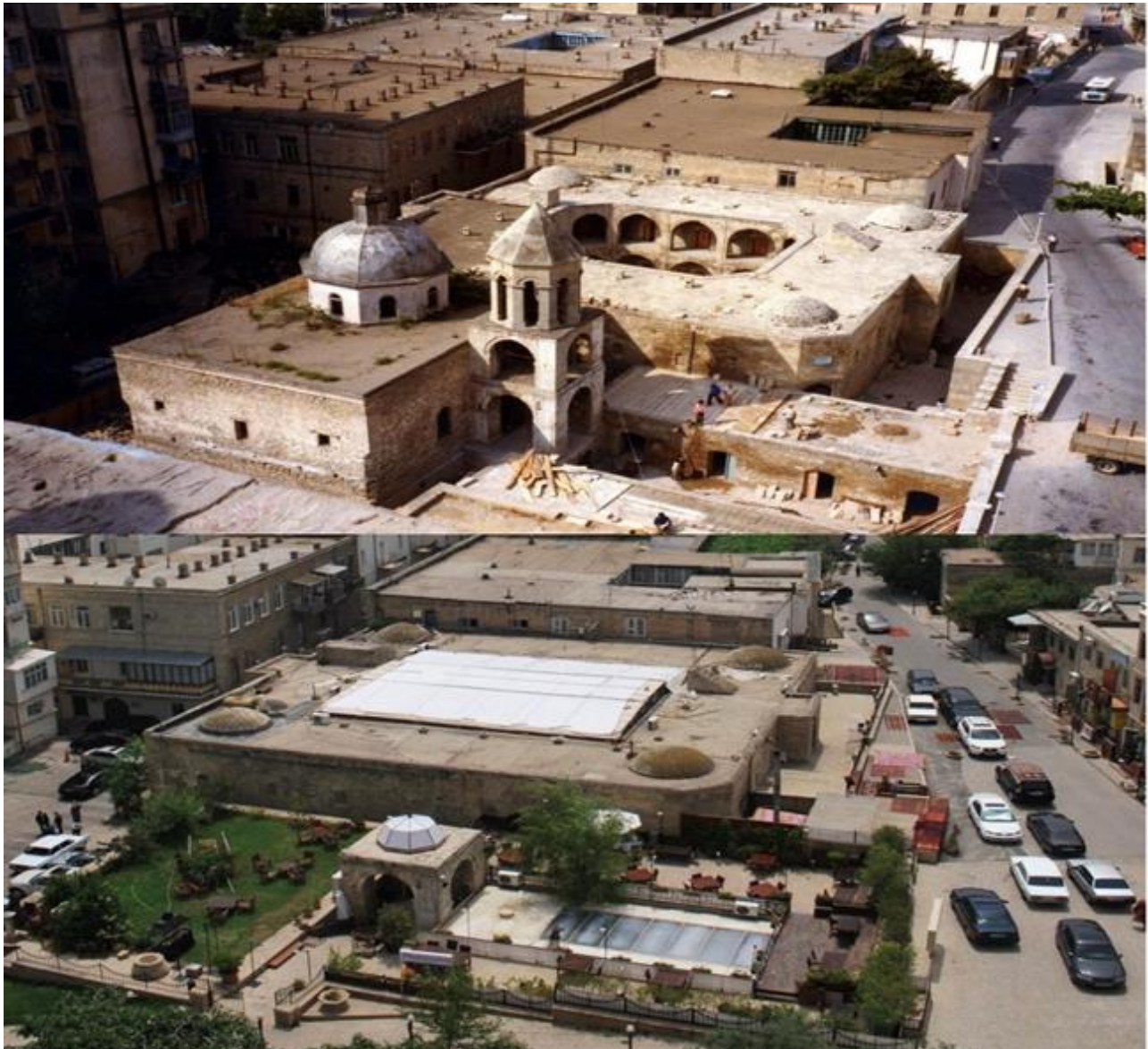
Annex 4: The destruction of the Armenian Church in Baku

Surb Astvatsatsin Church (Holy Mother of God Church) in Baku (1797-1992)