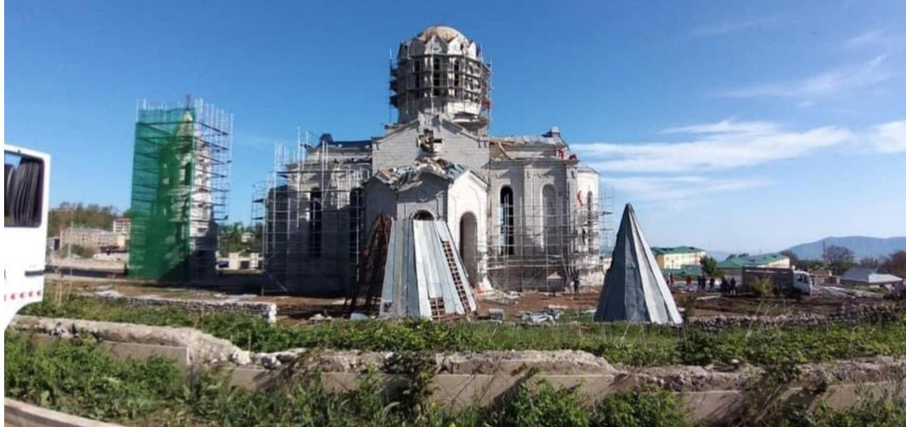
Annex 6: Reconstruction of Holy Savior Ghazanchetsots Cathedral of Shushi