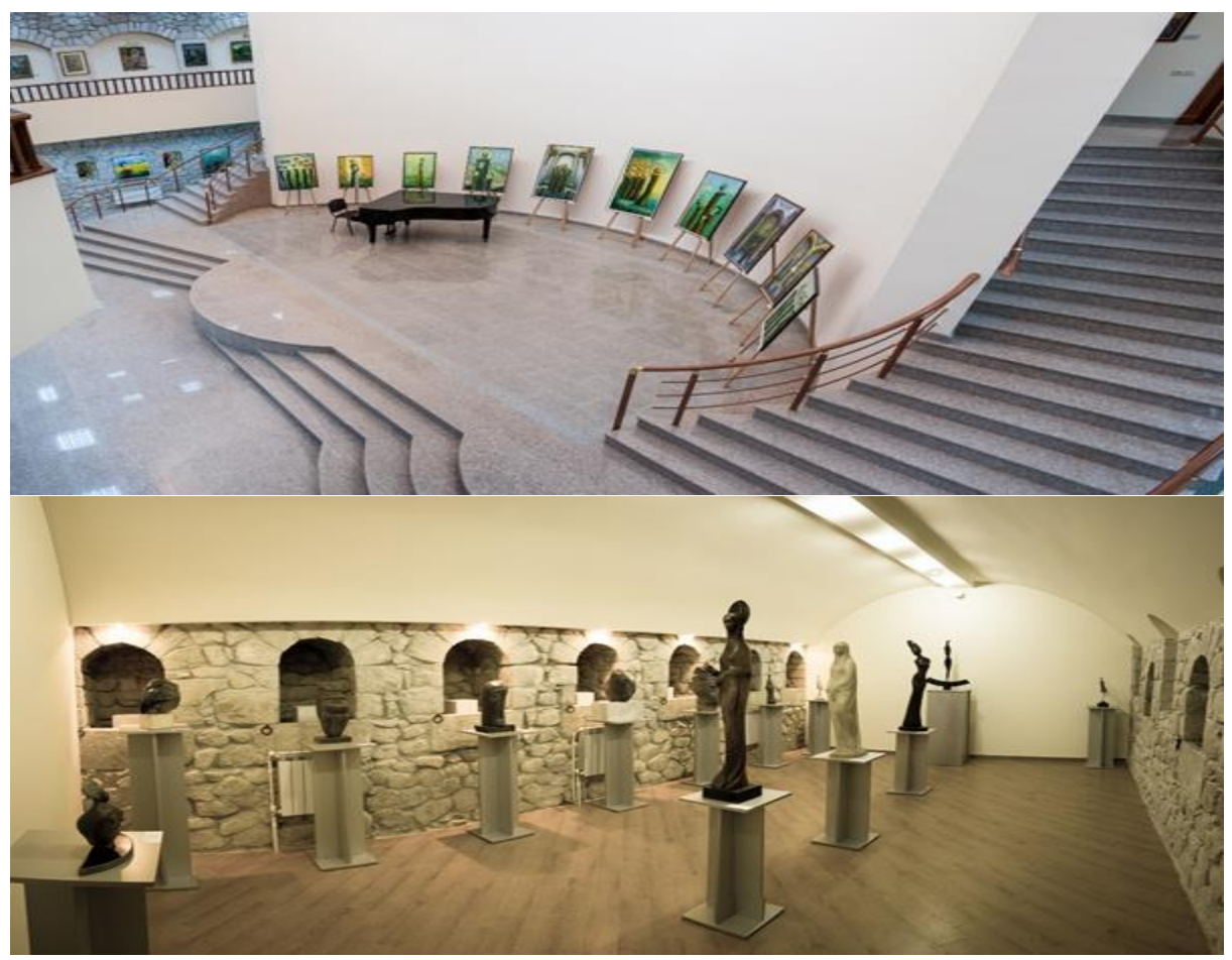
State Museum of Fine Arts