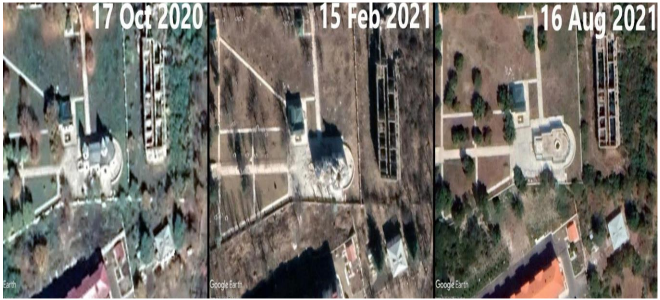
Recent satellite images show the progressive destruction of Kanach Zham Church