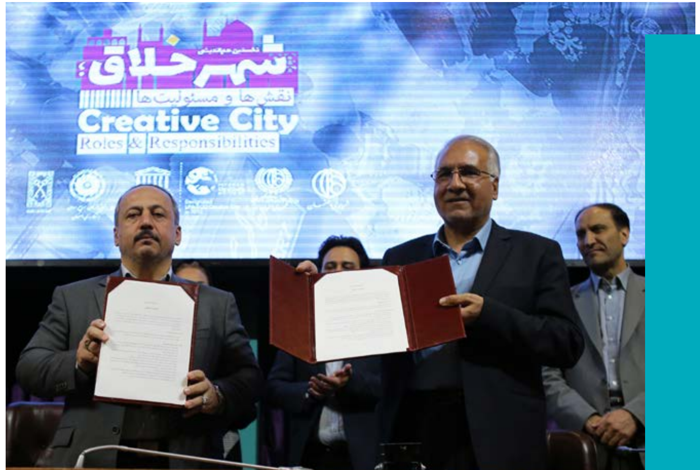
Photo: the joint meeting and the MOU by the mayors of Isfahan and Rasht

Following the Memorandum, two meetings were held between the cities of Isfahan and Rasht to share their experiences of membership in the UCCN. At the first meeting in Isfahan, the mayor of Rasht spoke about the experience of an urban development project, sharing the results with Isfahan city managers.