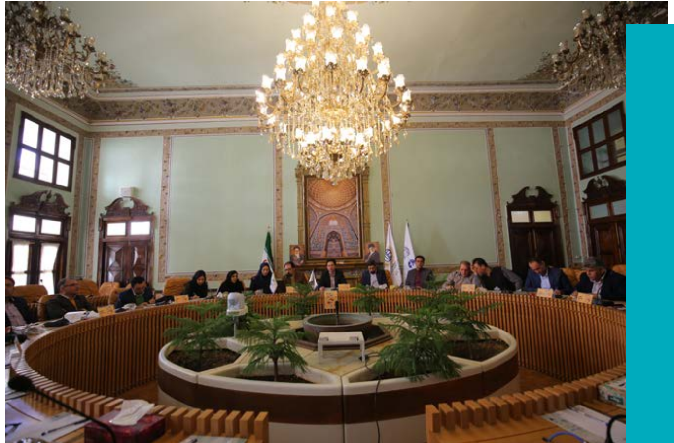
Photo: Creative City, Promotion and Development Conference

At this meeting, we gave detailed presentations on the UCCN and its objectives, membership process and documentation, as well as the responsibilities of member cities. We tried to increase the influence of the UCCN among other cities of Iran. Among the cities invited were delegates from Sanandaj and Bandar Abbas, later elected to join the UCCN in October 2019.