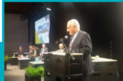
Mayor of Isfahan, Ghodrattollah Norouzi' speaking at the Mayor's Forum, Krakow Annual Meeting, 2018

Prior to the meeting, Isfahan requested to host the 2020 annual meeting , which was followed by the mayor at the Krakow meeting.