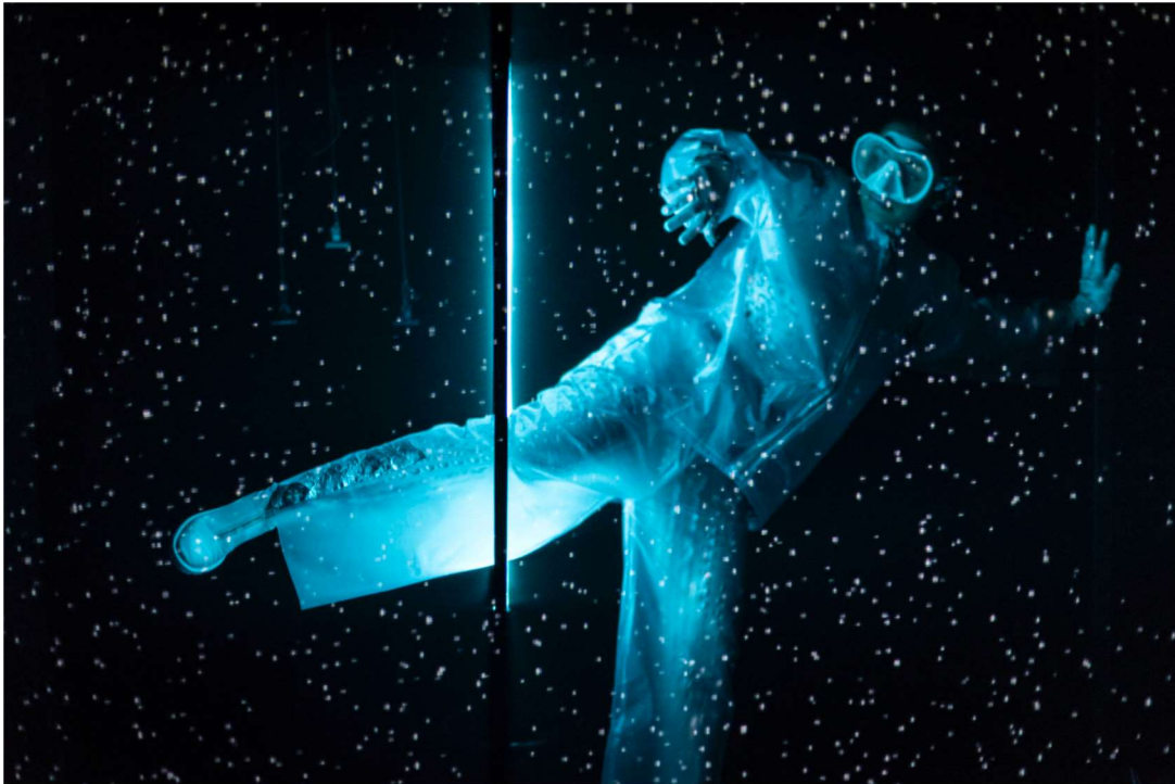
Céto