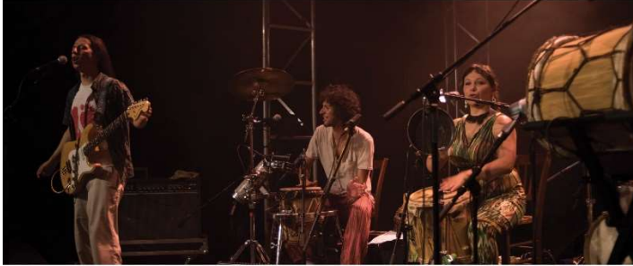
20 octobre 2017 - Marché Gare - Concert de Curupira