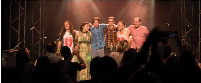
20 octobre 2017 - Marché Gare - Le public est enthousiaste