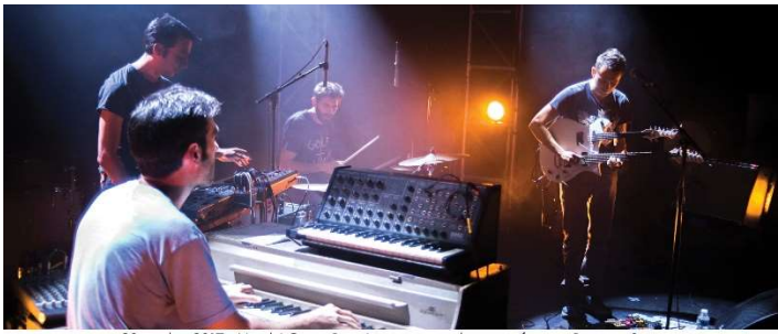
20 octobre 2017 - Marché Gare - Première partie avec le groupe français Direction Survet