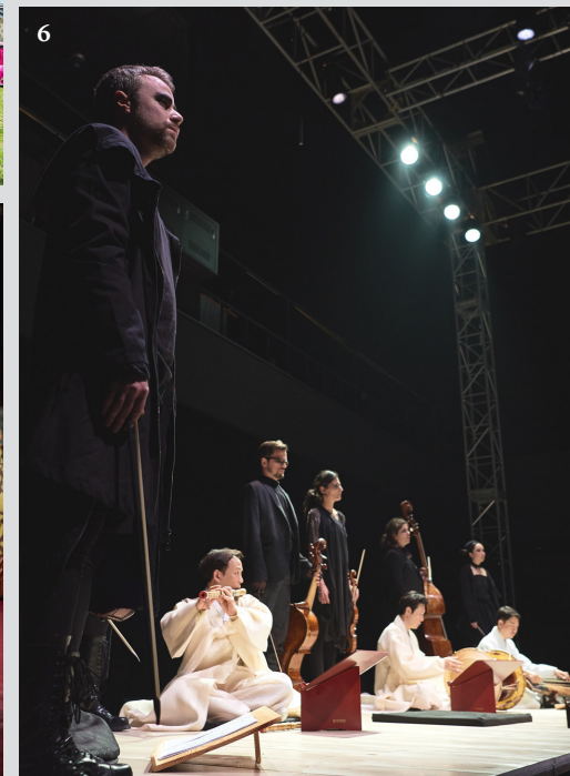
5 Namhean Byeolsingut (Fishermen's shaman rite of the south coast)