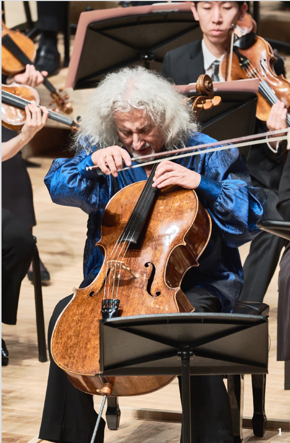
1 Tonyeong International Music Festival 2019