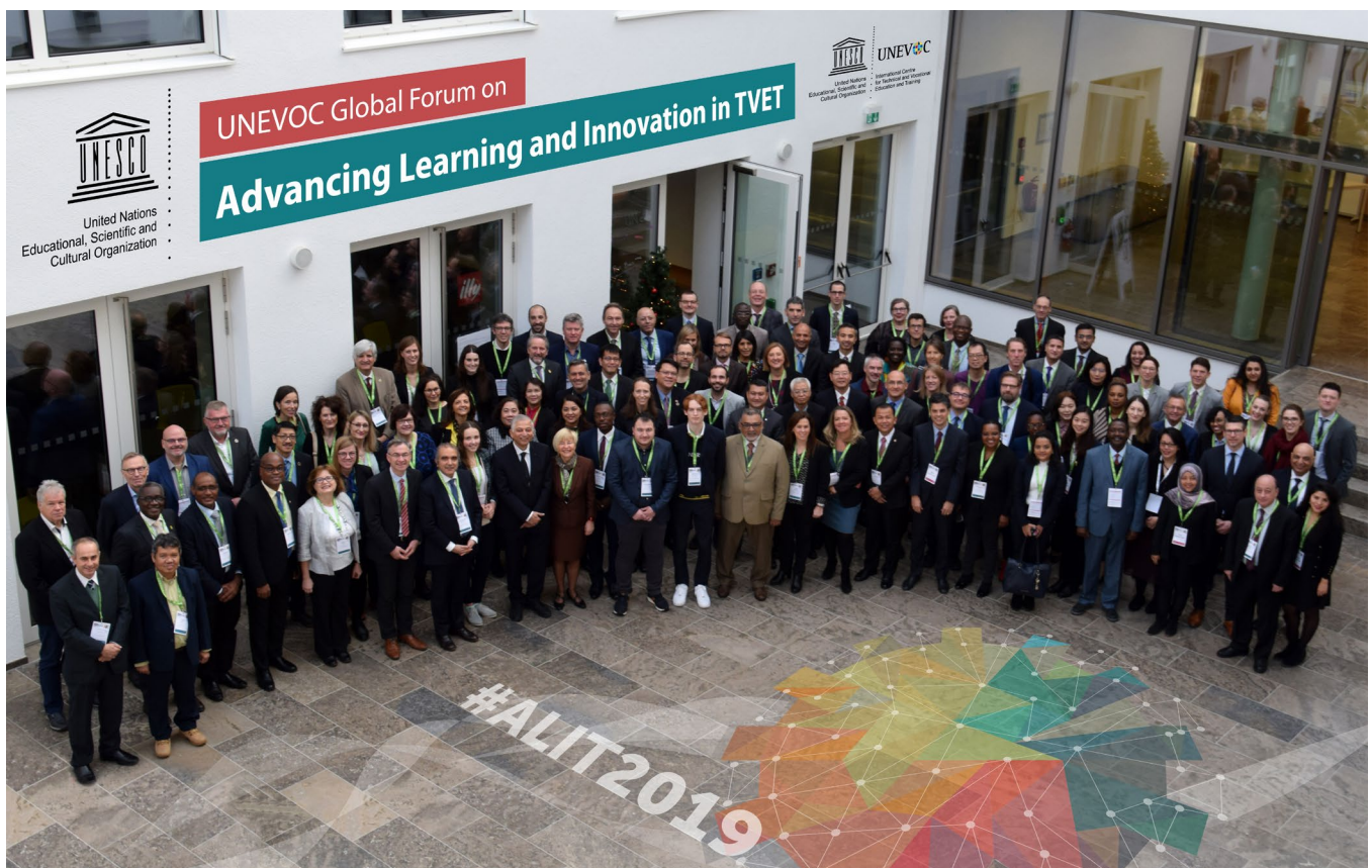
Participants of UNESCO-UNEVOC's 2019 Global Forum on the opening day

The way TVET is organized, planned and practiced is changing to make it more responsive – and therefore relevant – to prevailing issues in society, the economy, and the environment. TVET stakeholders committed to this transformation are facing various challenges in the form of high levels of youth unemployment, guaranteeing opportunities for lifelong learning, and contributing to fulfilling the Sustainable Development Goals to name a few. Global experiences show that these challenges cannot be addressed using ‘business-as-usual’ approaches. Existing systems and institutions not only need to anticipate the impact of innovations taking place in businesses and labour markets, but also to act upon them.