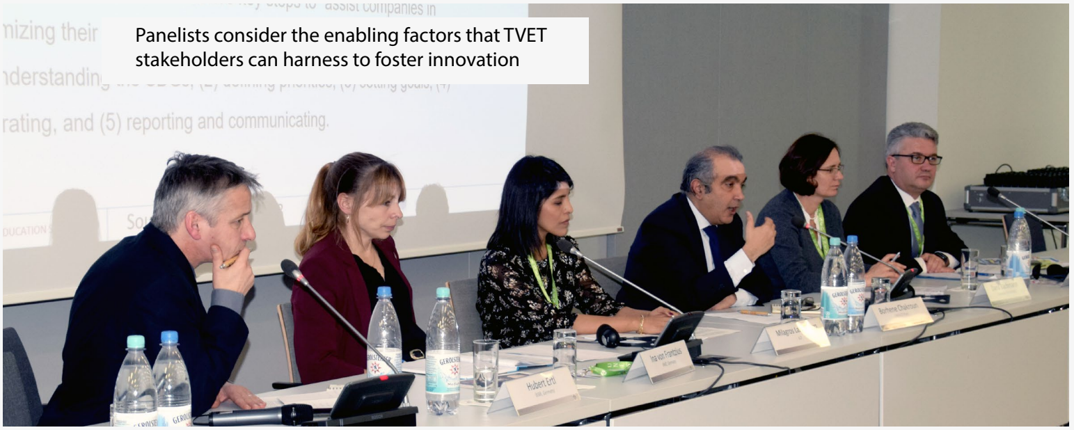
Panelists consider the enabling factors that TVET stakeholders can harness to foster innovation