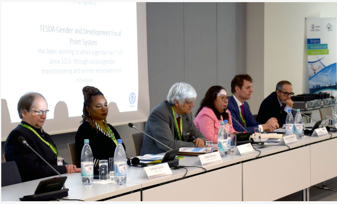
Panelists discuss how to adopt curricula and training changes to prepare for digital and inclusive societies, and circular economies