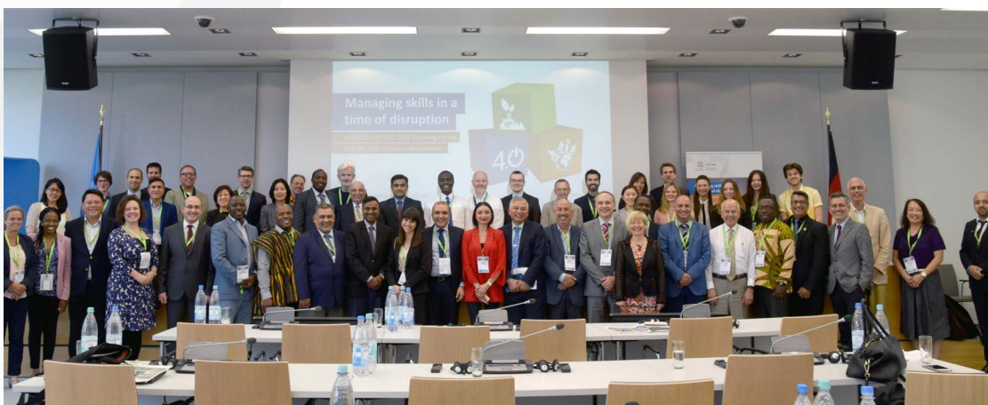
Forum participants and organizers on the last day after the closing session

UNESCO-UNEVOC, together with its partners, extend its gratitude to all participants and experts who took part in the discourse and provided valuable leads and examples of cooperation in the field of TVET.