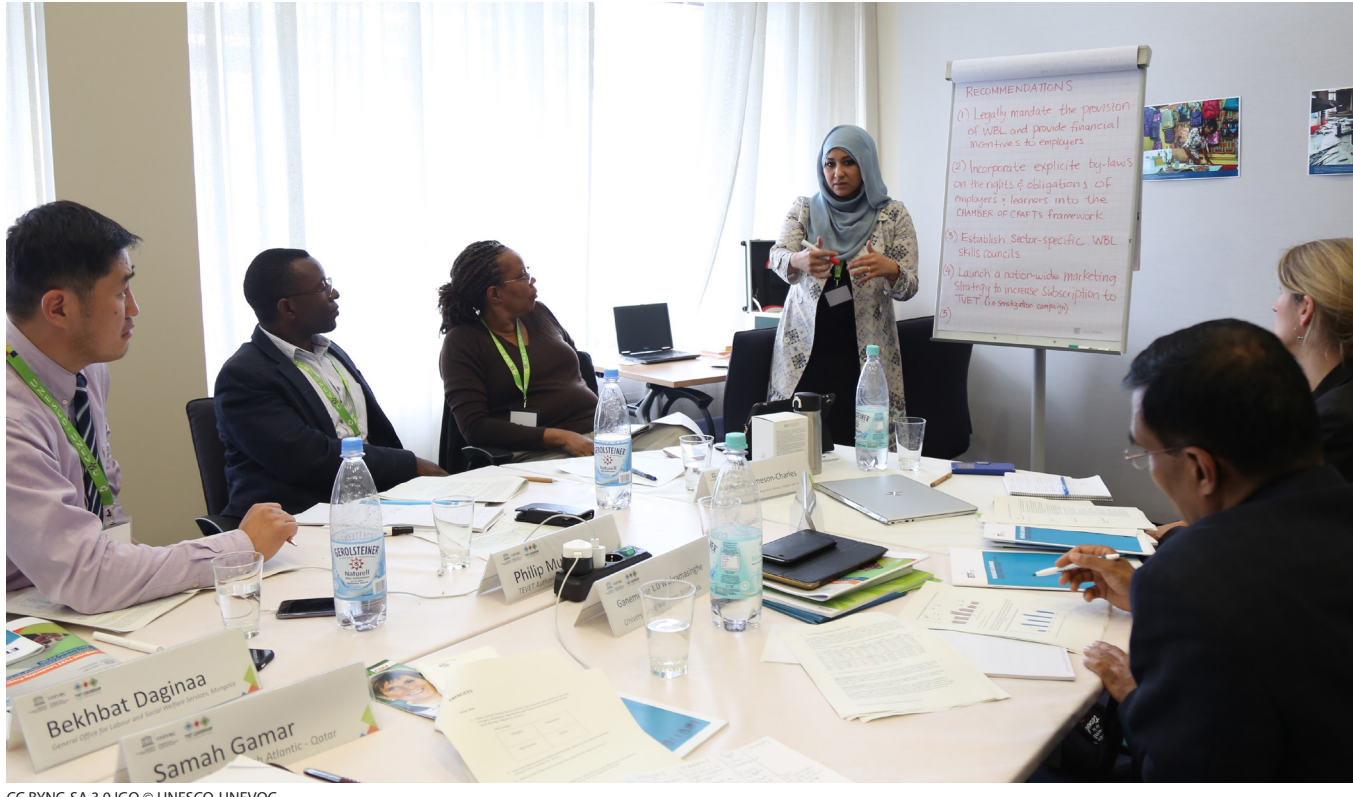
CC BYNC-SA 3.0 IGO © UNESCO-UNEVOC