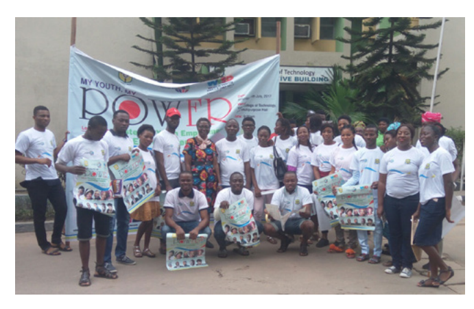
The Yaba College of Technology in Nigeria mobilized young people and the local community with colourful posters and matching shirts.

Despite the benefits of TVET on personal, professional and national development, a recurring issue has been the relative unattractiveness of vocational education and training as compared to academic education for students. Part of this