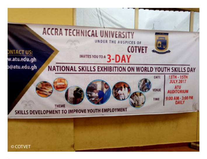
A banner promoting a skills exhibition at the Accra Technical University in Ghana. The Council for Technical and Vocational Education and Training organized the skills exhibitions across Ghana.

The activities organized by the Council for Technical and Vocational Education and Training were complemented by a three-week training workshop organized by the Department of Vocational and Technical Education of the University of Cape Coast. The programme was open to all young people, regardless of their education background, and generated a lot of interest in the local community. Courses taught students in batik production, food preparation and sugar farming, and at the end of the training workshop, students presented their products.