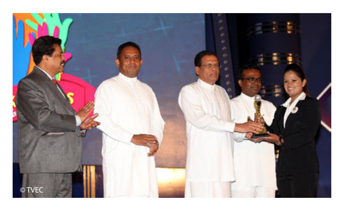
One of the 33 winners of a skills competition organized by the Tertiary and Vocational Education Commission in Sri Lanka receives her prize from a representative of the ministry.

The National Skills Development Agency in India organized, together with the Ministry of Skill Development and Entrepreneurship, an event to celebrate the second anniversary of the SKILLS India initiative. The initiative was launched in 2015 when World Youth Skills Day was first