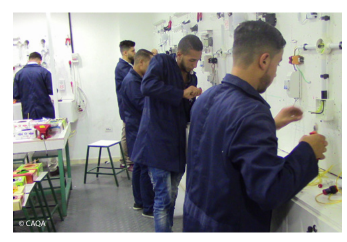
Students learning their trade during the training programme organized by the Centre for Accreditation and Quality Assurance for TVET in Jordan.

and the comparative advantages of technical and vocational education and training over academic education. The workshop was blended with a practical component whereby students were introduced to the TVET Academy, an online platform which was developed to carry curriculum modules and training video materials. Students were encouraged to test the online platform, which not only exposed the students to different ways of learning and training, but also helped them take part in a discussion on the use of such platforms for teaching. The interactive daylong workshop concluded with a discussion on career choices and future possibilities.