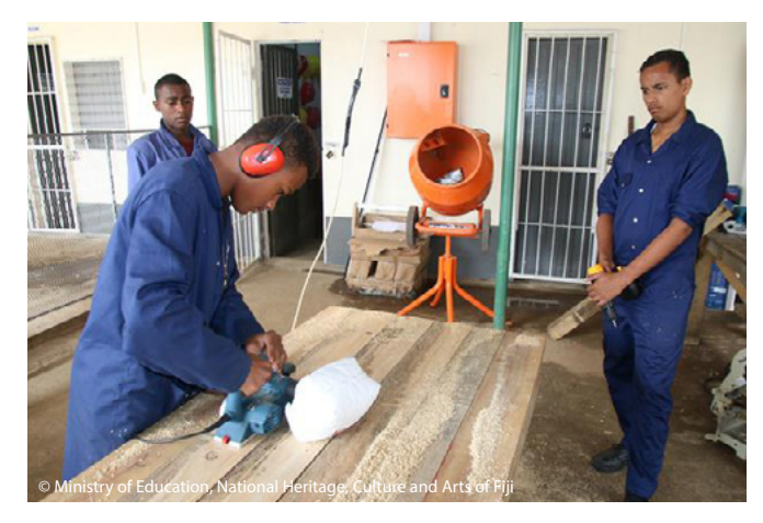
The Ministry of Education, National Heritage, Culture and Arts of Fiji encouraged all TVET institutions to highlight the importance of skills development for young people during their open days. Carpentry students showcase their skills at one of the events.

Fundación Paraguaya in Paraguay held a workshop that targeted about 20 students from the San Francisco de Asis School, a local agricultural school close to the capital, Asunción. The workshop invited students, aged 15 to 19, to reflect on and discuss topics linked to World Youth Skills Day