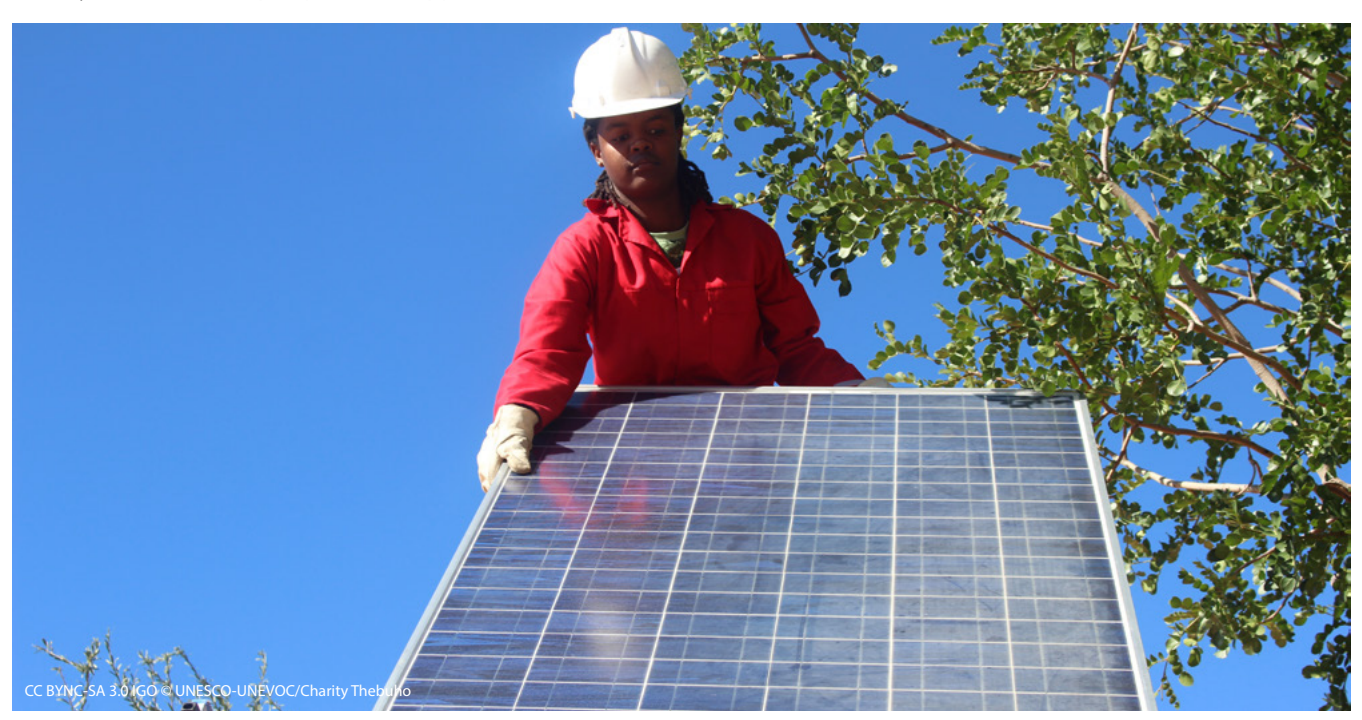
UNESCO-UNEVOC SkillsinAction Photo Competition

Mid- to senior-level personnel of the National College of Technical and Professional Education in Mexico met from 27 to 30 June to discuss about the potential of TVET to contribute to sustainable development in Latin America. The workshop convened TVET institutions from four Latin America countries, as well as key training providers in Mexico. The national college also used the event to raise awareness and discuss about the importance of skills development for young people, as well as ways to green their institutions with student participation. This included involving students in research on topics linked to sustainability, and the role of students in promoting a greener culture. In addition, the National College of Technical Professional Education also launched a social media campaign that targeted the wider community, students and teachers, and other networks of TVET institutions in Latin America.