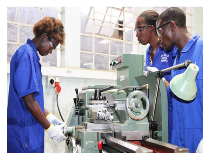
SkillsinAction Photo Competition social media prize

Country: Nepal