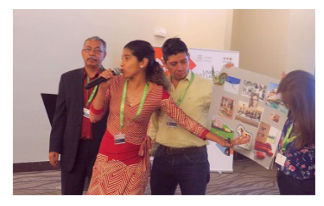
UNEVOC TVET Leadership Programme in Panama

Through the 2018 Regional UNEVOC TVET Leadership Programmes, fifty TVET experts from twenty-five countries and thirty-nine institutions were trained to become transformative leaders. This network of TVET leaders continues to provide a vital impetus to TVET transformation and reinforces national, regional, and global development goals.