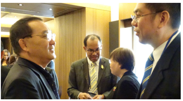
Participants at the UNEVOC East and Southeast Asia Cluster Consolidation Workshop