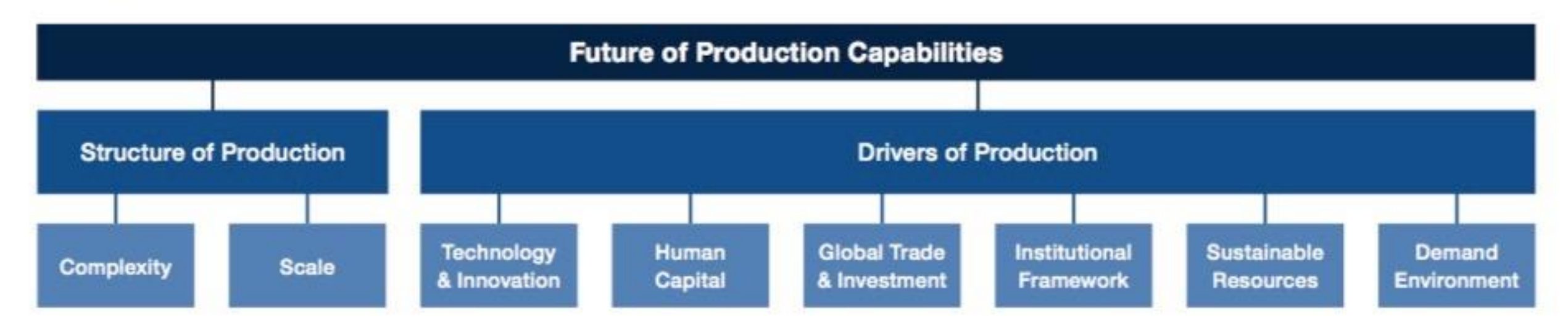
Figure 1: Readiness Diagnostic Model Framework