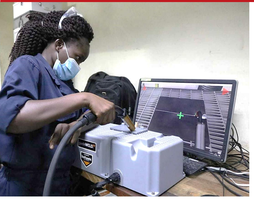
Welding simulator using Augmented Reality