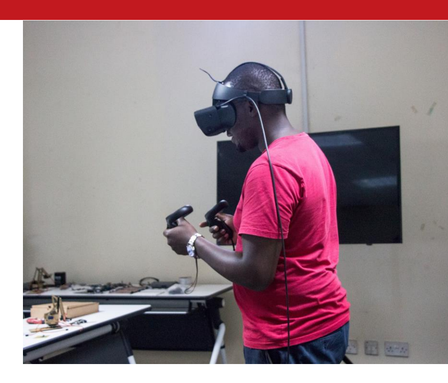
Training using Virtual Reality