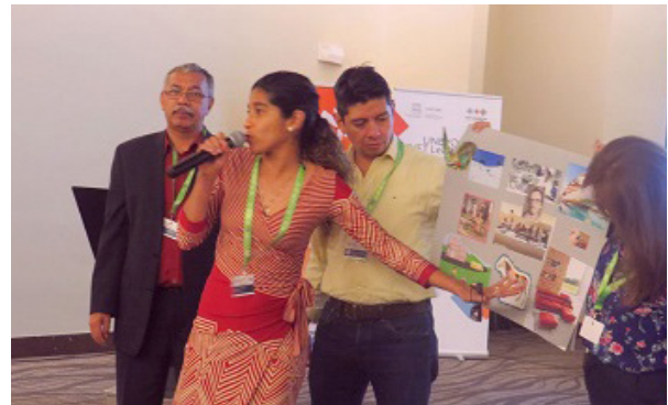
UNEVOC TVET Leadership Programme in Panama

Through the 2018 Regional UNEVOC TVET Leadership Programmes, fifty TVET experts from twenty-five countries and thirty-nine institutions were trained to become transformative leaders. This network of TVET leaders continues to provide a vital impetus to TVET transformation and reinforces national, regional, and global development goals.