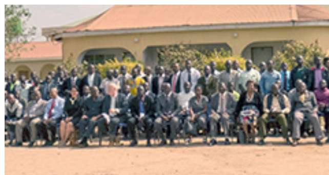
STEP Programme in Malawi

As the Malawi TEVET system moves towards a more decentralized structure, there is a need to develop the managerial capacities of institutional leaders. The STEP