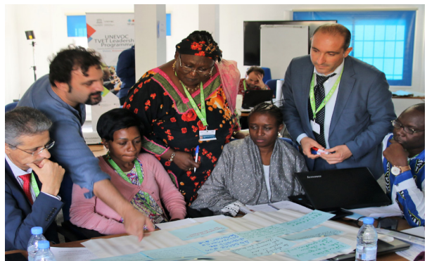
UNEVOC TVET Leadership Programme in Dakar