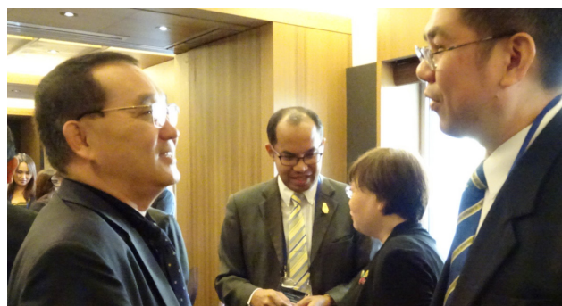
Participants at the UNEVOC East and Southeast Asia Cluster Consolidation Workshop