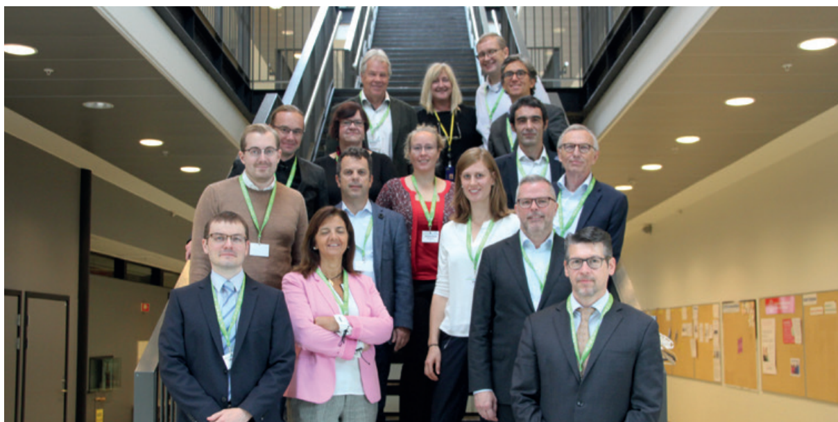
Participants from the BILT Digitalization workshop at OsloMet, Oslo, Norway