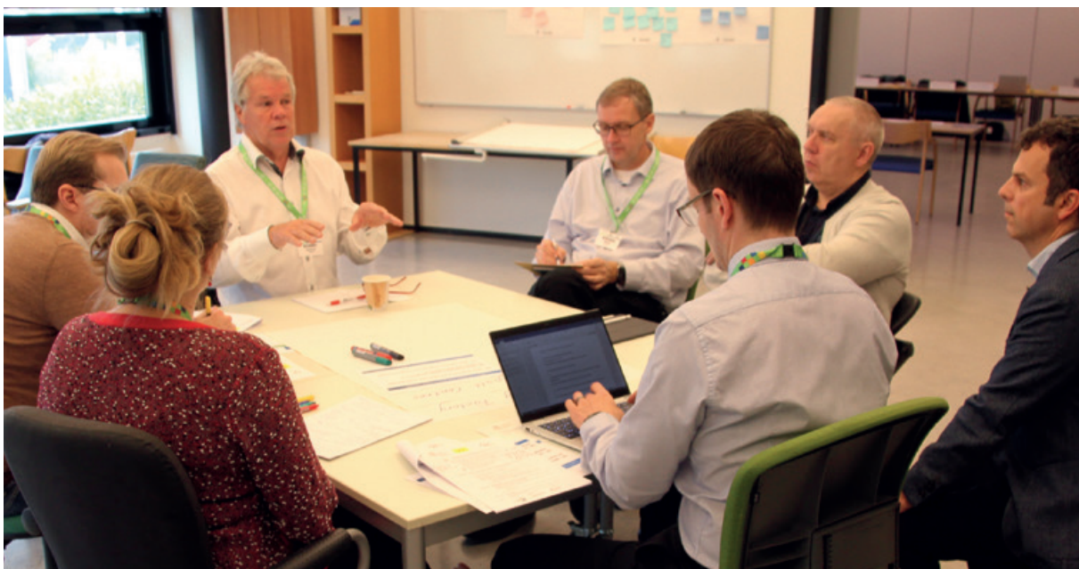
BILT workshop participants discuss a project example during the World Café session

This project seeks to map ‘21st century skills’ (for example IT-skills, digital media skills or entrepreneurial skills) of TVET students by using data science. In a second step, the data is used to create different student profiles (18 different profiles were found, 8 common to each participating TVET school) and to assess the effect of educational activities related to 21st century skills. The core question of the project is thus: What is the effect of educational activities on 21st century skills, depending on different student profiles? The project’s purpose is to gain insights into the development of 21st century skills, which are crucial both for TVET students as active citizens assuming responsibility in society, as well as for future employers who need employees with relevant skills.