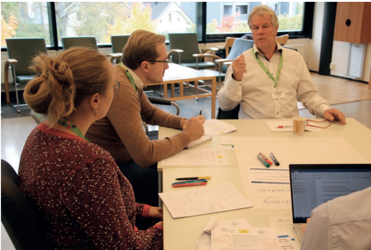
Group work during a World Café Session

Participants underlined the importance of further collaboration within the BILT project process through sharing experiences and maintaining a content-driven discussion. Concrete activities such as sharing information as well as presenting innovative approaches to each other were wished for. Content-wise, participants proposed to investigate common traits which connect the different BILT project work streams – such as the achievement of greening processes through digitalization. A first step towards this goal was reached through the work stream on ‘New qualifications and competencies’ and the corresponding BILT workshop at the UNEVOC Centre SFIVET in November 2019.