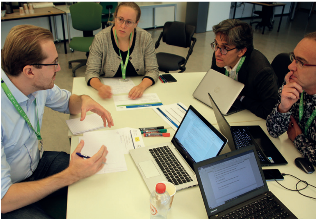
Group work during a World Café Session

A representative from Kyambogo University Centre for Vocational Pedagogy and Lifelong Learning in Uganda – partner institute of OsloMet and an African UNEVOC Centre – participated via Video Conference as a passive observer to the presentation of the above listed 'BILT Innovation and Learning Practices'. Thereby, OsloMet initiated a first step towards the BILT Bridging process which will establish an interaction between the European Cluster of the UNEVOC Network and African as well as Asian partners. 30 people at the University of Gothenburg in Sweden participated online, including representatives from academia and the Swedish automotive sector.