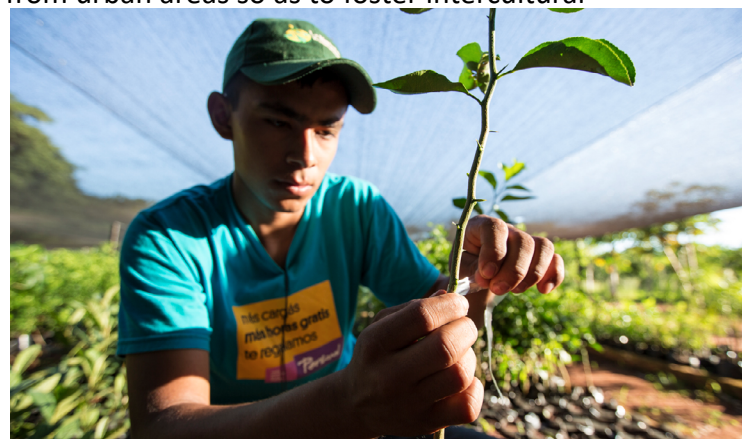
... the other half on the ground

The Self-Sustaining Schools are designed to become self-contained communities. They are boarding schools, where the students, both male and female, must learn to get along with other students, who come from diverse cultural backgrounds and from differing regions. While most students are from rural areas, a conscious effort is made to include some students from urban areas so as to foster intercultural