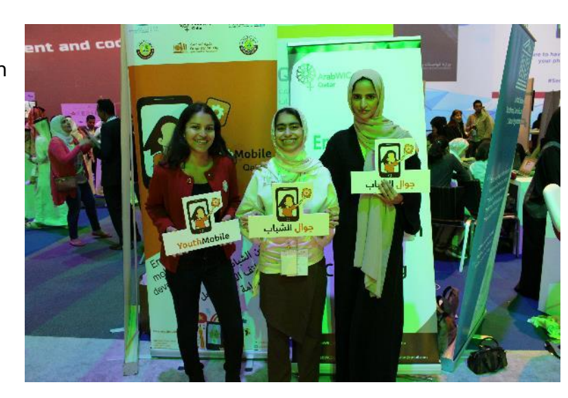
UNESCO YouthMobile (Qatar 2017)

Scaling of projects: creation of policy tools to support governments while introducing coding education, scaling up of existing local projects