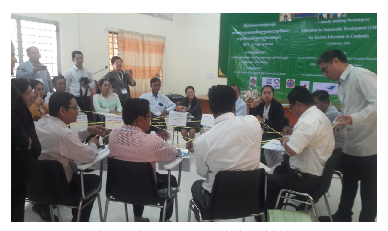
In-service Workshop on ESD's Integration in Modulkiri province