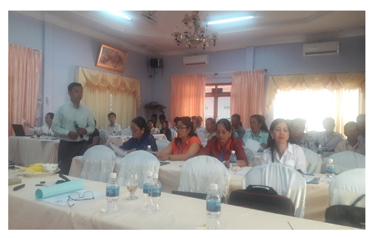
In-service workshop to enhance ESD organized and conducted by NIE