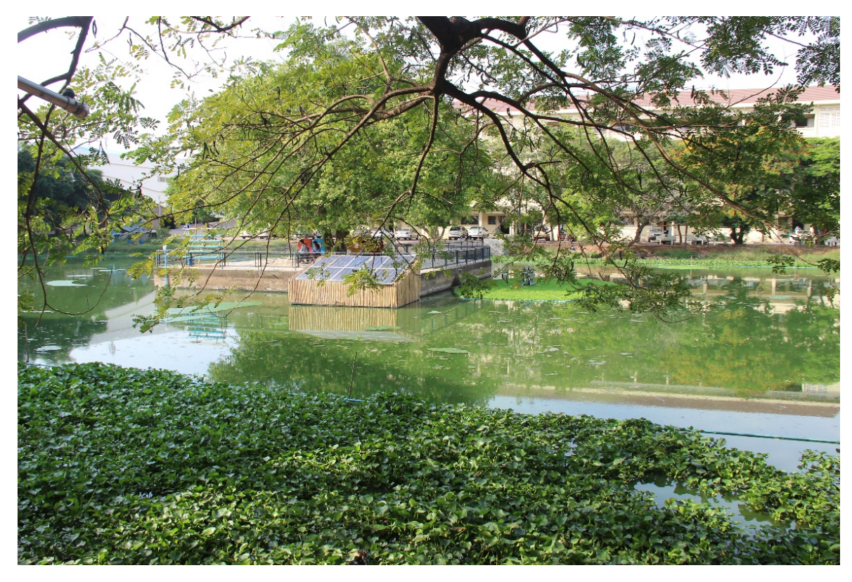
Waste water cleaning project using plant and solar powered oxygenation process