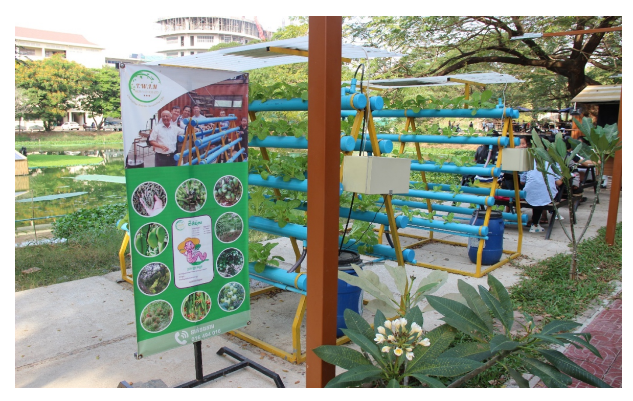
Students' project on growing vegetable on water