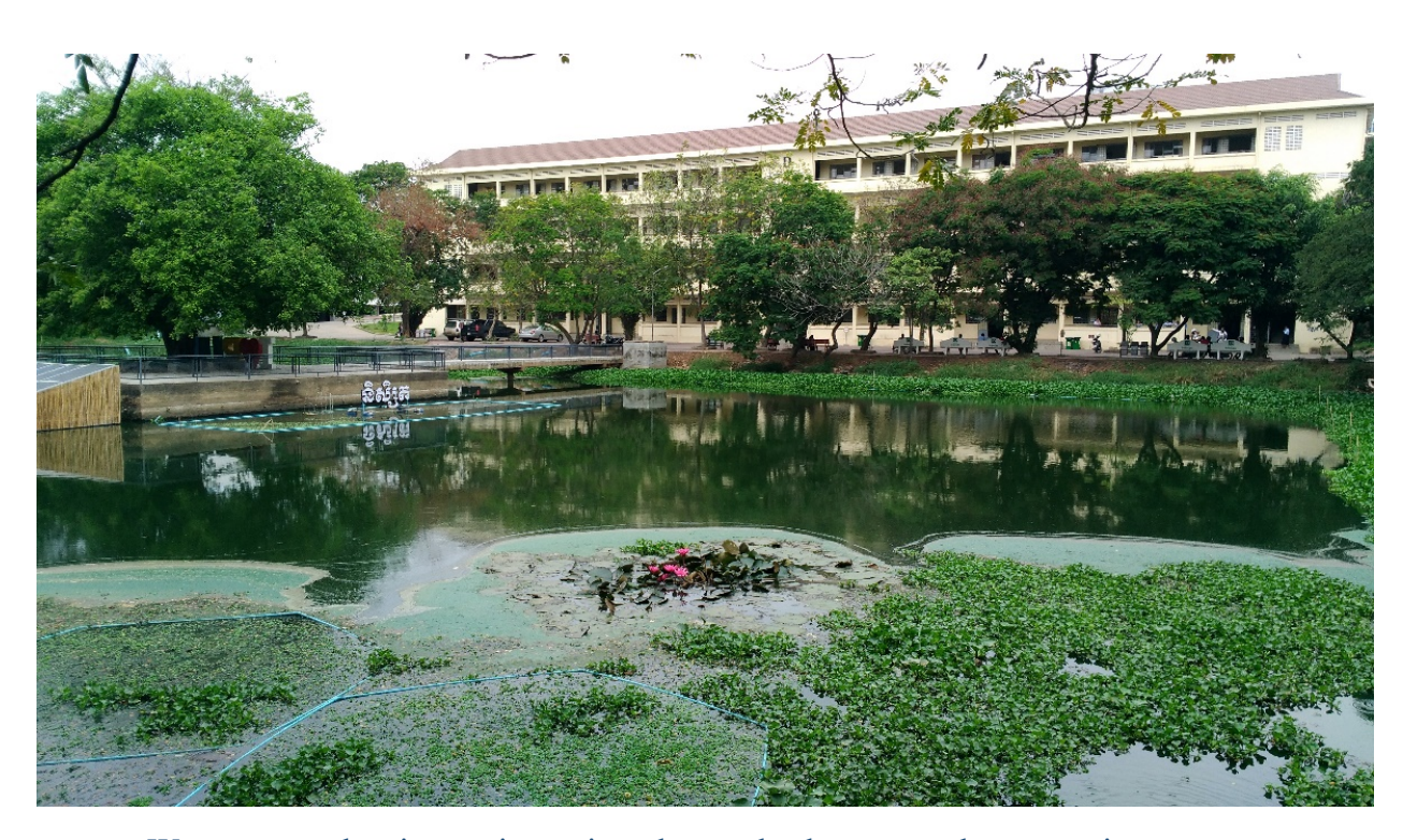
Waste water cleaning project using plant and solar powered oxygenation process

At university level, ESD concepts were implemented as separate student projects funded by the university. These projects included the replacement of normal street lighting within the two campuses to solar powered lighting. Another project was waste water treatment using water plants and solar powered water oxygenation. What students learned from those projects was encouraged to share with other students and other people in their communities.