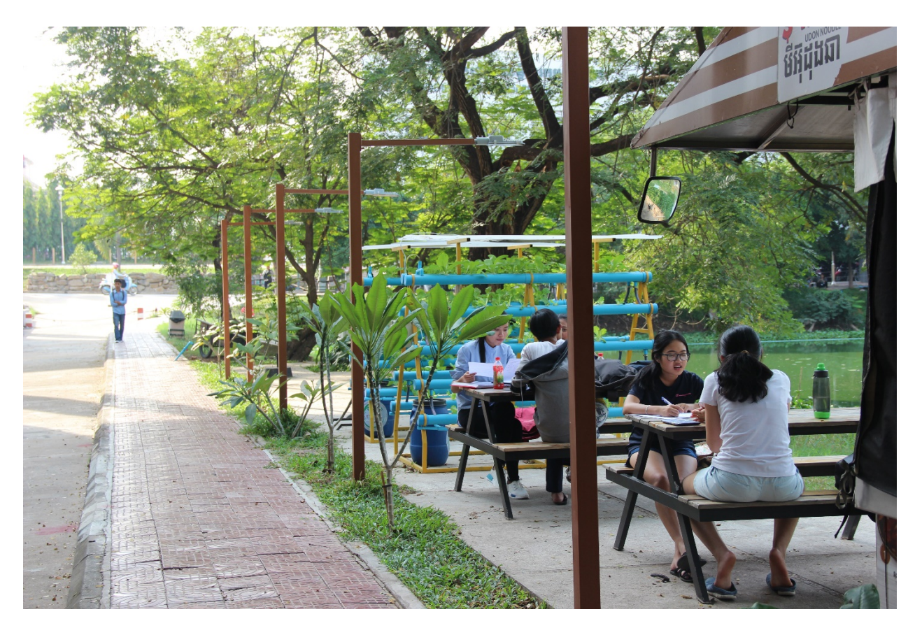
How ESD projects transform the campus to be conducive for learning for students and relaxing for the surrounding communities

At faculty level, the Faculty of Education started to put ESD as a key agenda in projects and other activities. For instance, ESD concepts were planned to integrate into the current project on Teacher Upgrading Program by introducing coursework and developing practical activities among 240 trainees in 2018-2019, 810 trainees in 2019-2020, and 1110 trainees in 2020-2021. Another was about working to integrate ESD concepts into the current Master of Education's curriculum and the course on ESD was planned to deliver for the cohort 13 in 2019.