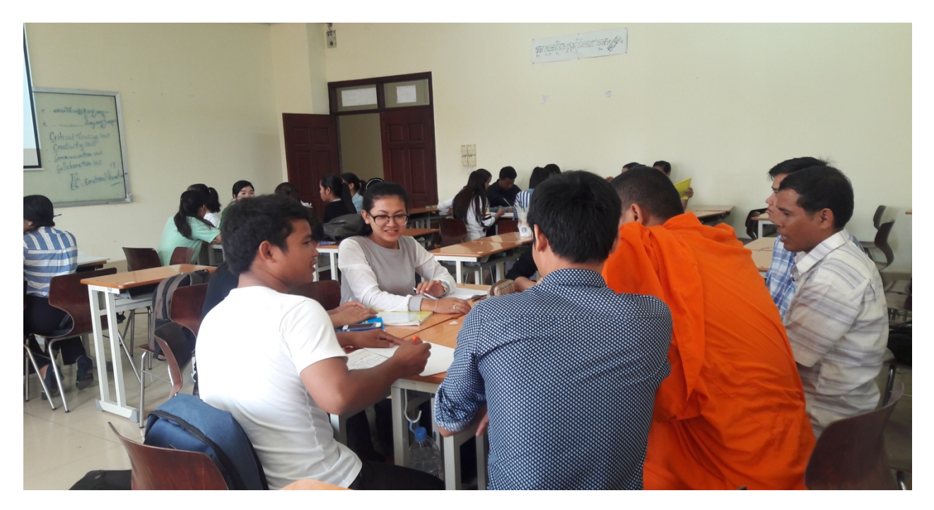
Cascading workshop on ESD in Kampot Province on 01-02 February 2018