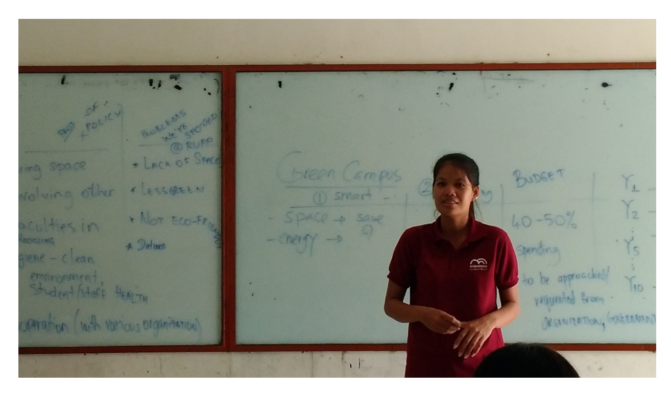
The implementation of the ESD concepts at classroom levels in the Faculty of Education, Royal University of Phnom Penh: Presentation of How the Concept Can be Further Implemented