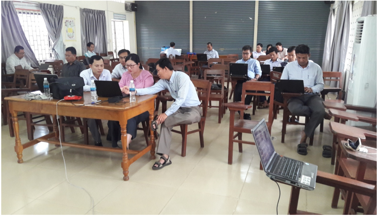
Workshop on Revising and Harmonizing PREST and INSET USS Teacher Training Syllabi in Kampong Cham Province: 29 March-02 April 2018