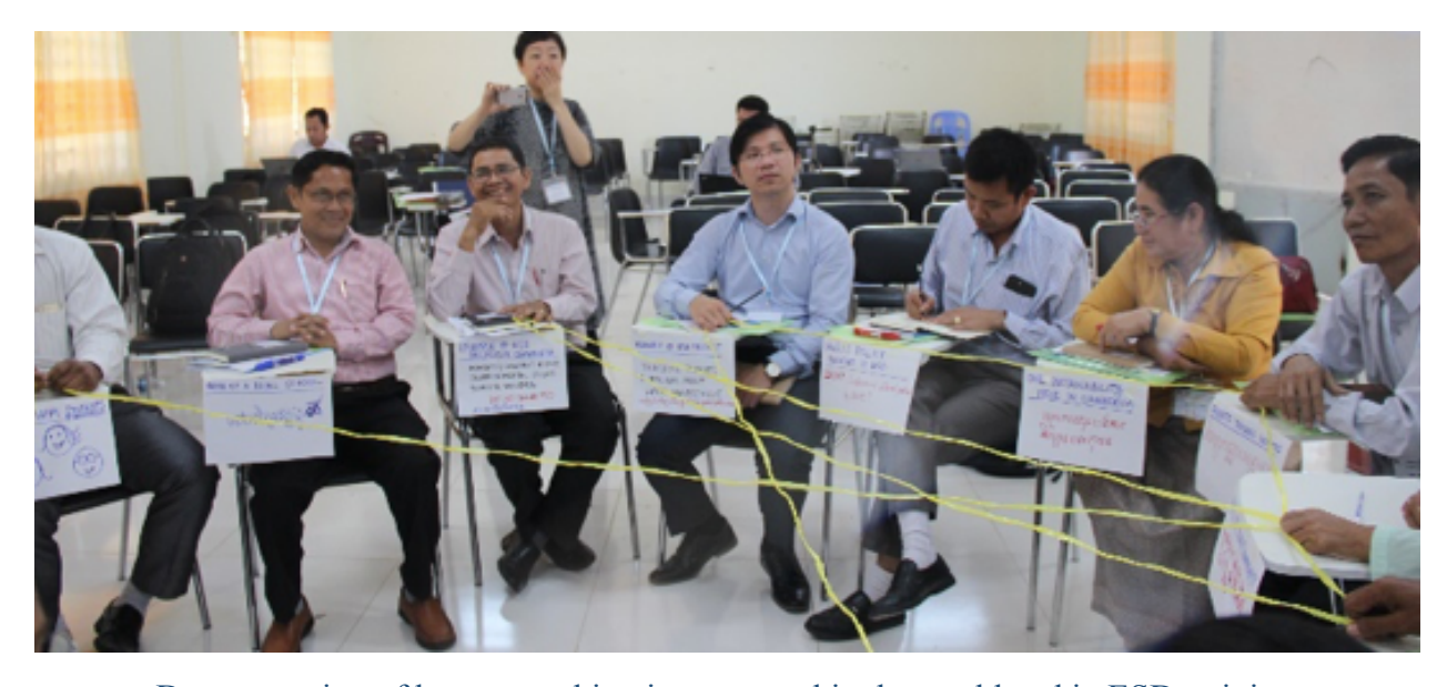
Demonstration of how everything is connected in the world and in ESD training