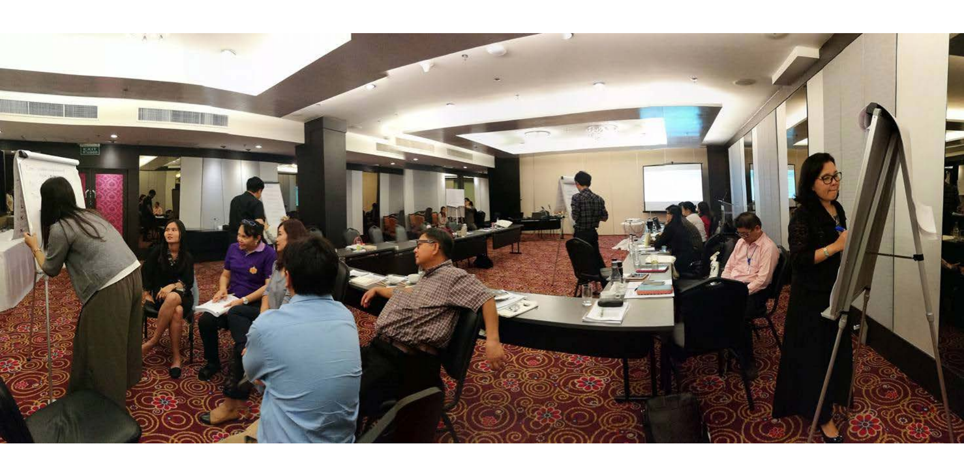
Planning of ESD Projects