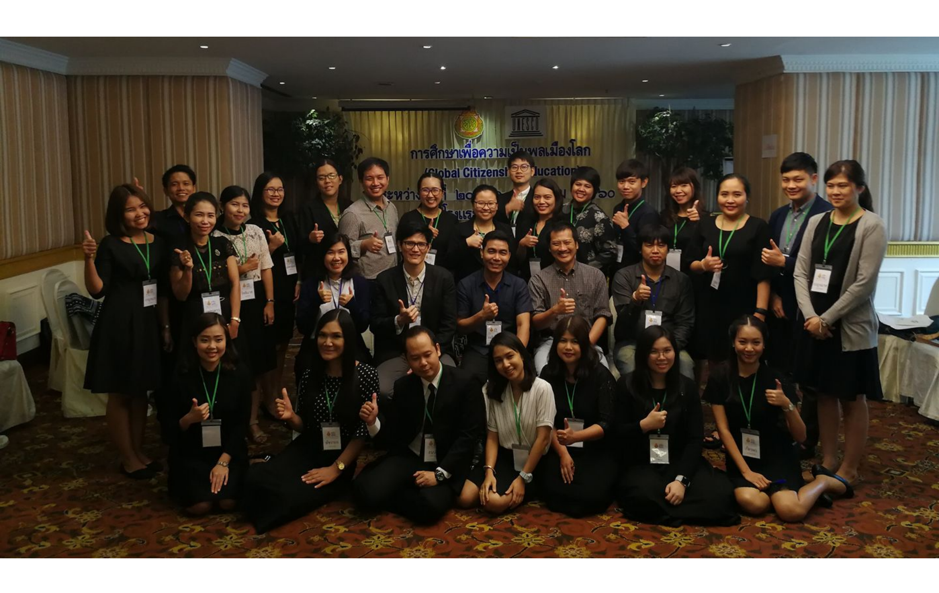
GCE core teachers in 4 Pilot School