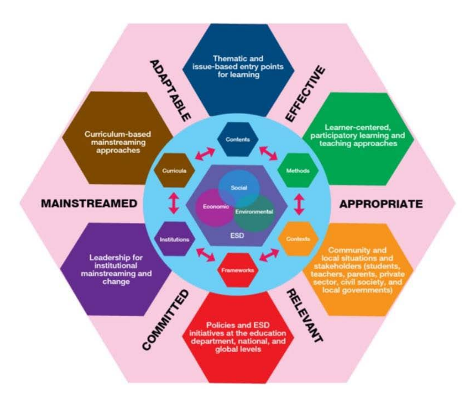
Figure 2. Proposed ESD integration framework for pre-service teacher education