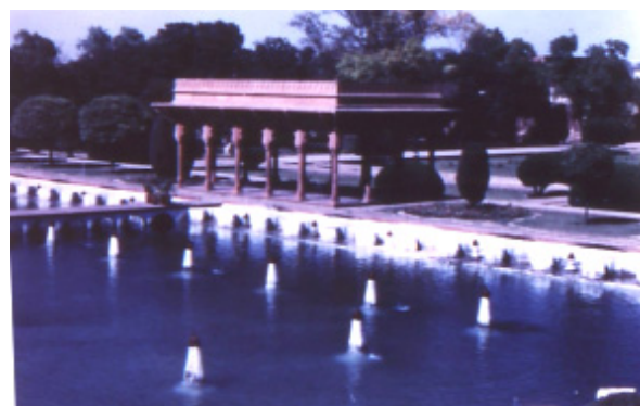
Eastern Pavillion at Middle Terrace after restoration