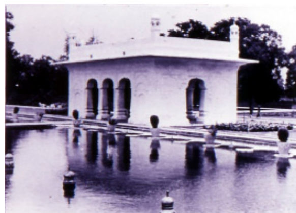
Eastern Pavillion at Middle Terrace before restoration