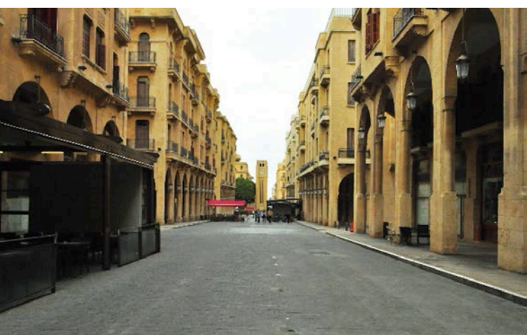
Figure 9. Maarad Street.

Yet, at urban level, the renovated historic core failed to reconnect to the city's traditional fabric in a multidisciplinary manner, which sparked heavy gentrification and diluted the original vibrant economic and social exchanges integral to Beirut's city centre.