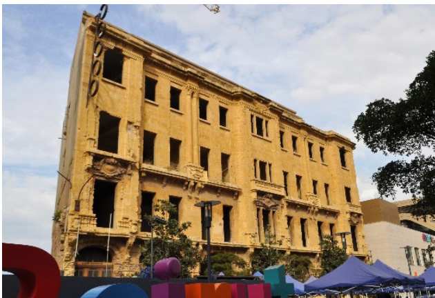
Figure 13. L'Orient Le Jour. © Howayda al-Harithy