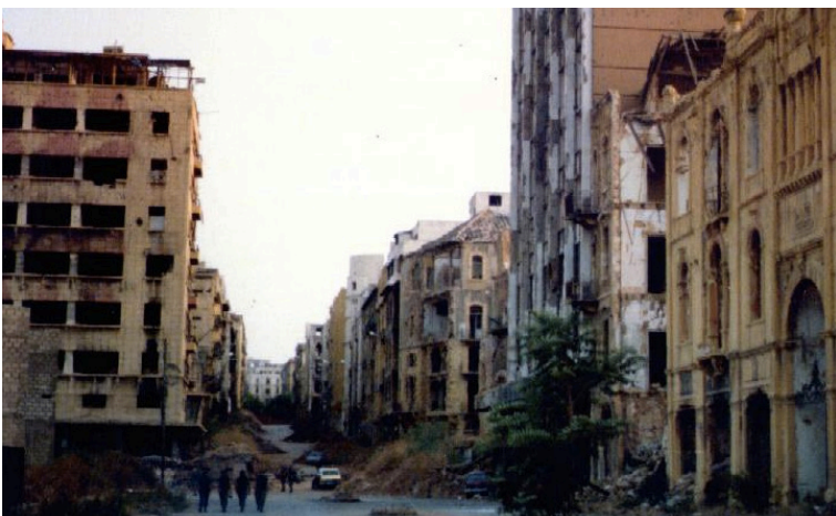
Figure 2. Green Line, 1982.