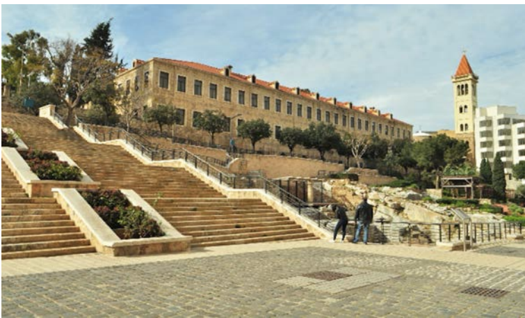
Figure 10. CDR building on the Serail Hill.

which were turned into the headquarters of the Lebanese Government and the office building of the CDR (Figure 10), respectively.