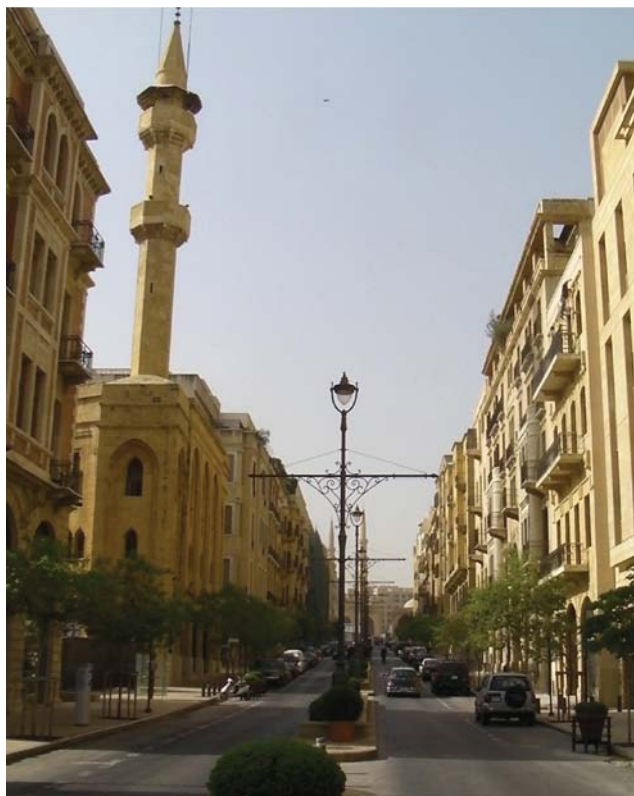
Figure 4. Beirut Central District.

This specific urban morphology that has shaped social, generational and functional diversity in Beirut could have, ideally, offered lessons for a sustainable vision if it was considered in conjunction with the prevailing socio-economic conditions and urban form 58 .