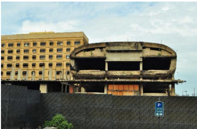
Figure 12. City Centre Dome 'the Egg', a modern landmark.