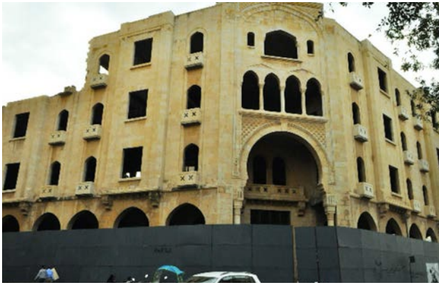
Figure 11. Beirut's Grand Theatre.