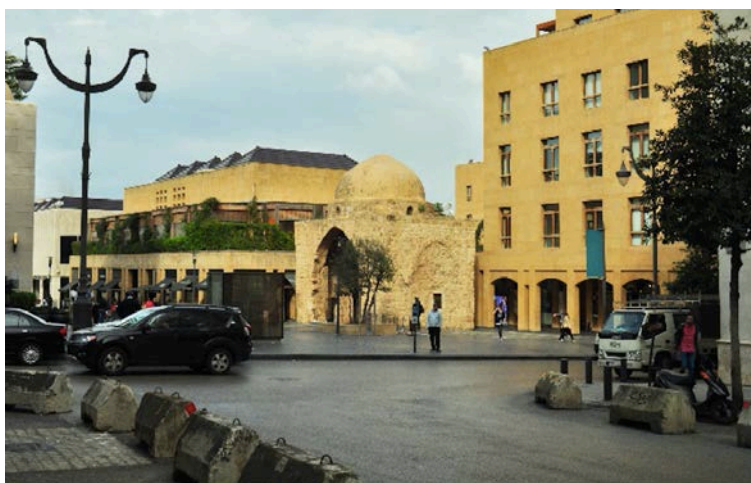
Figure 15. Zawiya Ibn Arraq.

Interestingly, these heritage components animated the main pedestrian access points and formed an interface with the surrounding urban context, thereby creating ‘corporeal anchors for the contemporary, ultra-modern city that tie it to its rich and varied history and articulate the specificities of its character formed and reformed over time’. 145