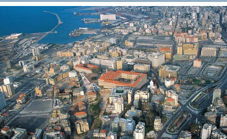
Figure 1. Aerial view of Beirut.

sector, including banking, finance, hospitality and entertainment, thus became a major asset to attracting tourism activity.