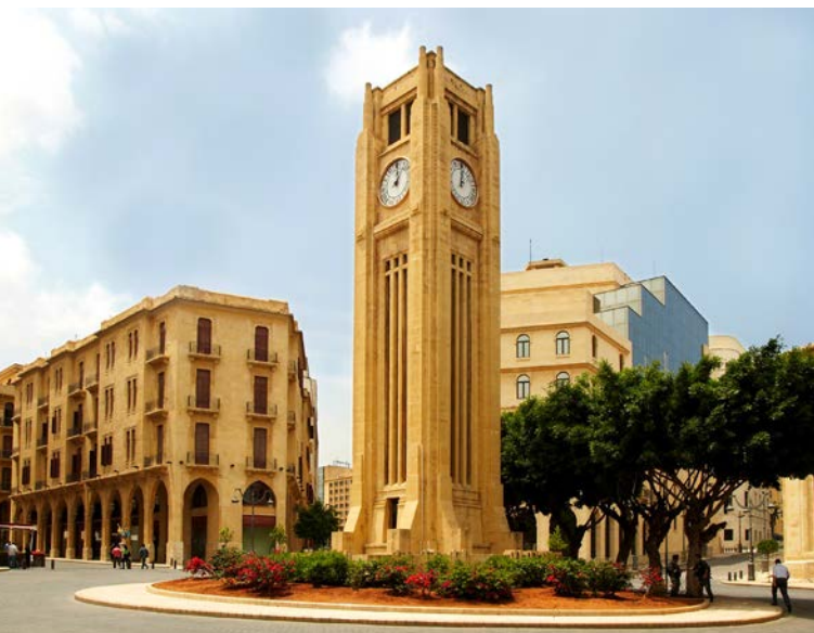
Figure 8. Nejmeh Square.

Drawing on the urban and architectural assets of the area, including its numerous civic, financial and religious landmarks, Solidere's Master Plan redefined the area as the 'new' historic core of Beirut, and nurtured a strong sense of 'communal and national identity'. 132 The pedestrian-friendly area quickly became a pole of attraction at the end of the conservation works.