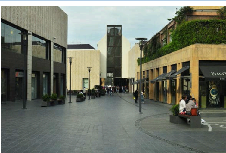
Figure 14. The Souks southern entrance.