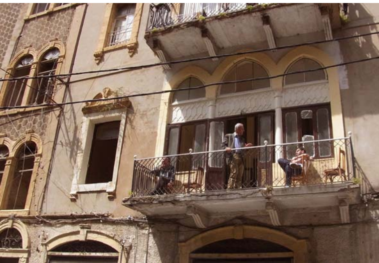
Figure 5. Franch Mandate-era housing, Gouraud street.

a sense of place, the integrity of the urban fabric and the identities of communities 96 remained unattainable in Lebanon. Moreover, the international cultural heritage instruments ratified by the Lebanese Government were not legally binding nor materialized into national regulation 97 . When the 1991 Master Plan for post-war reconstruction was conceived, the only existing national regulation, the outdated Law No.166 of 1933 98 , provided ambiguous and/or limited definitions and management procedures related to antiquities and historic monuments.