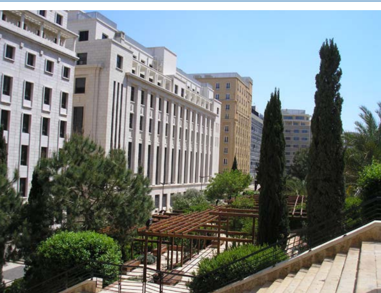
Figure 3. Beirut Central District.

[...] the authority to create real estate companies in war-damaged areas, and to entrust them with the implementation of the urban plan and promotion, and the marketing and sale of properties to individuals or corporate developers. 54