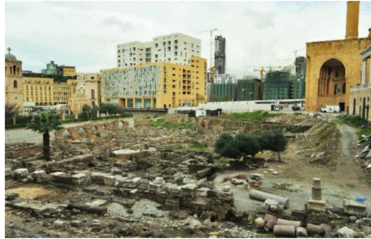
Figure 7. Garden of Forgiveness.

and the state. 122 In 2002, Solidere claimed US$ 17 million in compensation for increased infrastructure costs due to delays of the DGA on sites with archaeological findings, and estimated that 'the costs are bound to increase as long as issues remain unresolved'. 123