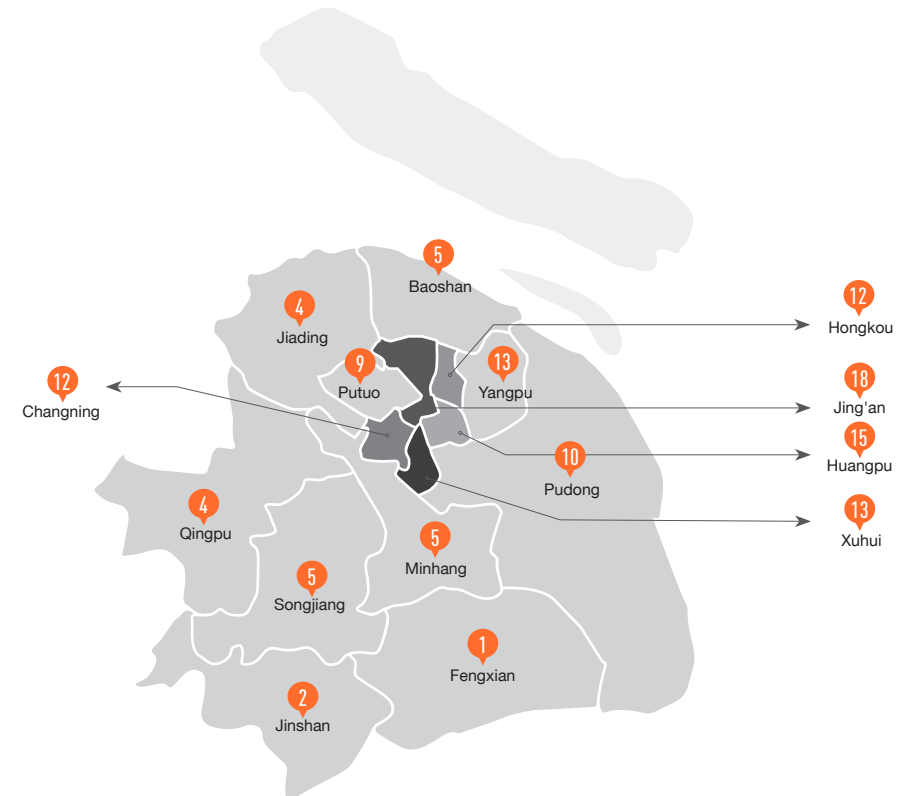
Figure: Numbers of Creative Industry Parks by district distribution

Currently, Shanghai has identified 128 city-level cultural and creative industry parks, 10 of which are demonstration parks.