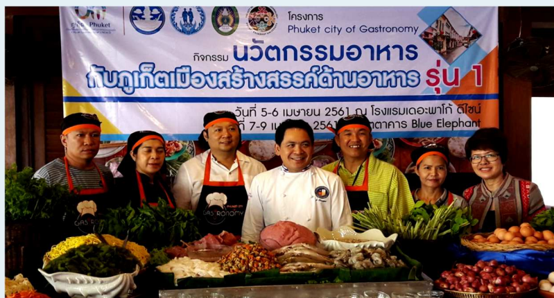
Gastronomic innovation and Phuket as a gastronomy city project on April 5-9, 2018

In order to achieve the objectives of the UCCN's platforms including the opportunities for sharing experiences, knowledge and best practices made available to the local community at all levels. In particular, Phuket City Municipality is promoting knowledge management and research and innovation by assembling data and