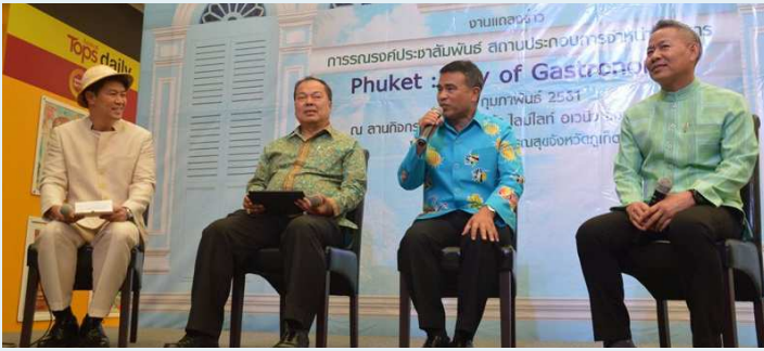
Press Conference for Phuket City of Gastronomy on Public Relations, Restaurants and Production Sources