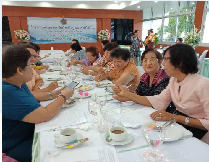
The local cuisine curriculum development on April 9-10, 2018 Phuket Vocational College

A further aim of UCCN is to develop hubs and platforms of creativity and innovation. With this in mind, a further project was initiated and completed in a synergized effort between a local college and the civil society, namely the local cuisine curriculum development by Phuket Vocational College. The curriculum was commented on by local experts and seniors. Five short courses were developed, including a main course, desserts, snacks, a single-dish menu, and healthy food. To stimulate creativity, the Junior Local Chef course was offered to 100 participants of all ages. The program also helped drive Sustainable