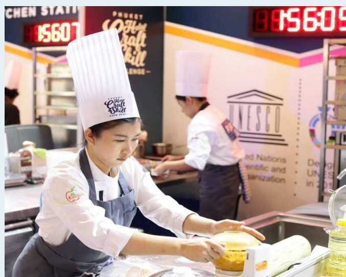
Phuket Hotel Craft & Skill Expo 2019 on July 5-7, 2019