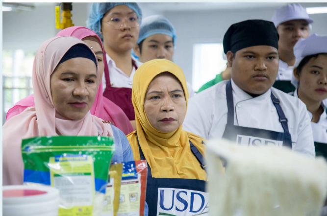
American Inspired Chef Project for Greater Creativity on Local Food Design on Oct 21-22, 2019