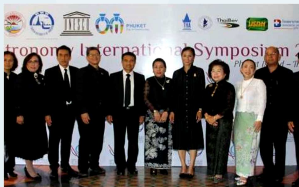
1 st Gastronomy International Symposium 2017 April 28 – May 1, 2017 at Phuket, Thailand

Phuket has been designated as a UNESCO Creative City of Gastronomy since 2015, making it the first city in Thailand and ASEAN that is affiliated with 35 other Cities of Gastronomy worldwide. One of the exceptional elements contributing to the prosperous culture in Phuket is its cuisine. It is varied from Andaman seafood and Thai food to Phuket's traditional food or Baba, including processed food. Local dishes especially possess a strong identity and distinctive recipes utilizing local ingredients, which are passed down from generation to generation in each family. The public and private sectors have been eagerly cooperating to create culinary innovations and add value to the economy, which have been core factors in economic development under the cultural identity throughout the last four