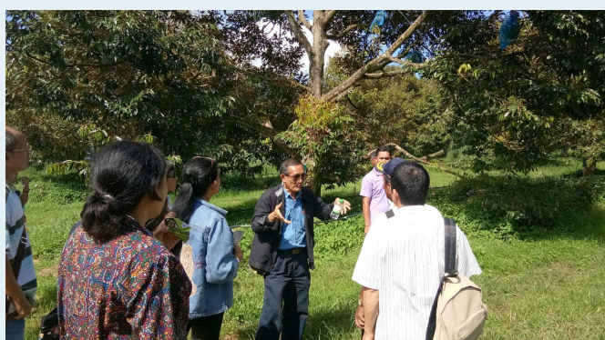
Field Trip on June 14-18, 2018

Learning Center for Agricultural Products in Patiew District, Chumphon