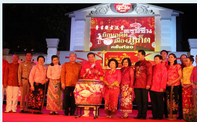
The Opening Ceremony of 20 th Phuket Chinese New Year and Old Phuket Town Festival 2019

This is one of the largest gastronomic festivals in Phuket, with the ultimate goal of preserving the local heritage of old Phuket town while capitalizing on the city's tourism, creativity, culture and gastronomic features to establish prosperity and sustainable development of Phuket. It started in 1998, and in 2019, it celebrated its 20th anniversary. The festival was collaboratively organized by 12 key partners from the City of Gastronomy Committee, local communities, public- and private sector organizations, and the Phuket Creative Gastronomy Club. Among the key activities were a street food zone under the theme of "City of Gastronomy and Phuket Signature Dish," with a display of 40 certified Phuket Gastronomy Standard restaurants and