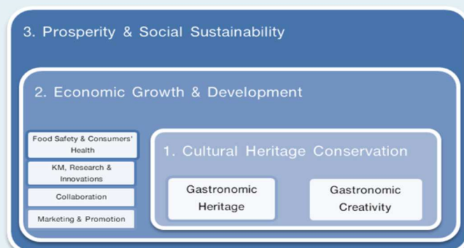
Figure 1 The importance of gastronomic creativity and thus utilized it as a key policy in the development of Phuket's social, environmental, and economic aspects.

Following Phuket's designation in the UNESCO Creative Cities Network, the City of Gastronomy Committee was set up to involve partnerships of the public and private sectors including the representatives of the local community with its main responsibilities to create policies, plans and projects making gastronomic culture as the objectives of UCCN as key drivers for Phuket's development. With the motto "Clean Food, Good Taste, Good Spirit" in mind, the committee aims to integrate the joint efforts of key stakeholders to ensure that the development of the City of Gastronomy is sustainable with the objectives of UCCN fully comprehended. The five main tasks of the committee are public relations, knowledge management, research/creative food chain development, activity organization, and UNESCO framework implementation.