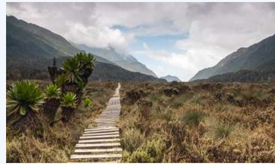
Bigo Bog, Rwenzori Mountains, Uganda

In Uganda , the Ministry of Tourism has announced plans to upgrade road access to the UNESCO World Heritage site Bigo bya Mugenyi (Archaeological Earthworks) and the cultural heritage sites Nyero, Patiko and Emin Pasha's fort. The plans are part of the Government's UGX 2.2 trillion ($US600 million) commitment to develop tourism infrastructure over the next five years.