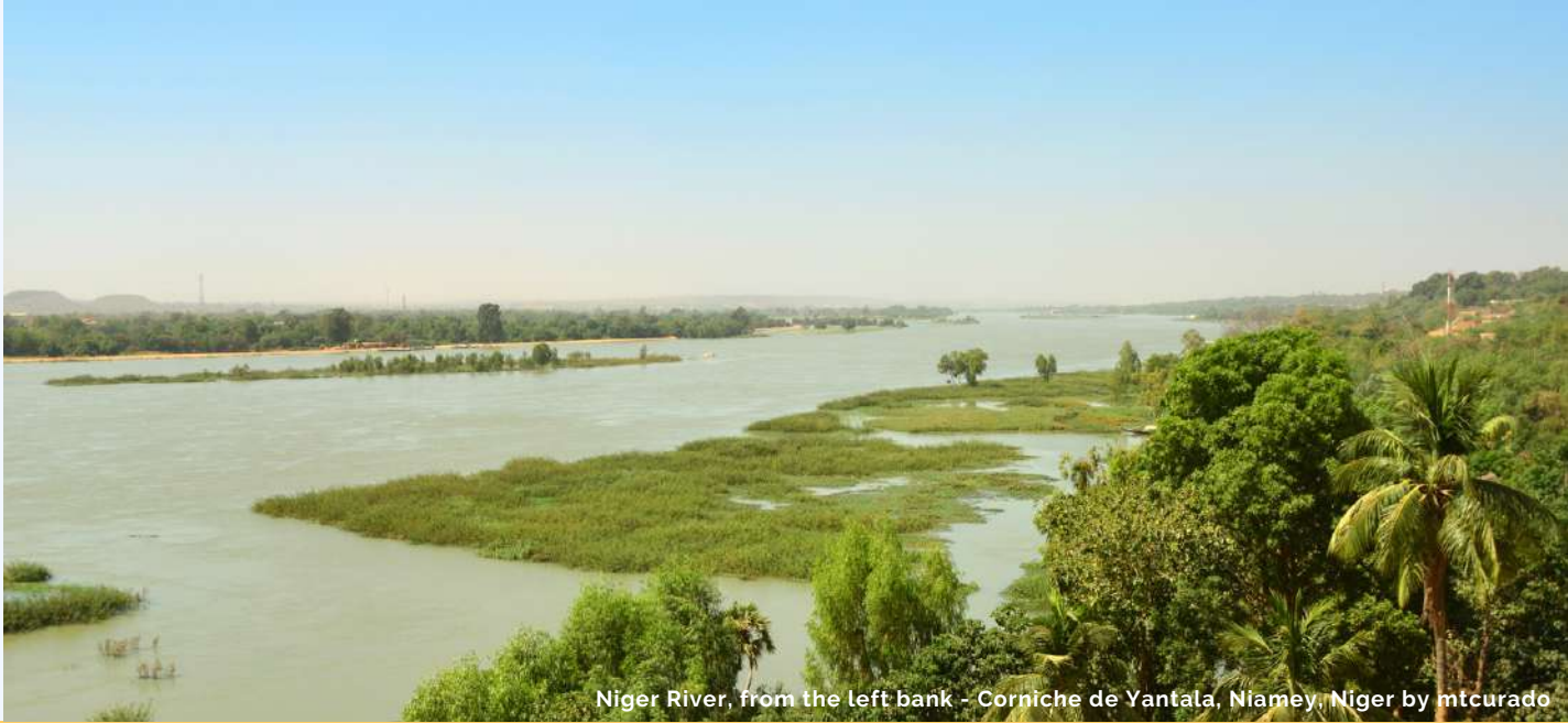
Niger River, from the left bank - Corniche de Yantala, Niamey, Niger by mtcurado

Niger plans to improve its touristic accommodation capacity by favouring more environmentally friendly ecotourism, particularly in biosphere reserves, the Addax Sanctuary and other protected areas. The country is also developing a master plan for sustainable tourism development, training tourist guides, organizing events and developing the green belt of Niamey. Iceland emphasizes responsible tourism and treating the land with consideration and respect for nature; an approach supported by measurable factors for sustainability and social responsibility. The country's overarching strategy for tourism aligns with a project on sustainable food tourism (2019-2020) under Iceland's Presidency of the Nordic Council of Ministers. Investing in sustainable tourism can also be a strategy for economic diversification, as stated by Liberia , which proposes to capitalize on ecotourism to conserve biodiversity, reduce deforestation and generate revenue. In 2020, the Liberian Government signed a Memorandum of Understanding with the Green Ecovillage Network for the construction of Green Ecovillages that will focus on the regeneration of natural environments, the preservation of cultural heritage and the improvement of the livelihoods of various communities.