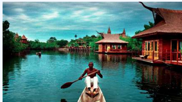
Ministry of Tourism and Culture The Gambia

In The Gambia , the Ministry of Tourism and Culture has launched a revision of the country's national tourism and culture policy to realign tourism with the eight strategic priorities of the National Development Plan 2018-2021, which includes inclusive and culture-centred tourism.