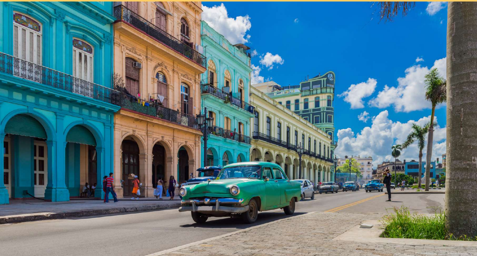
Havana, Cuba

T he COVID-19 pandemic has stopped cultural tourism in its tracks. Throughout 2020 international arrivals plunged by 74% worldwide , dealing a massive blow to the sector, which faces ongoing precarity and unpredictability. Amidst international travel restrictions, border closures and physical distancing measures, countries have been forced to impose widespread closures of heritage sites, cultural venues, festivals and museums, some of which may never reopen.