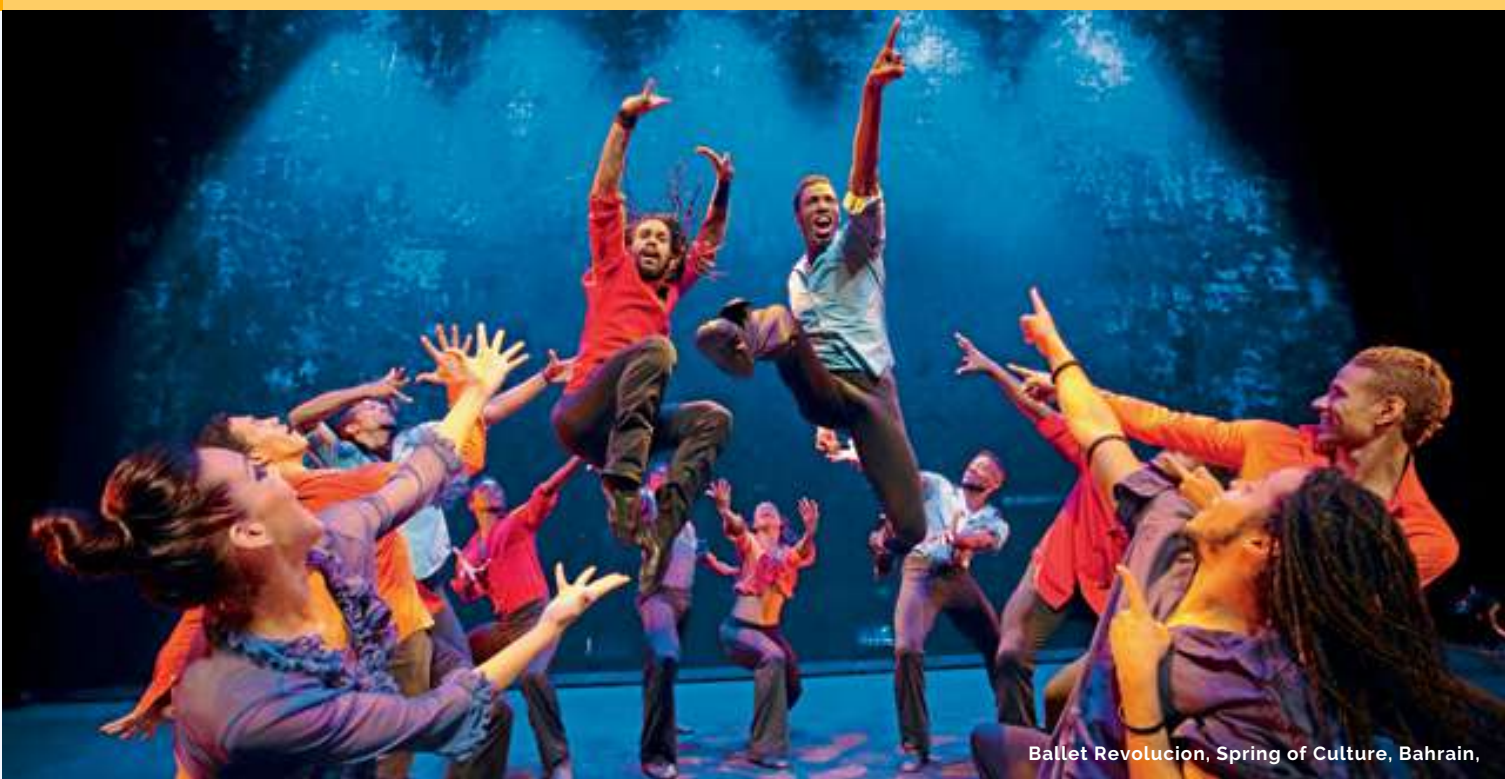
Ballet Revolucion, Spring of Culture, Bahrain,

As noted by several countries in their VNRs, safeguarding cultural heritage can stimulate tourism to strengthen or diversify local and national economies, as well as broaden participation in the global economy. This approach is underlined by the Bahrain Authority of Culture and Antiquities that highlights how its culture-based programmes "Spring of Culture", "Pearl Road" and "Our Heritage is Our Wealth" have been instrumental in promoting tourism. Greece's National Growth Strategy distinguishes cultural heritage, cultural and creative industries and tourism as one of eight priority areas for the country, which it considers integral to the country's globally competitive tourism product. The Greek Government is working on numerous projects to safeguard and raise awareness about the country's rich cultural heritage comprising archeological sites, museums and monuments. Heritage mapping, conservation and tourism are at the heart of an Interamerican Development Bank project in Bahamas that targets job creation for tour guides, researchers and other cultural professionals.