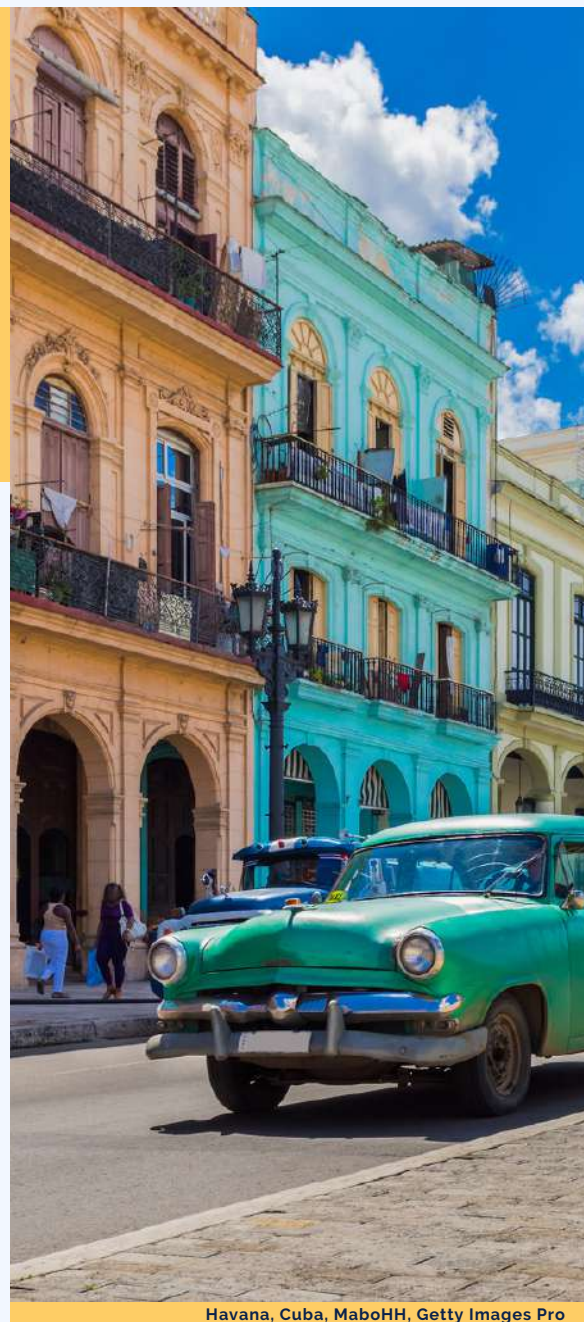
Havana, Cuba, MaboHH, Getty Images Pro

See Find Out More for recent updates from UNESCO.