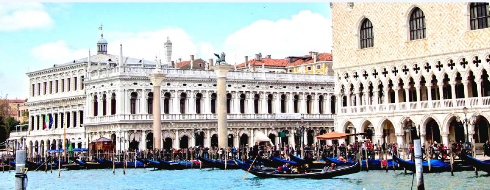
Venice, Oliver Dralam/Getty Images

While state-led policy interventions in cultural tourism remain crucial, local authorities are increasingly vital stakeholders in the design and implementation of cultural tourism policies. Being close to the people, local actors are aware of the needs of local populations, and can respond quickly and provide innovative ideas and avenues for policy experimentation. As cultural tourism is strongly rooted to place, cooperating with local decision-makers and stakeholders can bring added value to advancing mutual objectives. Meanwhile, the current health crisis has severely shaken cities that are struggling due to diminished State support, and whose economic basis strongly relies on tourism. Local authorities have been compelled to innovate to support local economies and seek viable alternatives, thus reaffirming their instrumental role in cultural policy-making.