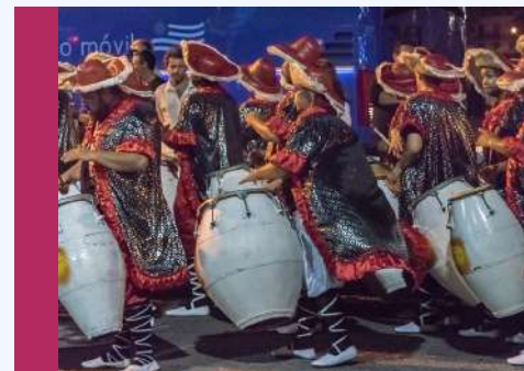
DanFLCreativo, Canva Pro

Uruguay has stepped up efforts to strengthen its orange economy. The Ministry of Education and Culture (MEC) and the National Institute of Employment and Vocational Training (Inefop) have signed an agreement to streamline employment policies in the creative economy. In addition, the Uruguayan Association of Sound Recorders (ASU) and the Uruguay Ilumina collective signed a specific agreement to provide training and labour certification.