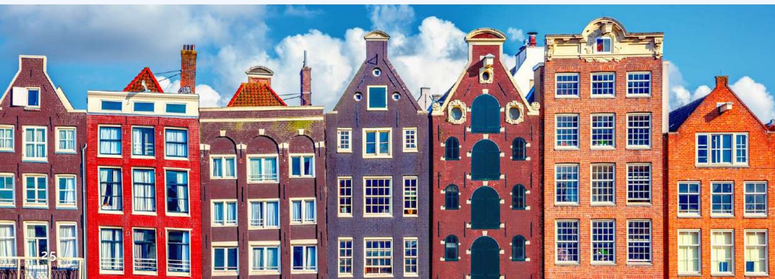
Houses in Amsterdam

While the pandemic has dramatically shifted the policy context for cultural tourism, it has also provided the opportunity to experiment with integrated models that can be taken forward in the post-pandemic context. While destinations are adopting a multiplicity of approaches to better position sustainability in their plans for tourism development, there is no one-size-fits-all solution.