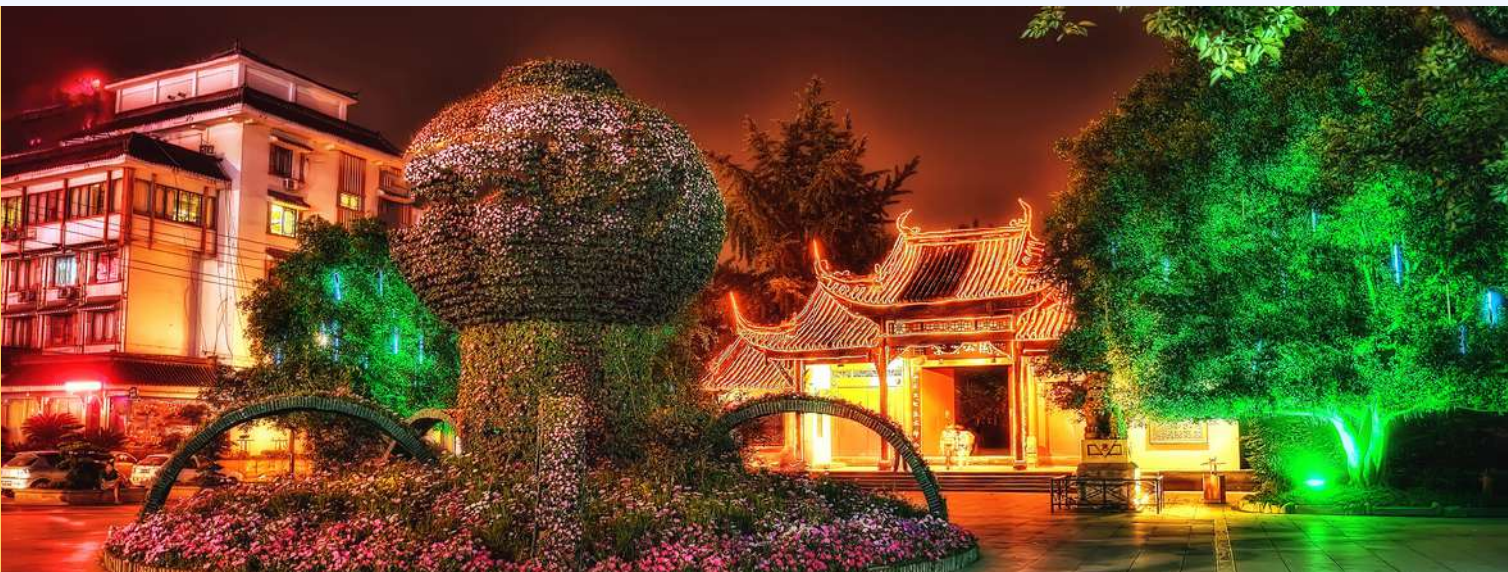
Chengdu Town Square, China by Lukas Bischoff