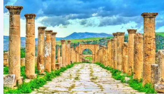
The ruins of Djémila in Algeria.

In Algeria , the Ministry of Culture and Arts and the Algerian Confederation of Employers (CAP) have signed a partnership agreement to launch investments and economic projects in culture and the arts . The agreement supports the Ministry of Culture and Arts' endeavours to forge closer links between culture and the economy in accordance with the country's economic recovery plan.