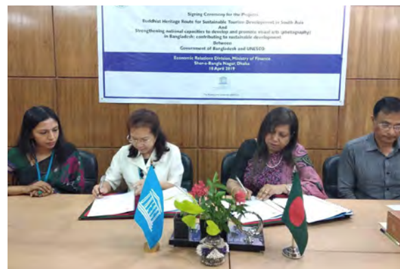
On 18 April 2019, the Ministry of Finance (ERD), the Ministry of Cultural Affairs, and UNESCO officially signed off and launched the project.

The project further contributed to the achievement of the Agenda 2030 for Sustainable Development and the Sustainable Development Goals (SDGs), including by contributing to SDG 8.3 “Promote development-oriented policies that support productive activities, decent job creation, entrepreneurship, creativity and innovation, and encourage the formalization and growth of micro-, small- and medium-sized enterprises, including through access to financial services” .