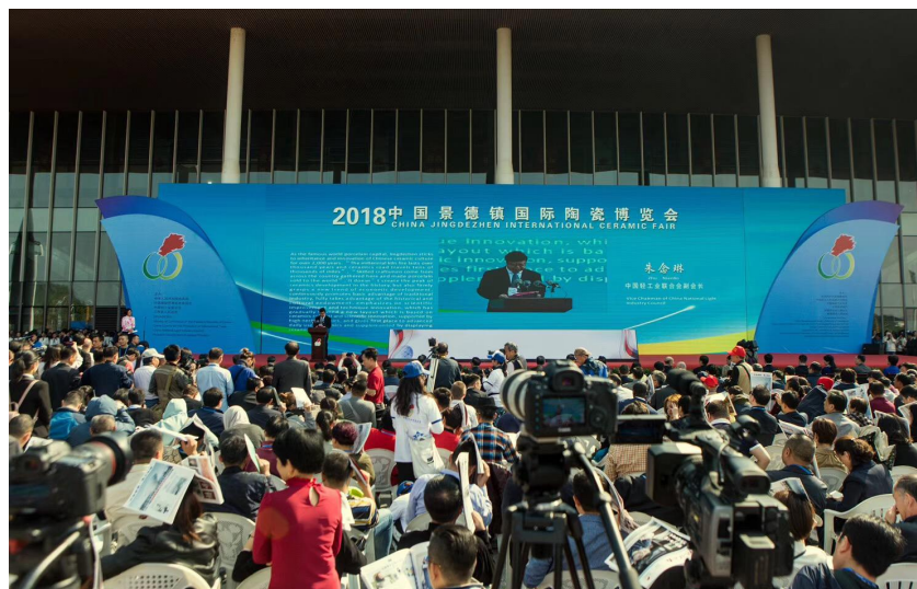
( The Opening Ceremony of China Jingdezhen International Ceramic Fair 2018)

Every October, in China Jingdezhen International Ceramic Fair, co-sponsored by the Ministry of Commerce, the China Council for the Promotion of International Trade, the China Light Industry Federation and the Jiangxi Provincial People's Government, we will offer 1900 standard booths. The exhibitors cover the major ceramic producing areas in France, the United States, the United Kingdom, Russia, the Netherlands, Germany, Italy, Turkey, South Korea, Japan and other representative enterprises of China's famous kilns. The exhibits cover art ceramics, domestic ceramics, industrial ceramics, high-tech ceramics, architectural bathroom ceramics, etc.