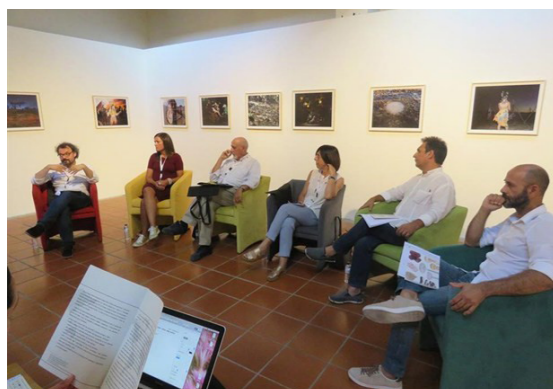
2CN-CLab (Cultural Cooperation Networks – Creative Laboratory) aims to promote

critical and constructive discussion on cultural cooperation networks and, thereby, to sensitize and empower the stakeholders to participate in this kind of organizations.