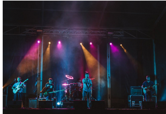
17-21 July 2019, Idanha-a-Nova. Hosted UCCP cities: Braga (Media Arts), Amarante (Music)

Financial and/or in-kind support provided to UNESCO in order to strengthen the sustainability of the UCCP in different areas including management, communication and visibility