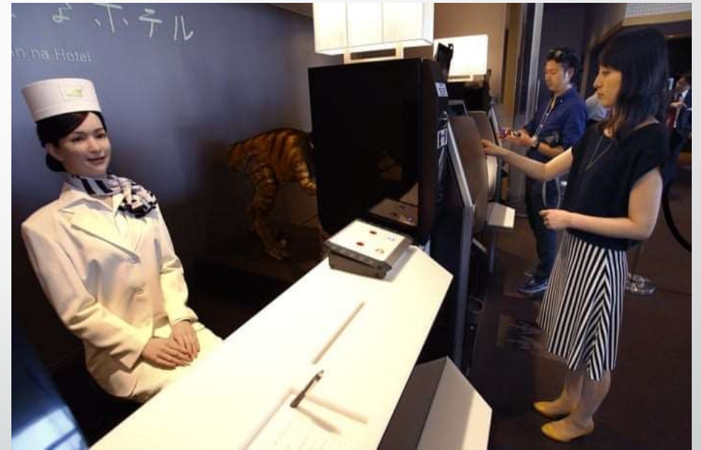
A humanoid robot at a hotel reception (Japan)