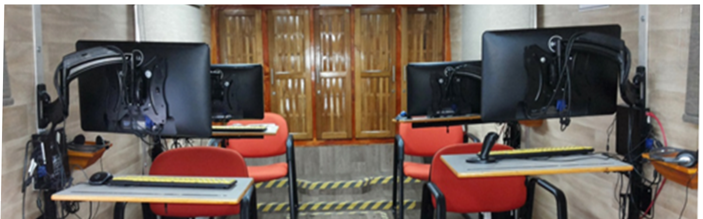
Inside the Assistive Technology Bus.

The UWI, St. Augustine Campus, School of Education, embarked on a pilot project to train TVET teachers, instructors and Workforce Development (WFD) leaders in the use of online assistive technologies to support TVET students and employees with disabilities.