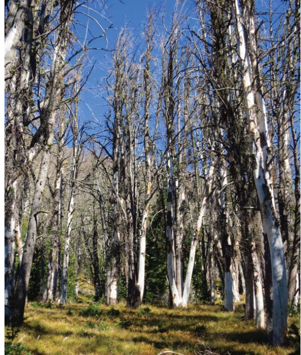
The whitebark pine is under severe threat from beetle infestations driven by a warming climate.

The combination of changed fire regimes, more frequent and severe outbreaks of insect pests and a shift to hotter and drier conditions will eventually change the vegetation of Yellowstone. Different tree species from those of today may dominate