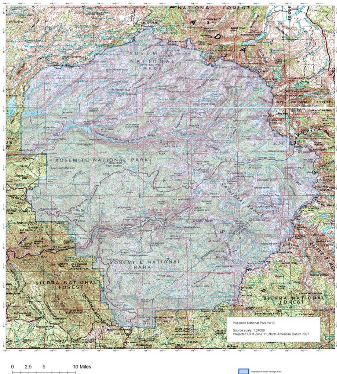
Fig. 2: Yosemite National Park (United States of America)