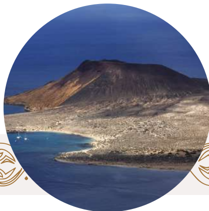
Lanzarote UGGp (Spain)

4,800 km 2 of land and 13,000 km 2 of sea area, with a population of 288,771.