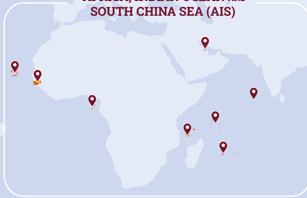
AFRICA, INDIAN OCEAN AND SOUTH CHINA SEA (AIS)