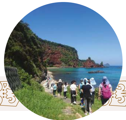
Oki Island UGGp (Japan)

Its total surface is 2,500 km 2 , comprising 866 km 2 of land with 151.000 inhabitants.