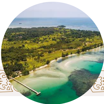
Belitong UGGp (Indonesia)

Among the 169 existing UNESCO Geoparks, 10% are base in small islands where they play an essential role for geological heritage conservation and promotion, climate change awareness, population involvement and establishment of new strategies for geotourism and integrated sustainable economical development.