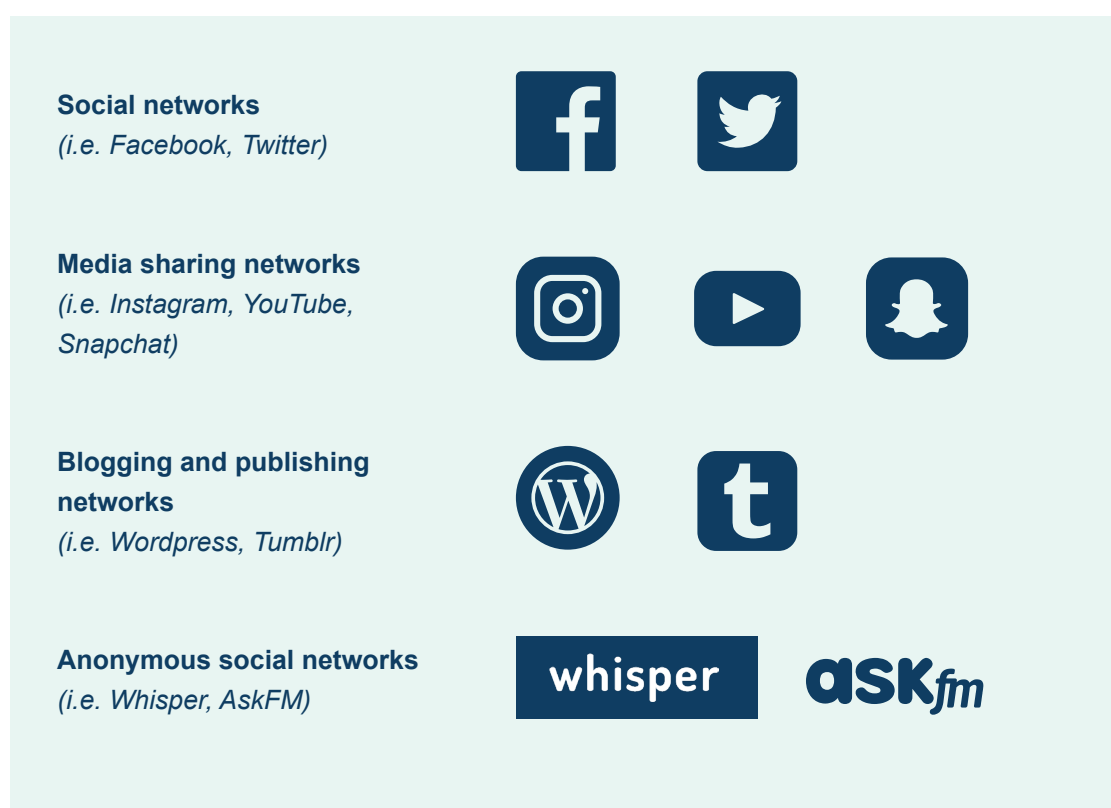
Figure 4. Some examples of social media

It can also be useful to identify different categories of social media, and discuss how they work, what the audience is, and why people use them. Social media includes: