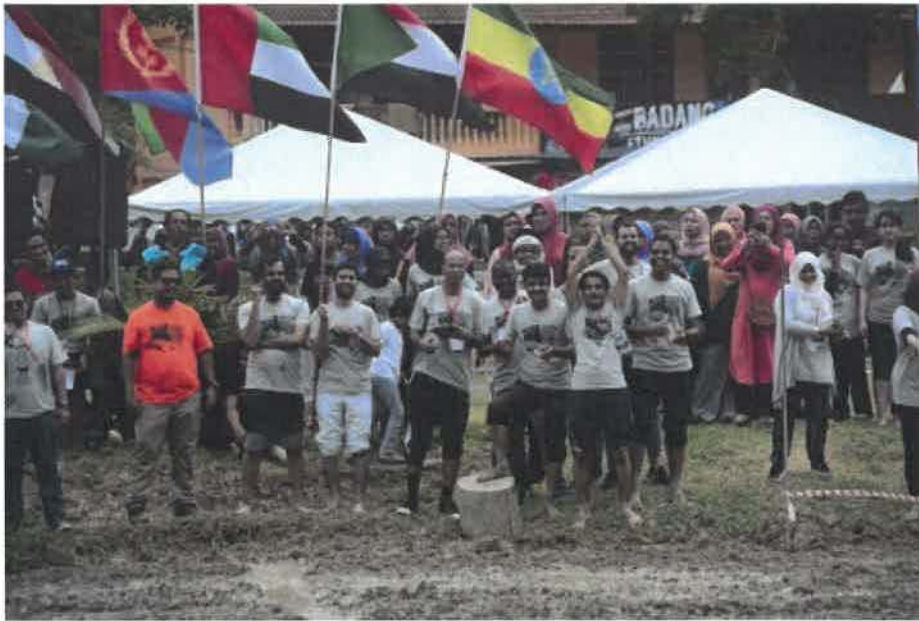
batu seremban – dice game,