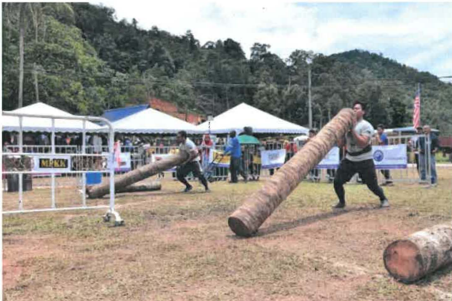
In the traditional games of Badang, the following competitions presented: pencak silat martial art,