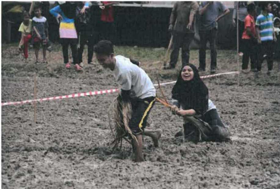
bendang - ball game on rice paddy in mud,