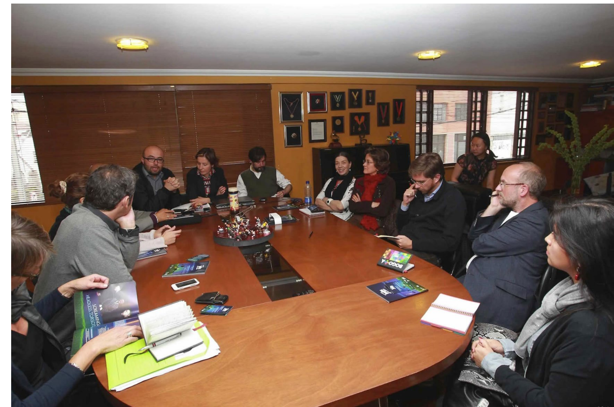
Above: UCCN Music Cluster Meeting Bogota 2012: Bogota, Bologna, Gent, Glasgow, Sevilla,

Having 20 submissions and 19 member cities, Cluster members agree to evaluate at least one city in depth. Bogota evaluated one city.