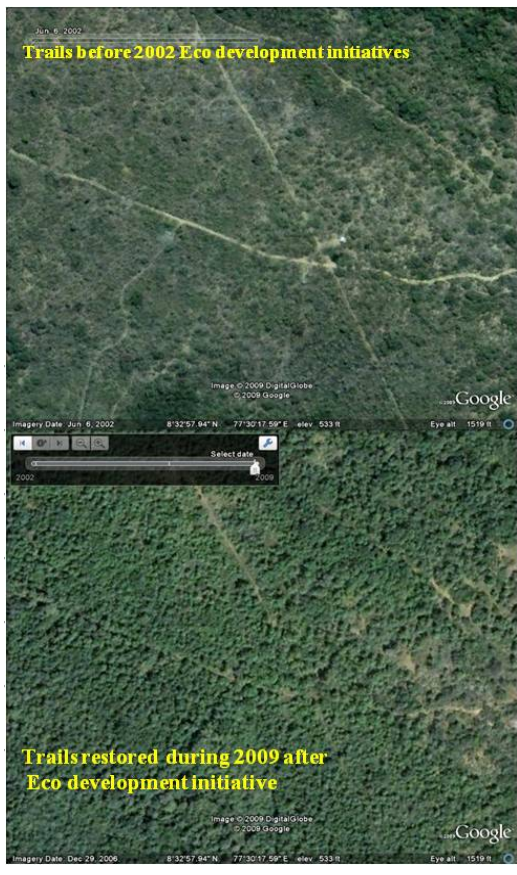
Figure 6: The impact of eco-development initiatives in the ABR

participation in the content of the Biosphere participation in the content of the Biosphere participation initiatives enabled livelihood improvement and participatory biodiversity conservation and thus women empowerment.