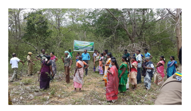
Figure 3: Dialogue on Forest perambulation mesures

from 2002 – 2014, 116 grass root level institutions constituted in the fringe villages of the Biosphere Reserve. Communities were reached right at the doorstep and face to face interactions held which enabled high level of trust and credibility building.