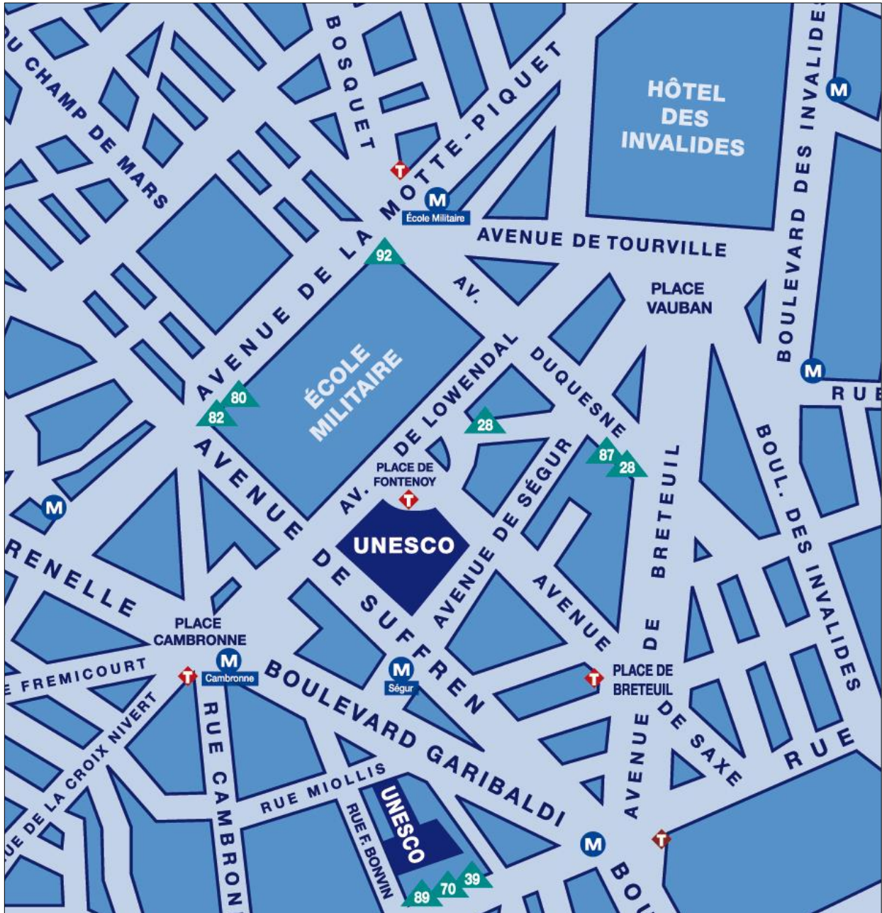
Map 1: The area near UNESCO